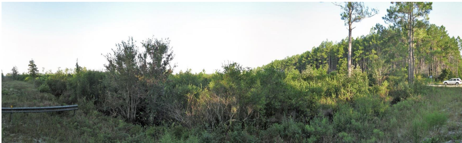
Tates Hell (Pine Log Creek) Panoramic Photo Point 2 – 9/17/2013