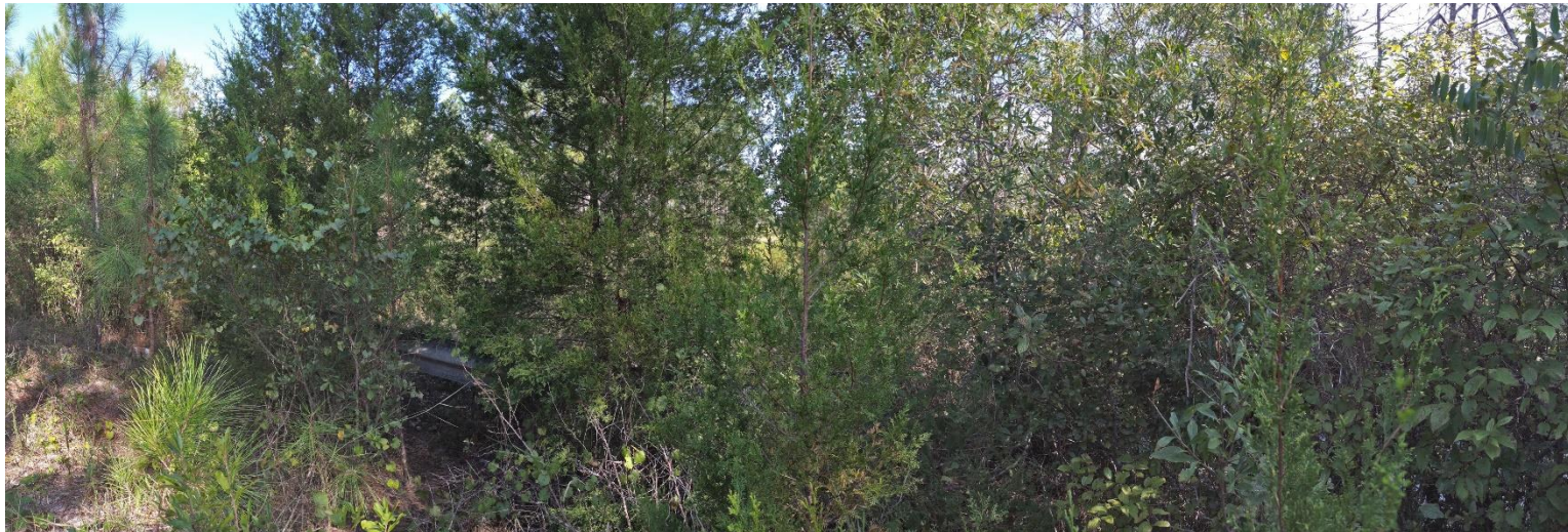
Tates Hell (Pine Log Creek) Panoramic Photo Point 2 – 9/16/2022