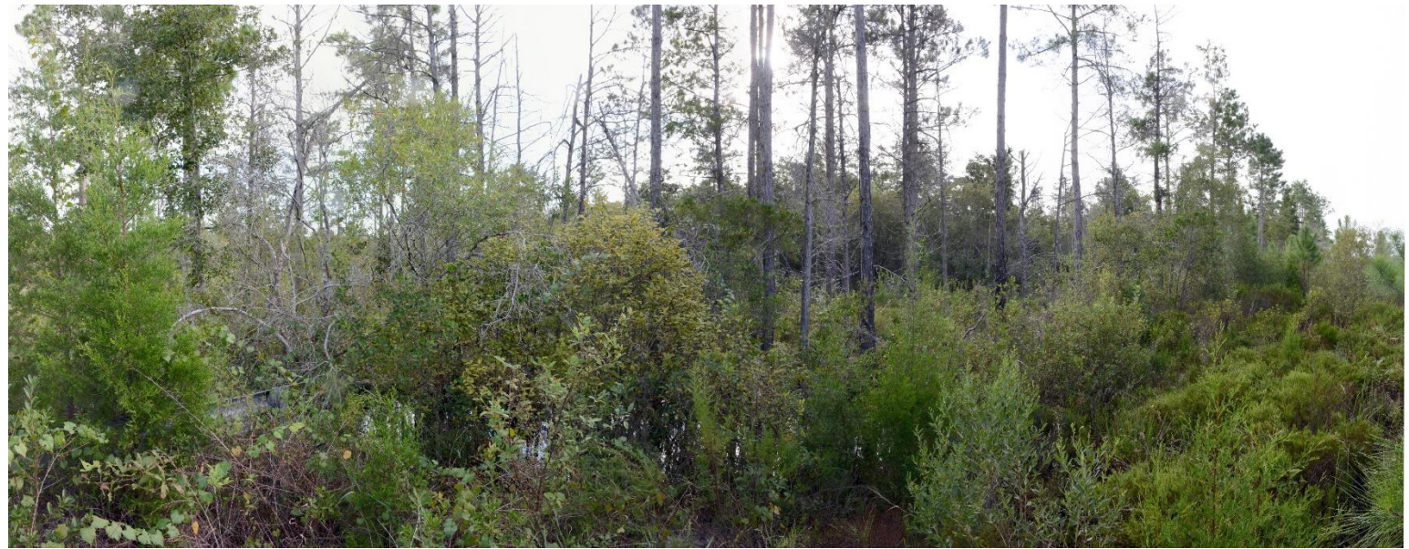
Tates Hell (Pine Log Creek) Panoramic Photo Point 2 – 9/22/2020