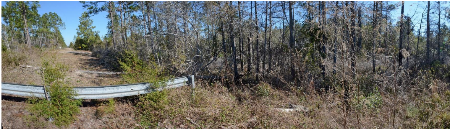
Tates Hell (Pine Log Creek) Panoramic Photo Point 2 – 1/11/2019