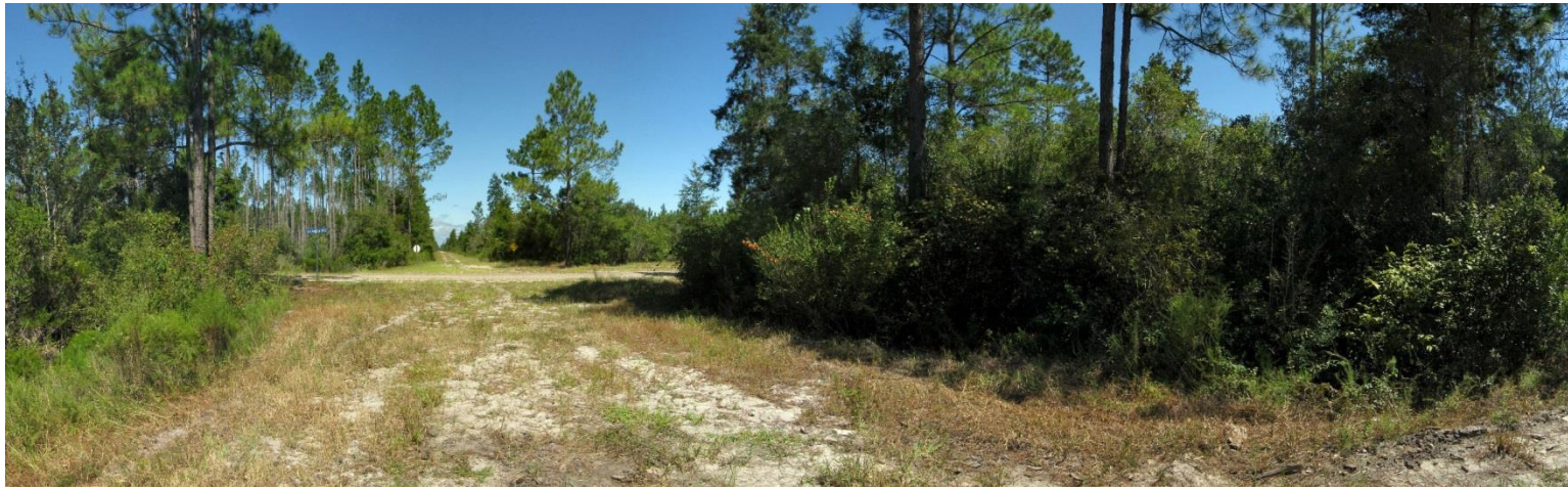
Tates Hell (Pine Log Creek) Panoramic Photo Point 2 – 9/25/2015