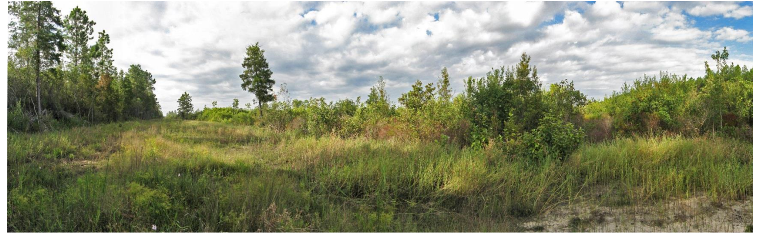
Tates Hell (Pine Log Creek) Panoramic Photo Point 2 – 9/12/2012