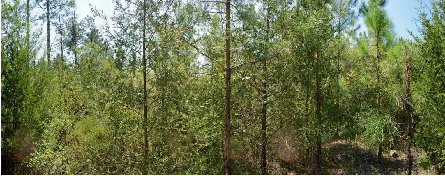
Tates Hell (Pine Log Creek) Panoramic Photo Point 2 – 9/19/2023