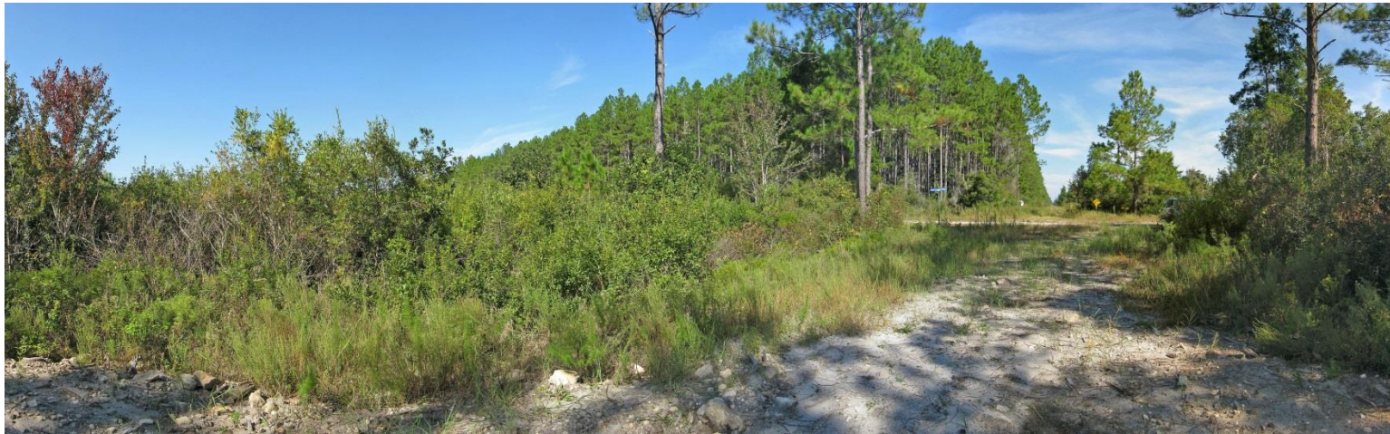
Tates Hell (Pine Log Creek) Panoramic Photo Point 2 – 10/9/2014