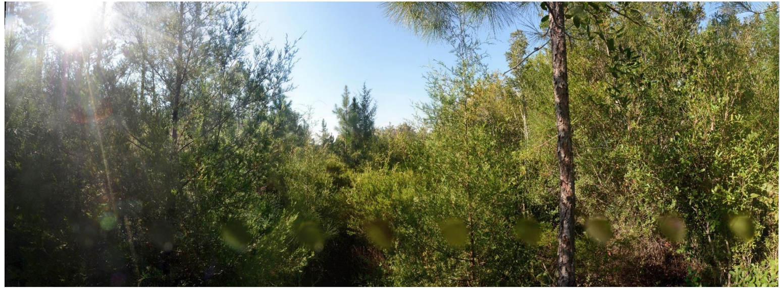
Tates Hell (Pine Log Creek) Panoramic Photo Point 2 – 9/30/2021