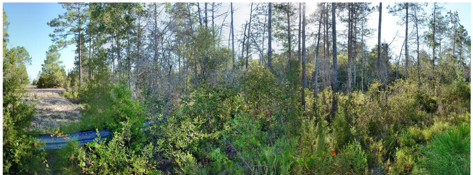
Tates Hell (Pine Log Creek) Panoramic Photo Point 2 – 9/24/2019