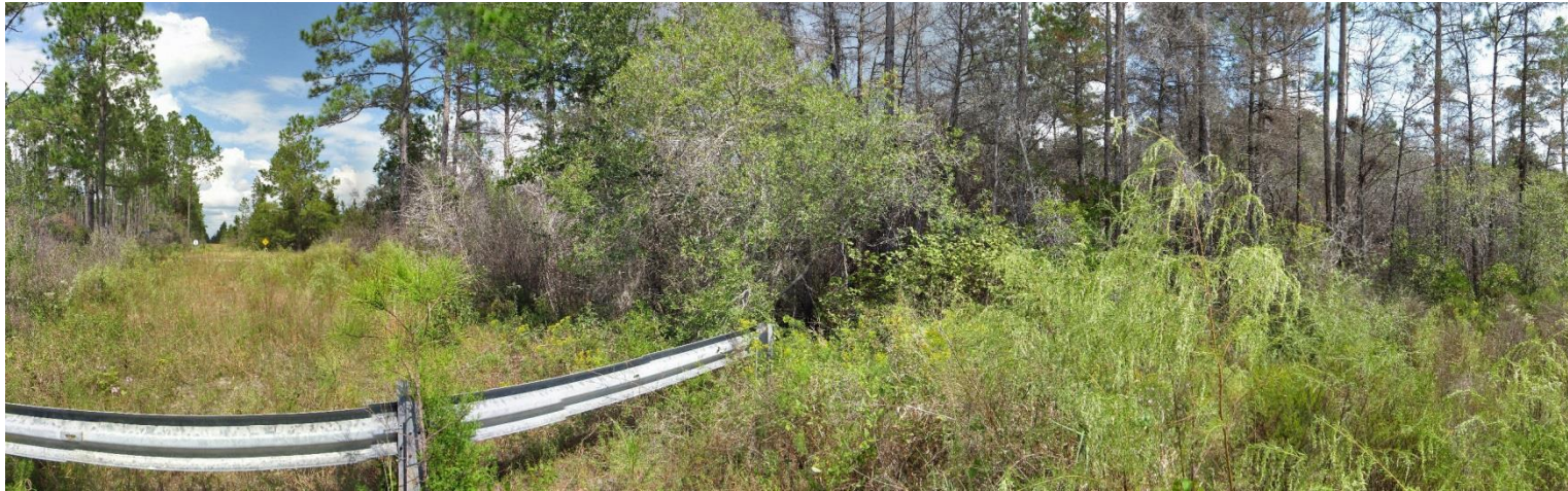
Tates Hell (Pine Log Creek) Panoramic Photo Point 2 – 10/10/2017