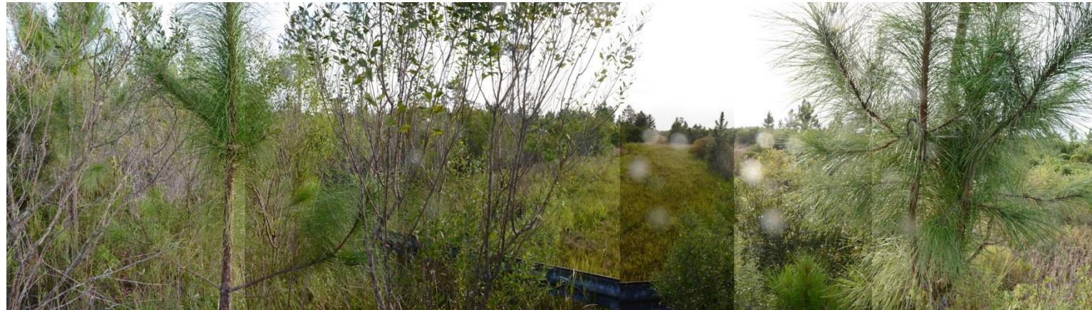
Tates Hell (Pine Log Creek) Panoramic Photo Point 4 – 9/22/2020