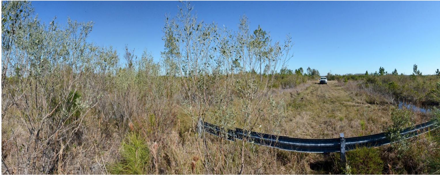
Tates Hell (Pine Log Creek) Panoramic Photo Point 4 – 1/11/2019