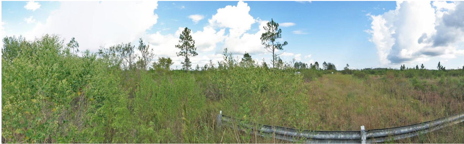
Tates Hell (Pine Log Creek) Panoramic Photo Point 4 – 10/10/2017