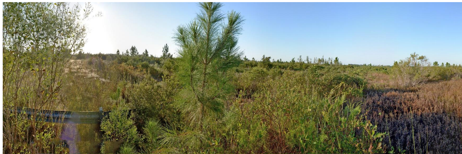
Tates Hell (Pine Log Creek) Panoramic Photo Point 4 – 9/24/2019