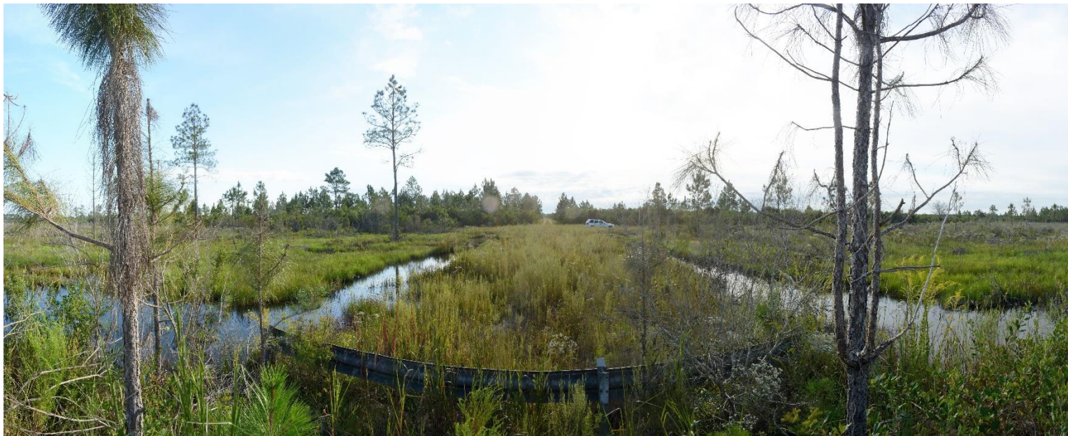
Tates Hell (Pine Log Creek) Panoramic Photo Point 4 – 9/16/2022