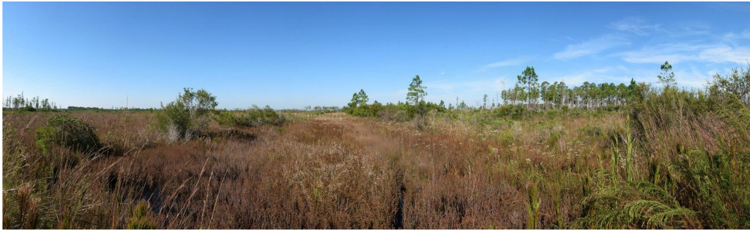
Tates Hell (Pine Log Creek) Panoramic Photo Point 4 – 10/9/2014