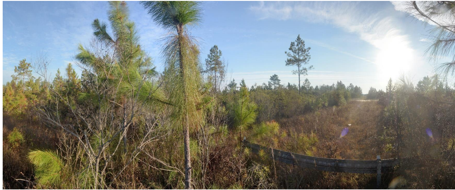
Tates Hell (Pine Log Creek) Panoramic Photo Point 4 – 9/30/2021