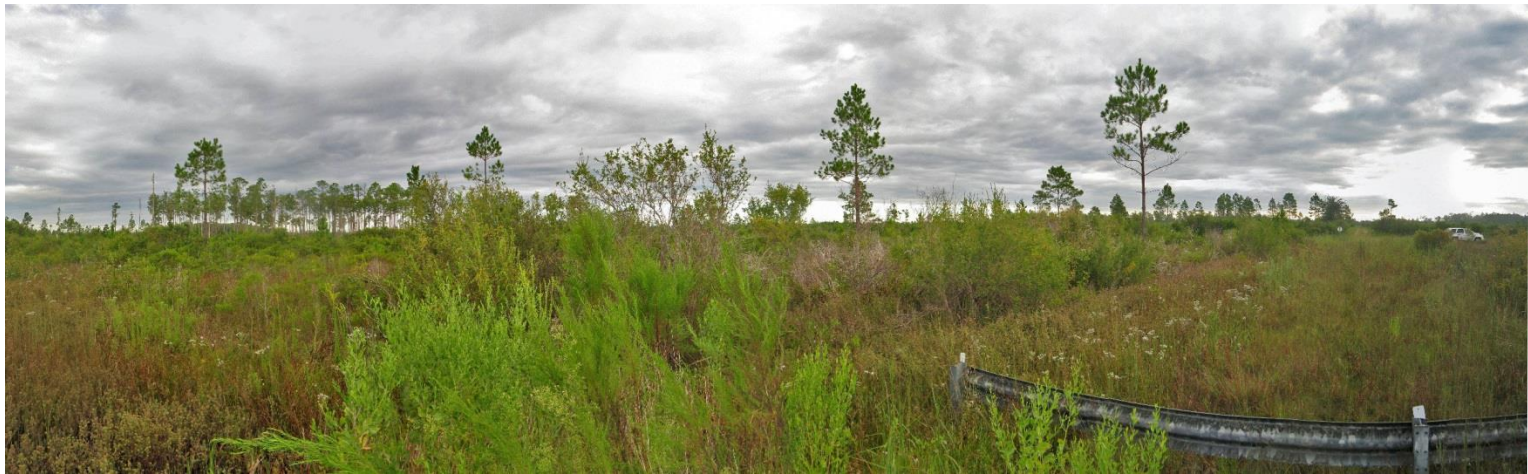
Tates Hell (Pine Log Creek) Panoramic Photo Point 4 – 9/16/2016