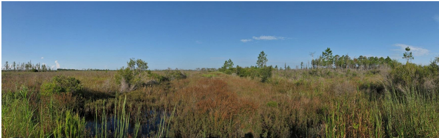
Tates Hell (Pine Log Creek) Panoramic Photo Point 4 – 9/17/2013