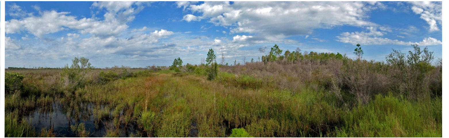
Tates Hell (Pine Log Creek) Panoramic Photo Point 4 – 9/12/2012