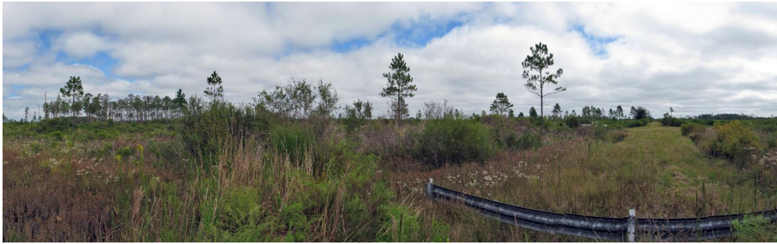
Tates Hell (Pine Log Creek) Panoramic Photo Point 4 – 9/25/2015