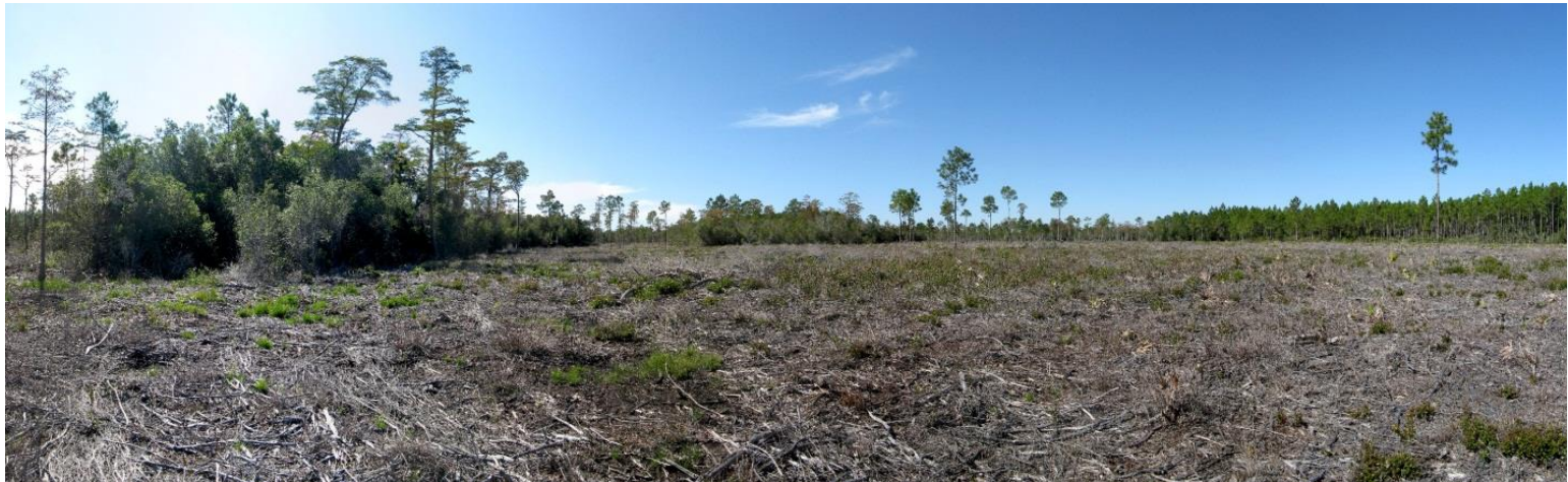
Ward Creek West Photo Point No. 2 – 11/5/2009