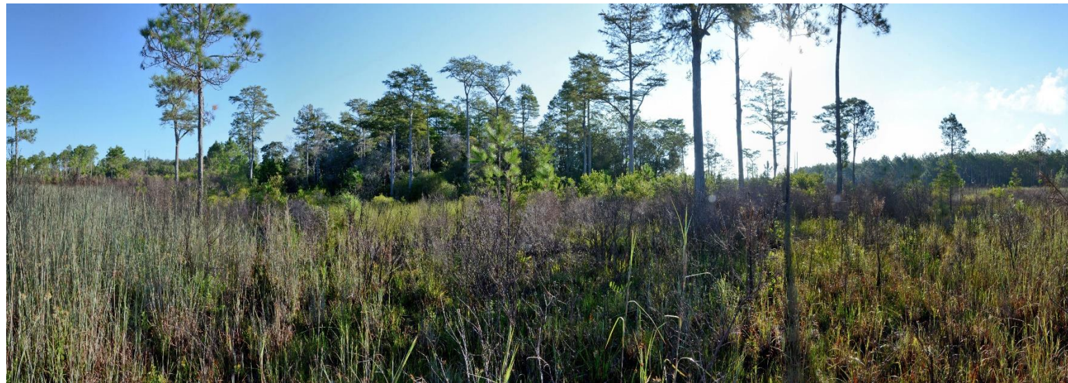
Ward Creek West Photo Point No. 2 – 9/18/2018