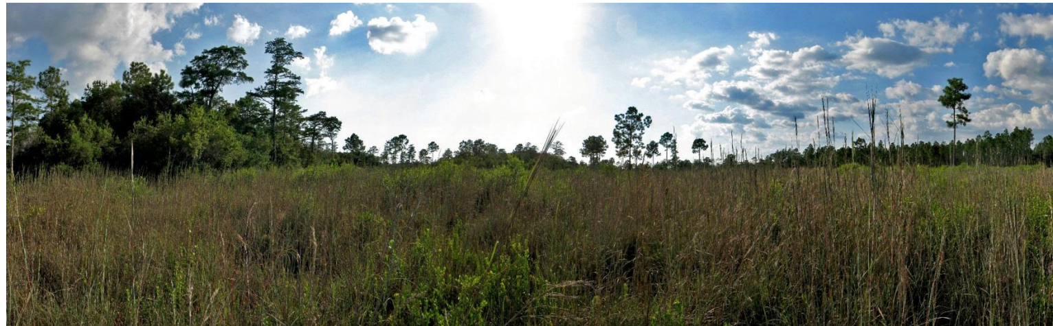
Ward Creek West Photo Point No. 2 – 9/10/2013