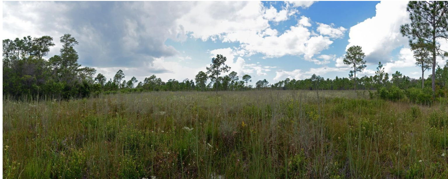
Ward Creek West Photo Point No. 2 – 9/22/2023