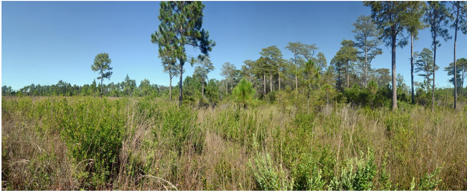
Ward Creek West Photo Point No. 2 – 9/23/2021