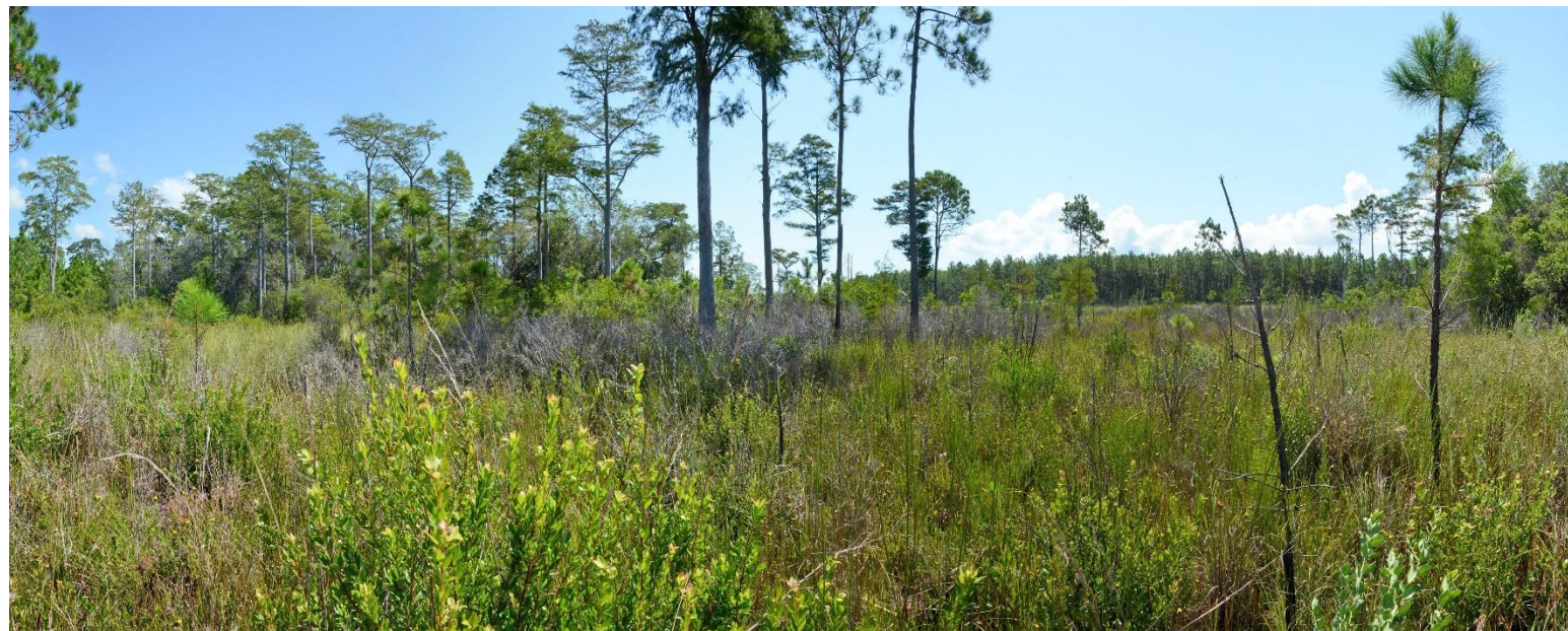
Ward Creek West Photo Point No. 2 – 9/11/2019