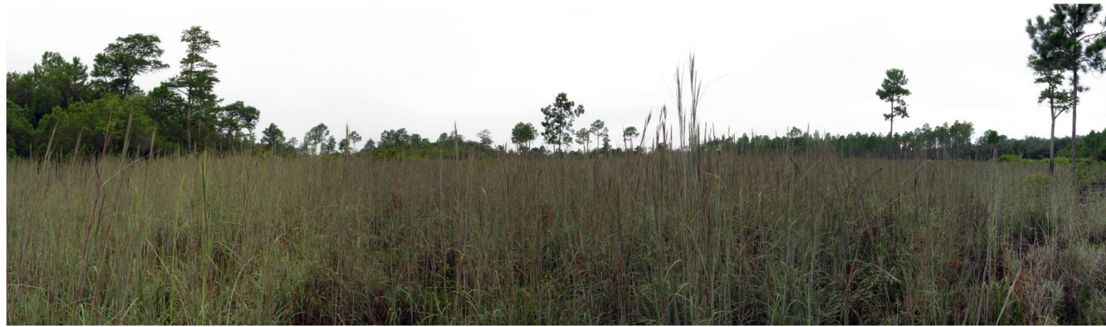
Ward Creek West Photo Point No. 2 – 9/19/2014