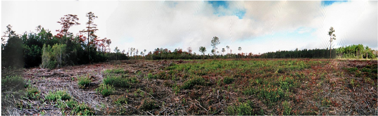
Ward Creek West Photo Point No. 2 – 11/13/2008