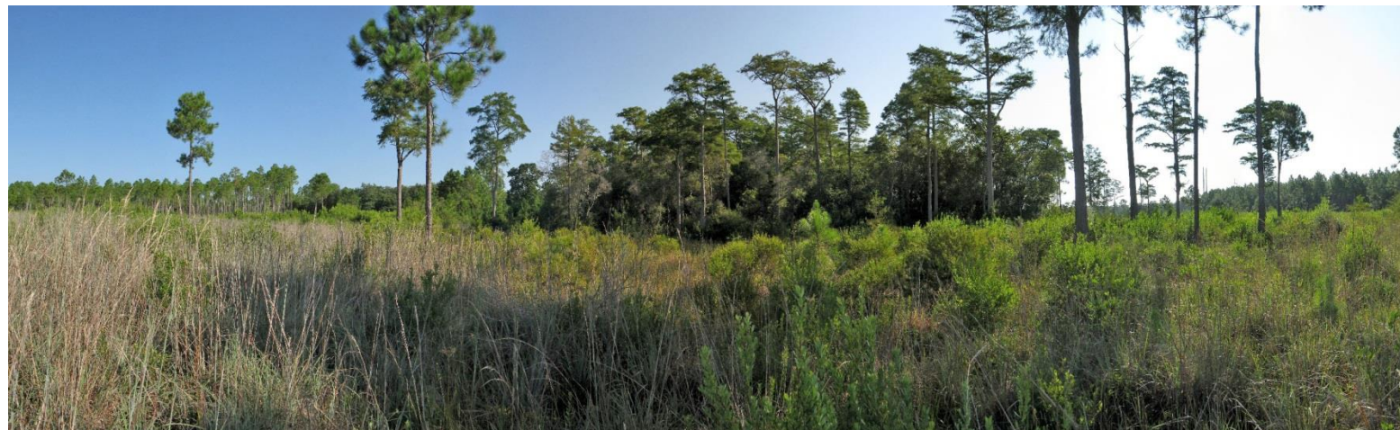
Ward Creek West Photo Point No. 2 – 9/8/2016