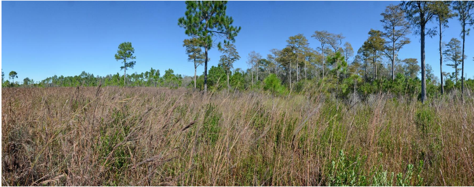
Ward Creek West Photo Point No. 2 – 10/30/2020