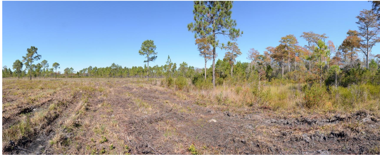
Ward Creek West Photo Point No. 2 – 10/27/2022