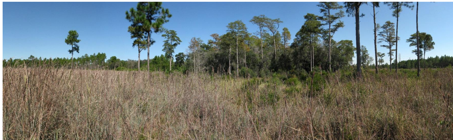
Ward Creek West Photo Point No. 2 – 10/15/2015