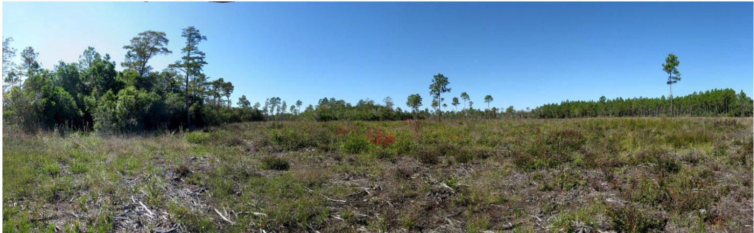
Ward Creek West Photo Point No. 2 – 10/29/2010