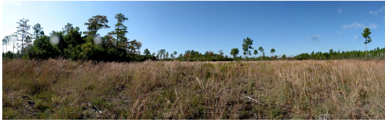
Ward Creek West Photo Point No. 2 – 11/2/2011