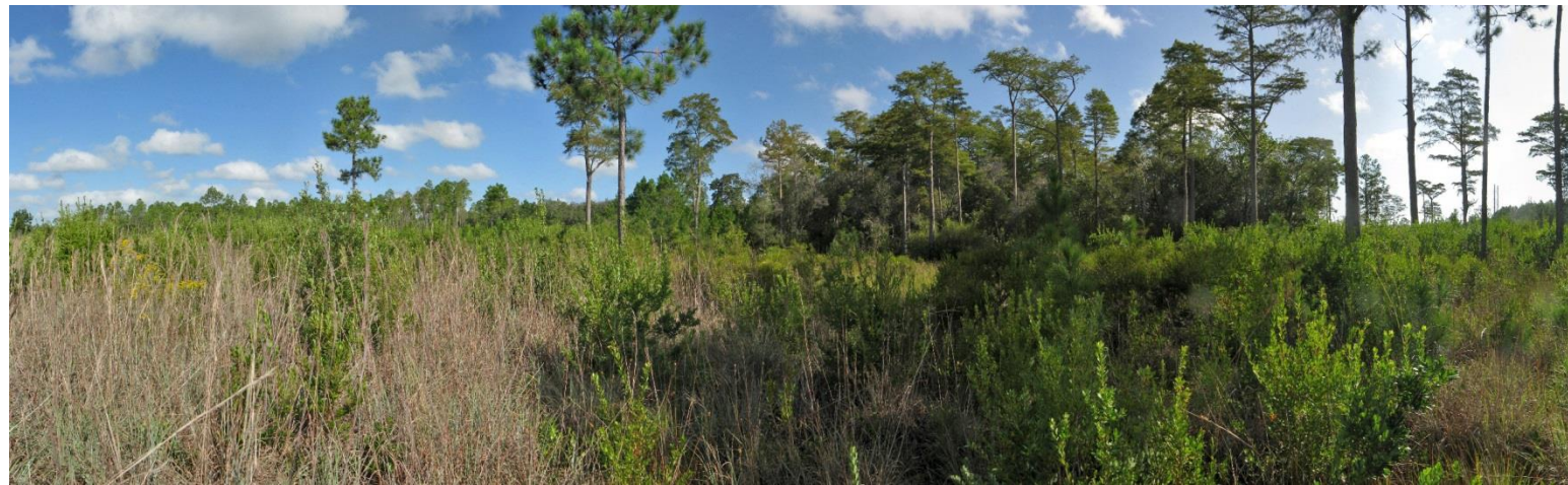
Ward Creek West Photo Point No. 2 – 10/4/2017