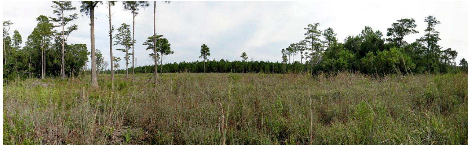
Ward Creek West Photo Point No. 2 – 9/19/2012