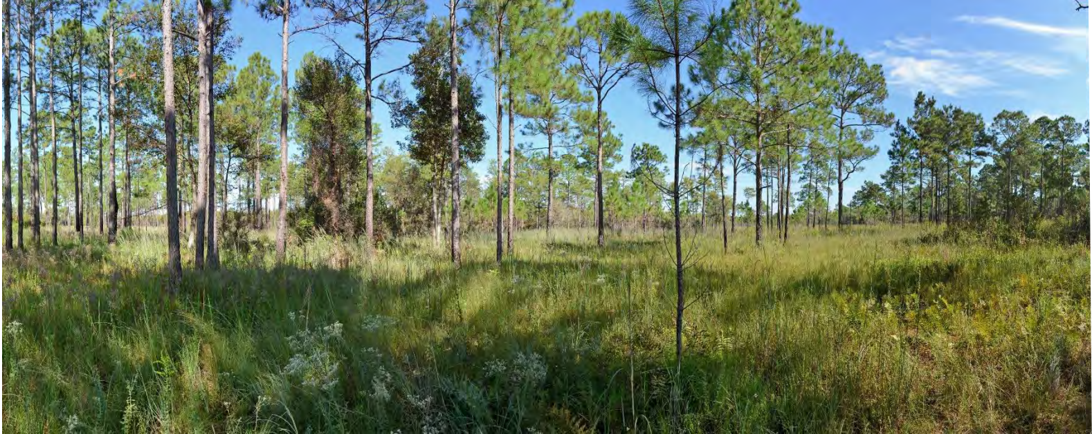
P10 – 2023 (9/29/2023)