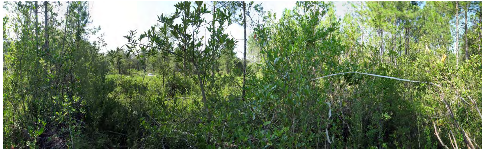
P10 – 2007 (11/01/2007)