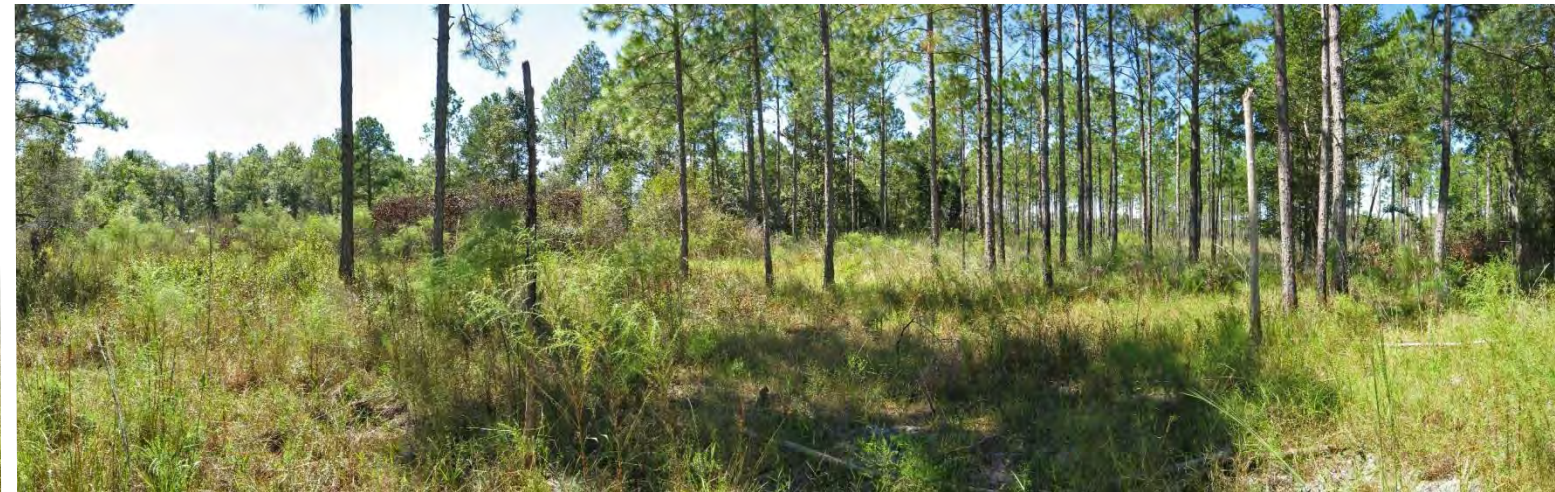
P10 – 2015 (9/23/2015)