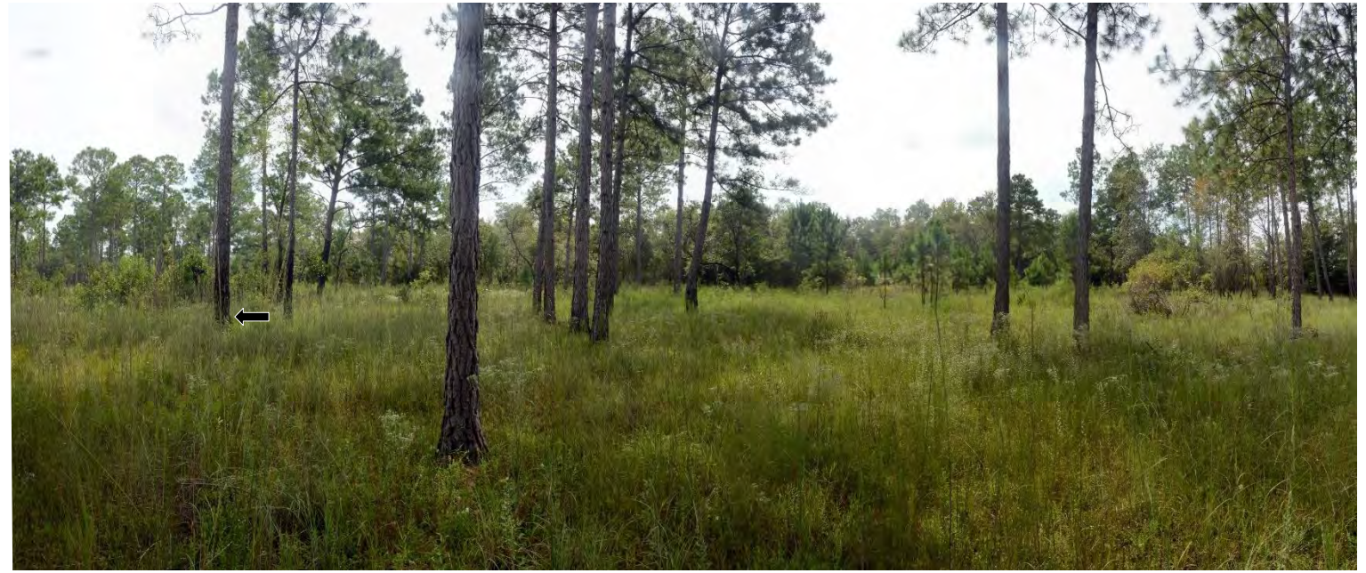
P10 – 2020 (10/16/2020)