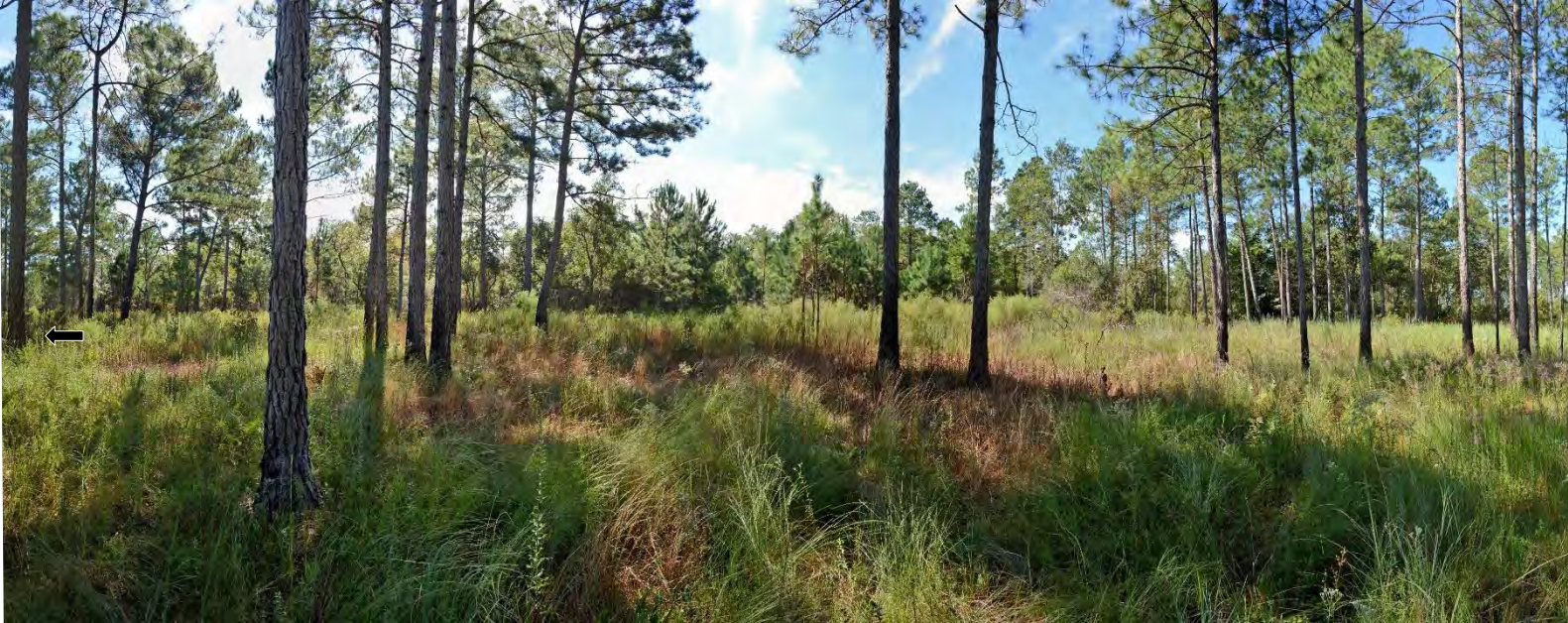
P10 – 2022 (9/27/2022)