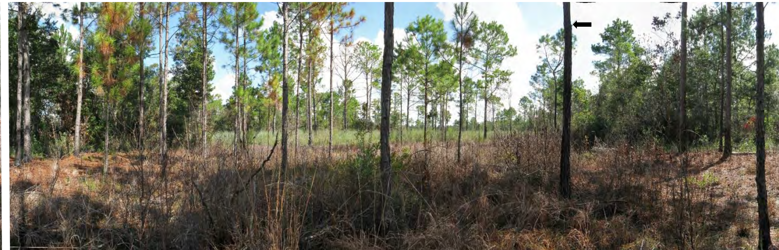
P10 – 2012 (9/14/2012)