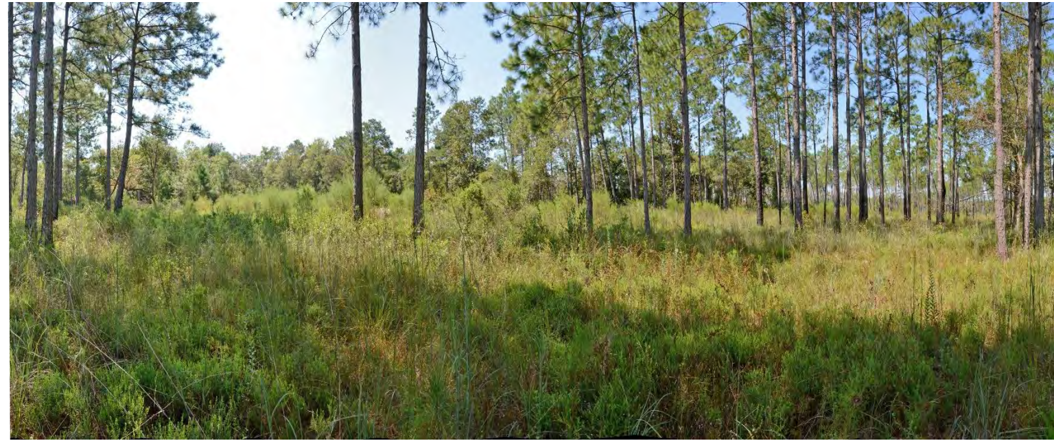
P10 – 2018 (9/14/2018)