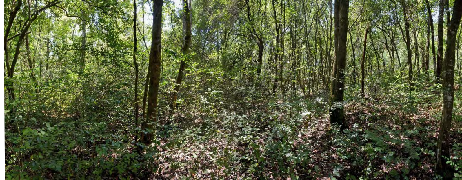
P12 – 2017 (10/19/2017) [Approximate Location of P12; Exact Location Not Accessible Due to Large Tree Fall]