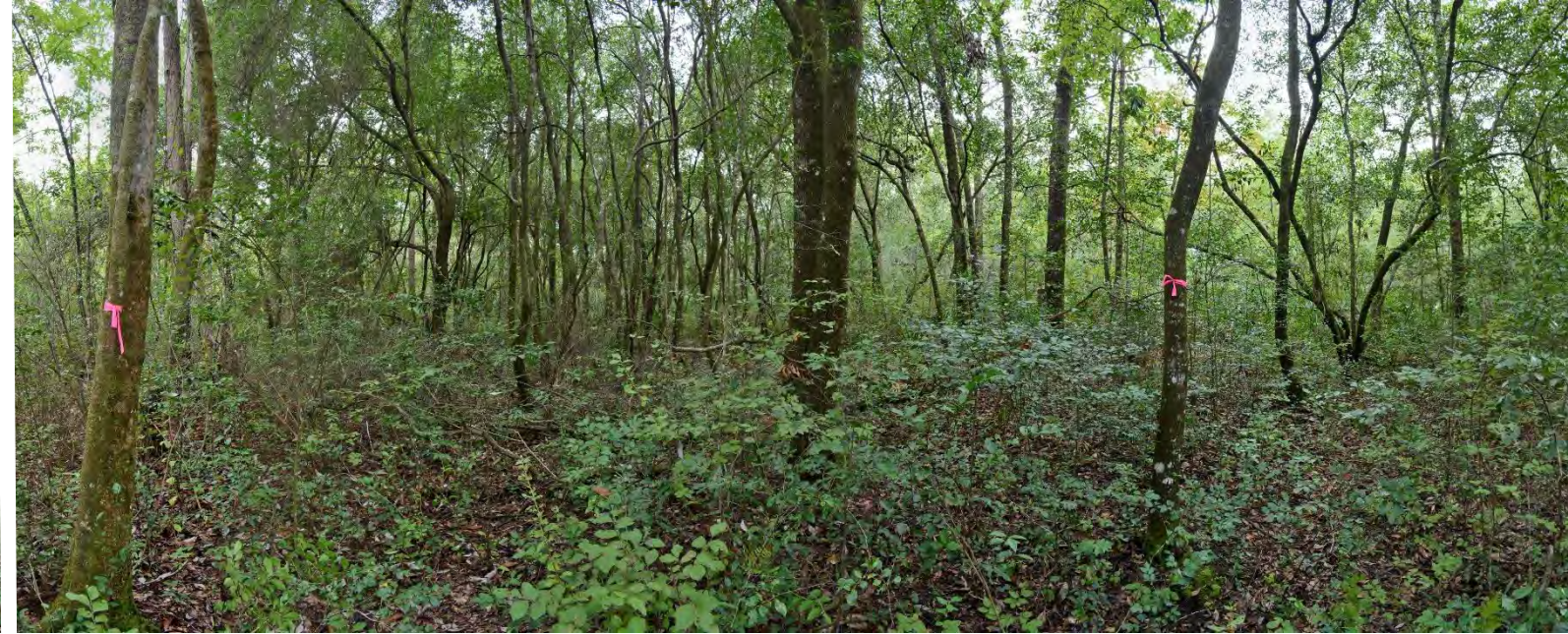
P12 – 2022 (9/27/2022) [Approximate Location of P12; Exact Location Not Accessible Due to Large Tree Fall]