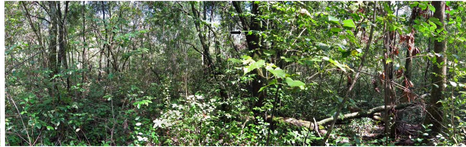
P12 – 2012 (9/14/2012)