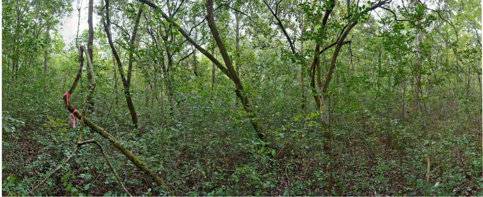
P12 – 2023 (9/26/2023) [Approximate Location of P12; Exact Location Not Accessible Due to Large Tree Fall]