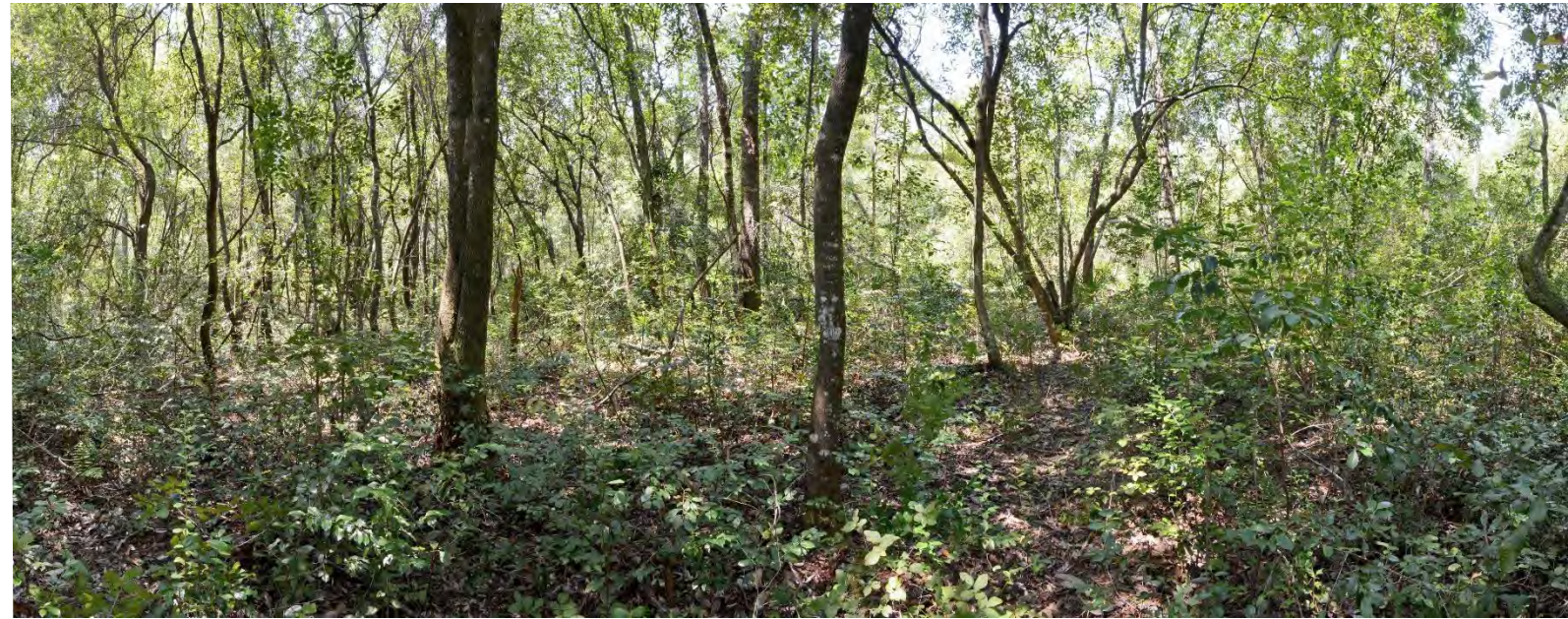
P12 – 2018 (9/14/2018) [Approximate Location of P12; Exact Location Not Accessible Due to Large Tree Fall]