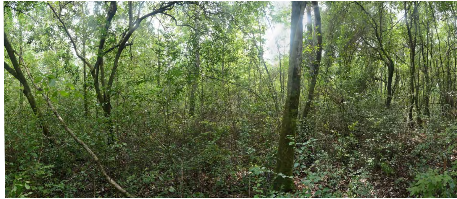
P12 – 2020 (10/16/2020) [Approximate Location of P12; Exact Location Not Accessible Due to Large Tree Fall]