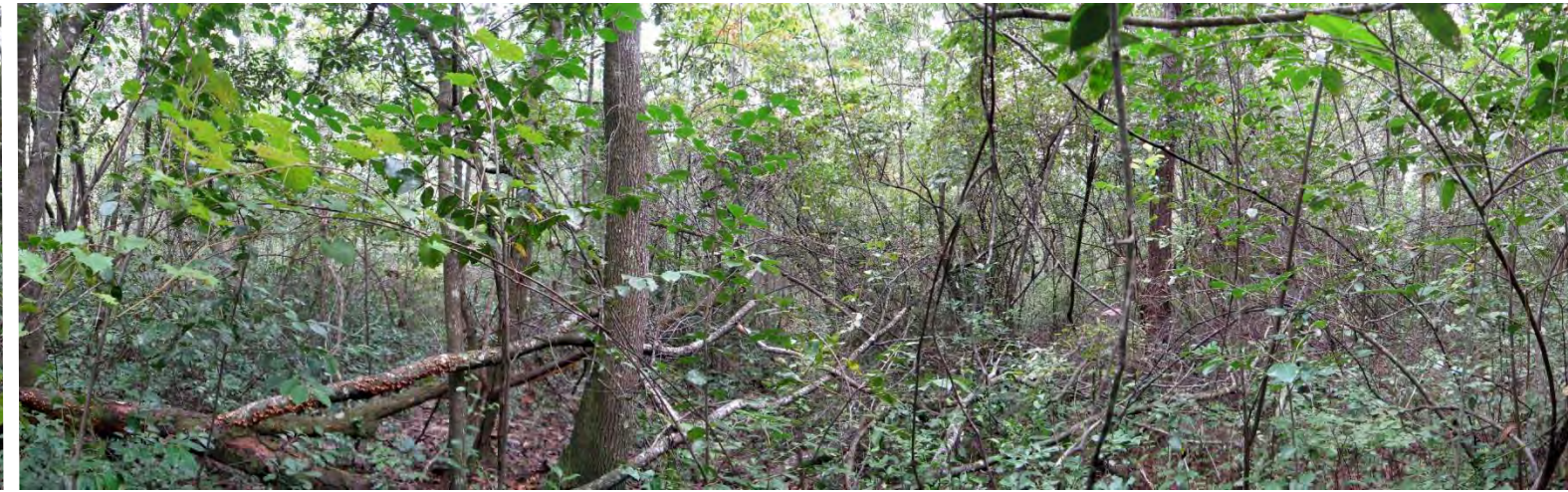
P12 – 2011 (10/13/2011)