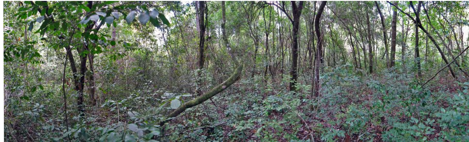
P12 – 2014 (9/26/2014) [Approximate Location of P12; Exact Location Not Accessible Due to Large Tree Fall]