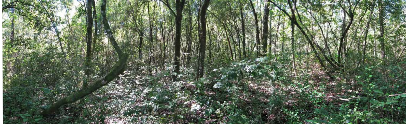
P12 – 2015 (9/23/2015) [Approximate Location of P12; Exact Location Not Accessible Due to Large Tree Fall]