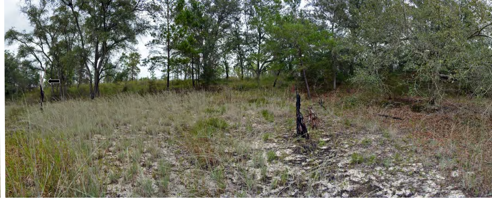
P13 – 2022 (9/27/2022)