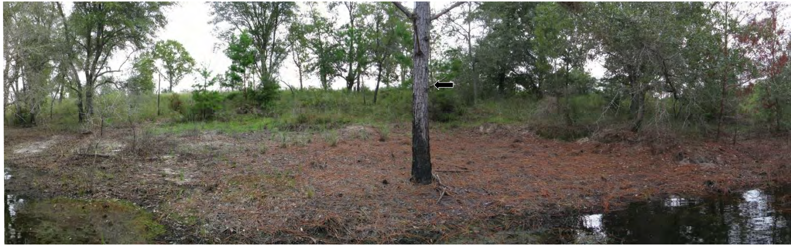
P13 – 2013 (9/5/2013) [Approximate Location of P13—Actual Point Submerged]