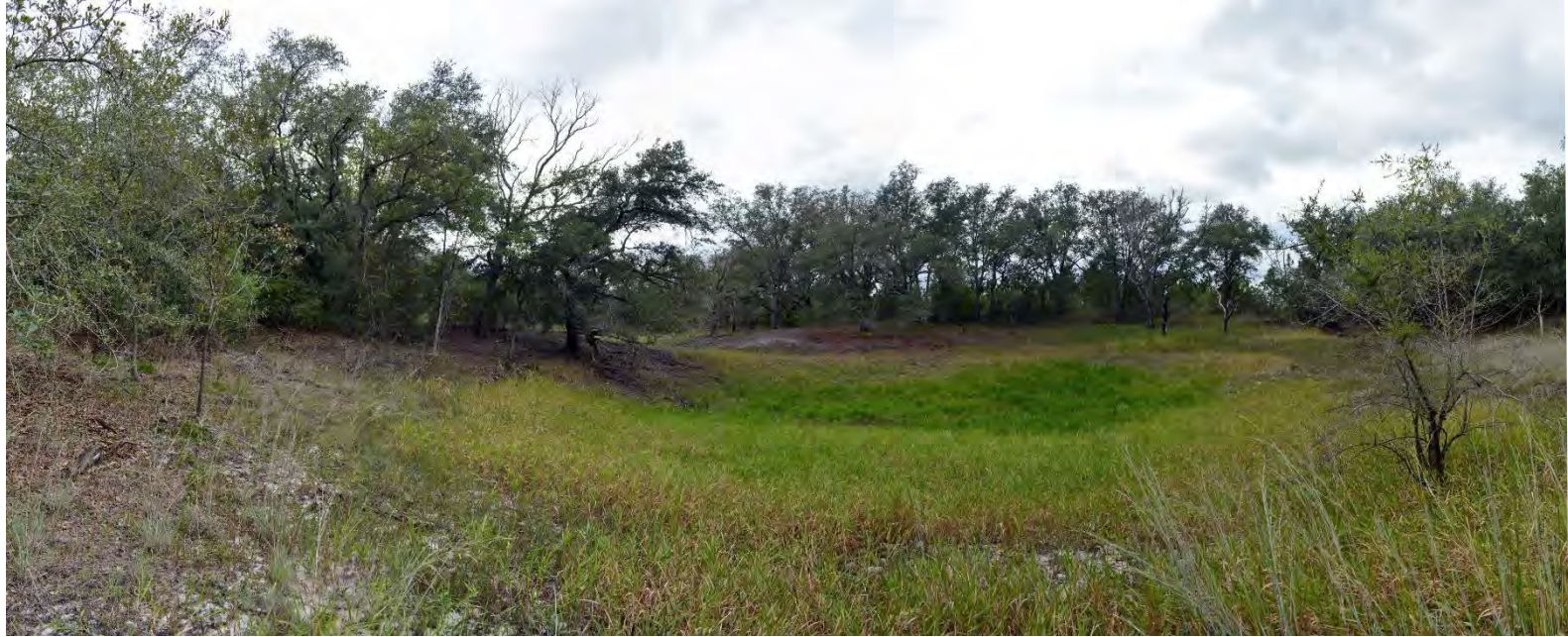
P13 – 2023 (9/26/2023)