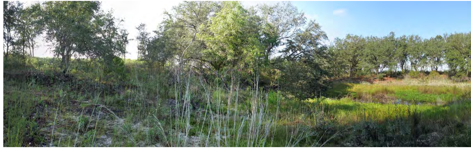
P13 – 2007 (11/02/2007)