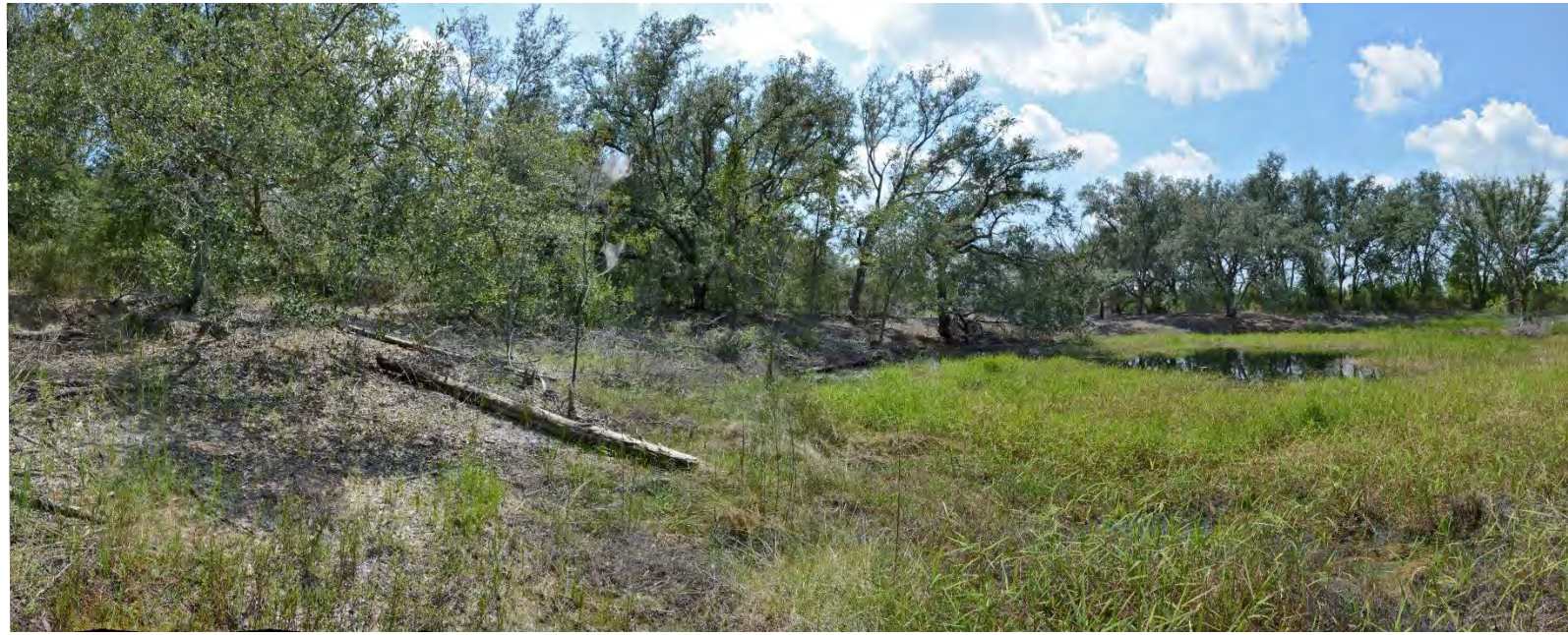
P13 – 2018 (9/14/2018)