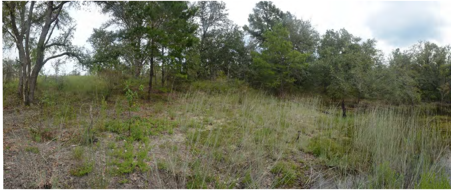
P13 – 2020 (10/16/2020)