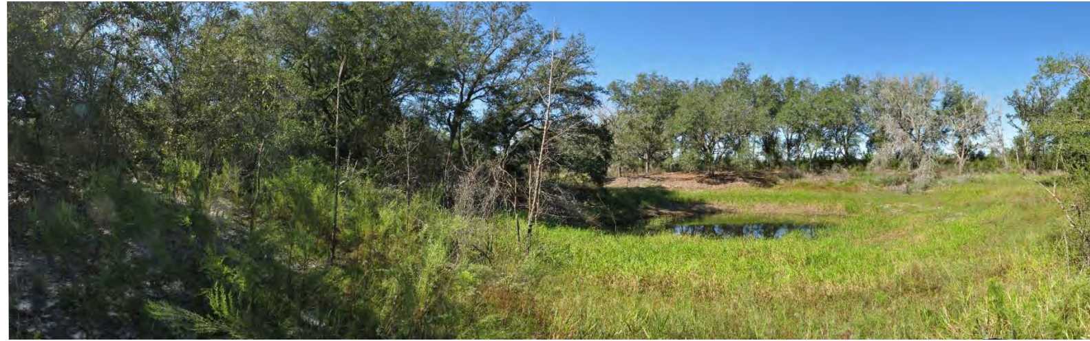
P13 – 2015 (9/23/2015)