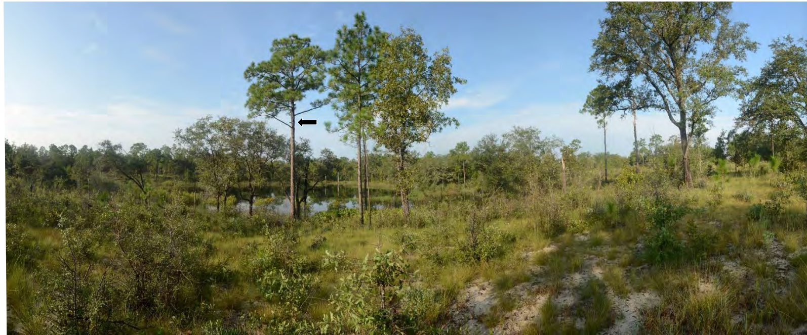
P15 – 2020 (10/16/2020)