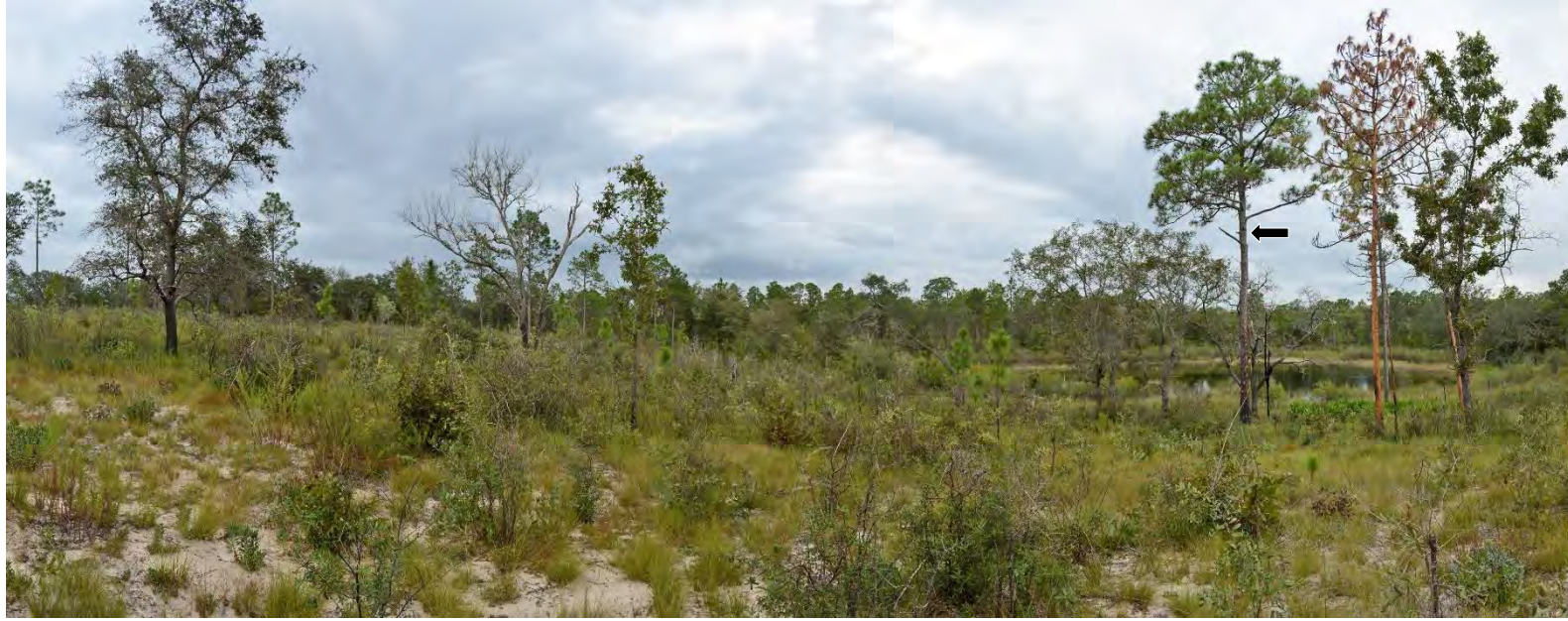
P15 – 2023 (9/26/2023)