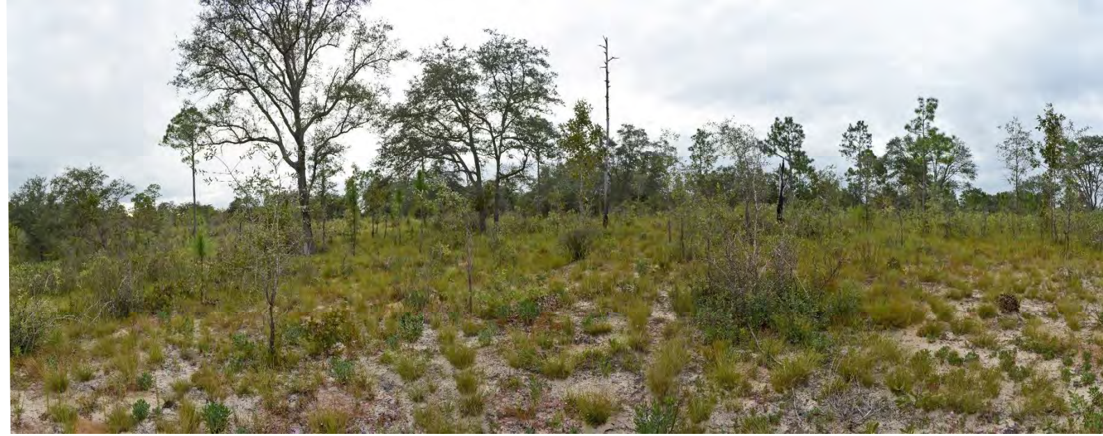
P15 – 2022 (9/27/2022)