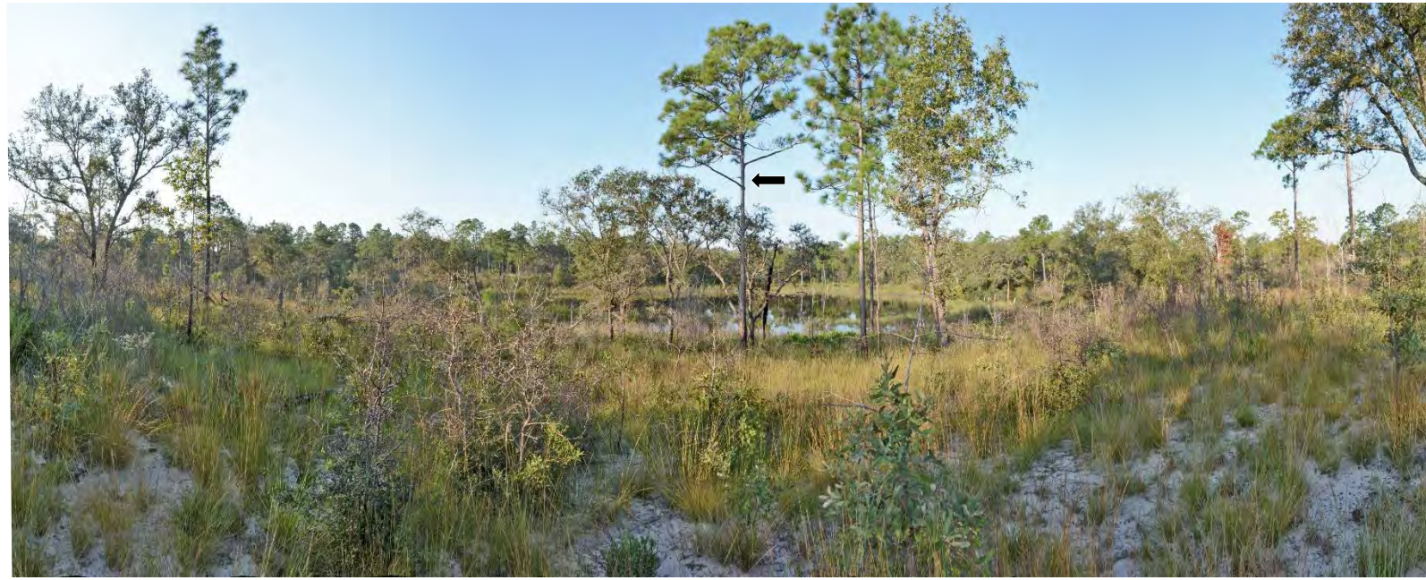
P15 – 2018 (9/14/2018)