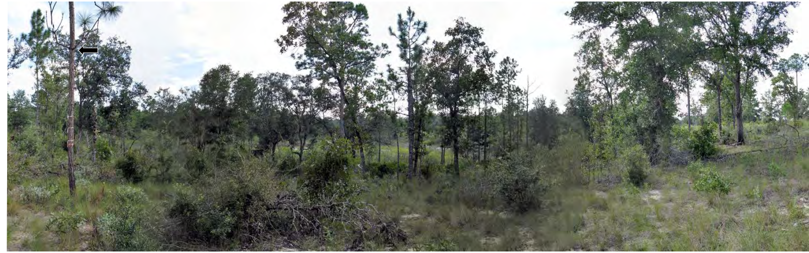
P15 – 2007 (11/02/2007)