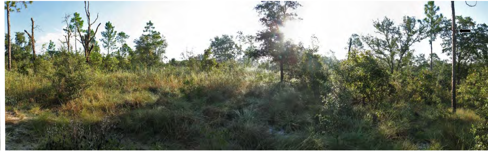
P15 – 2012 (9/14/2012)