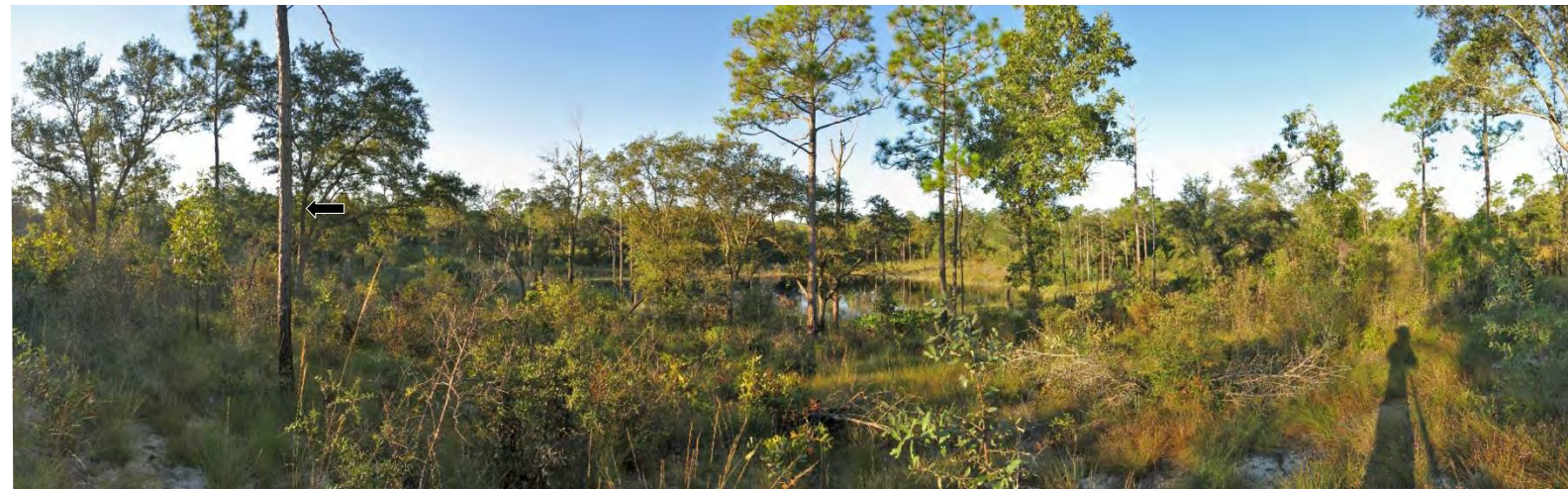
P15 – 2015 (9/23/2015)