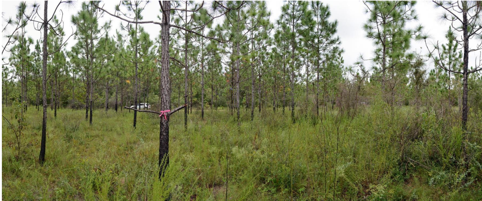
P1 – 2023 (9/26/2023)