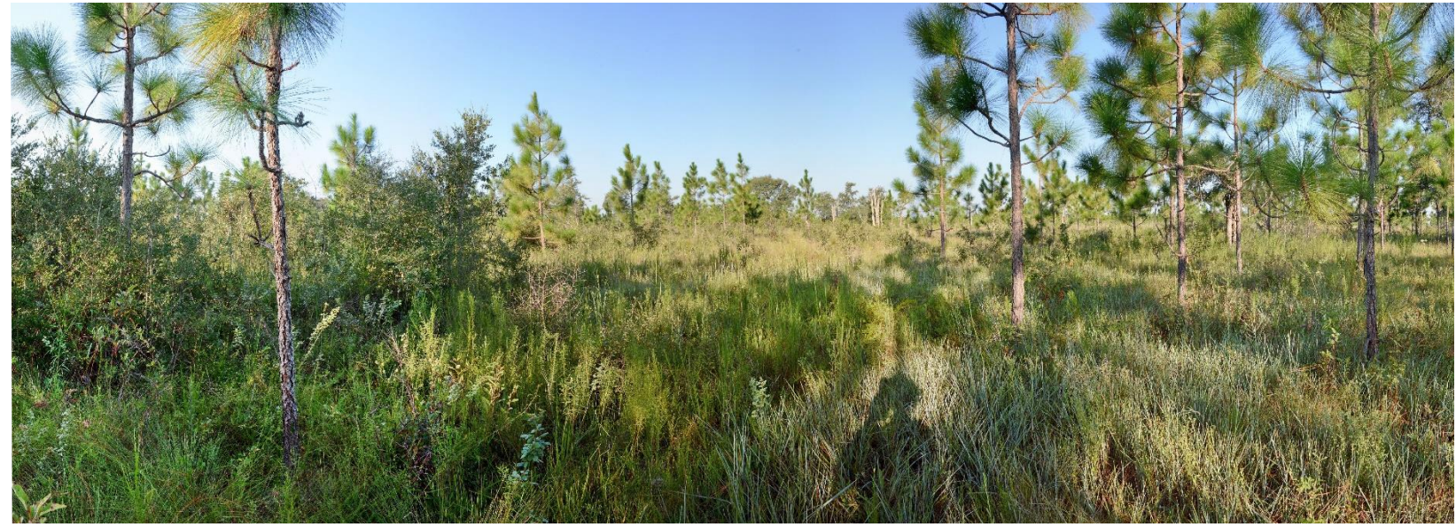
P1 – 2018 (9/14/2018)