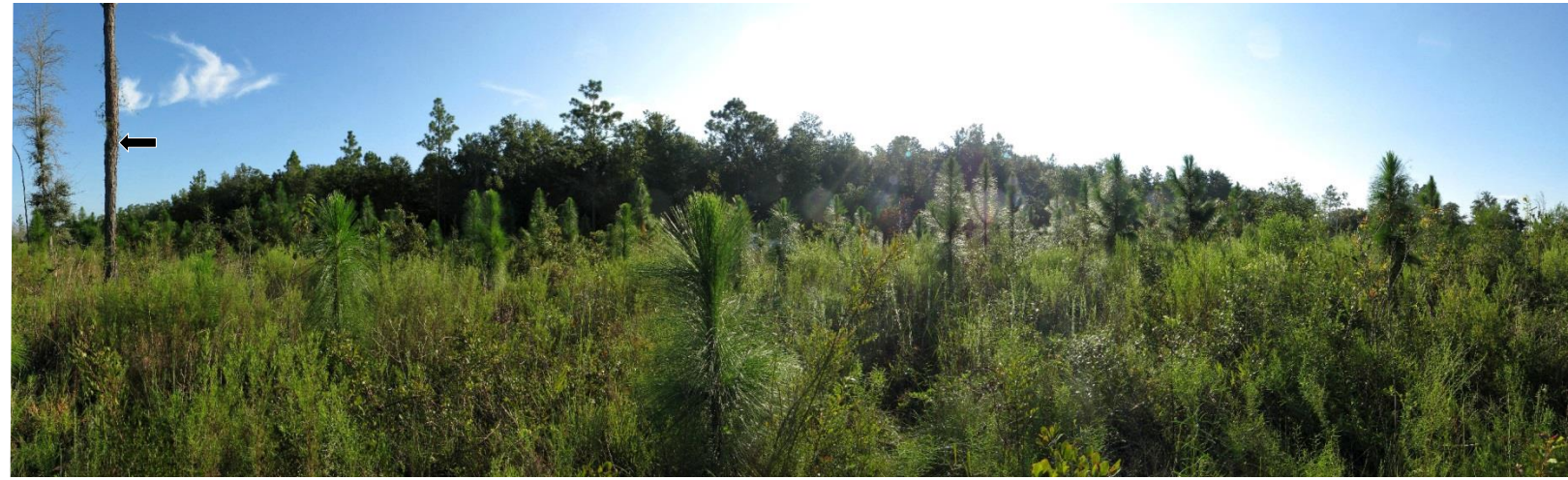
P1 – 2012 (9/14/2012)