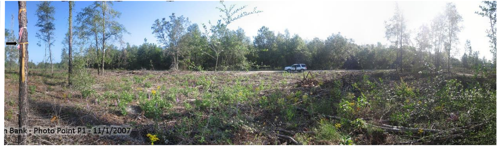
Bank - Photo Point P1 - 11/1/2007