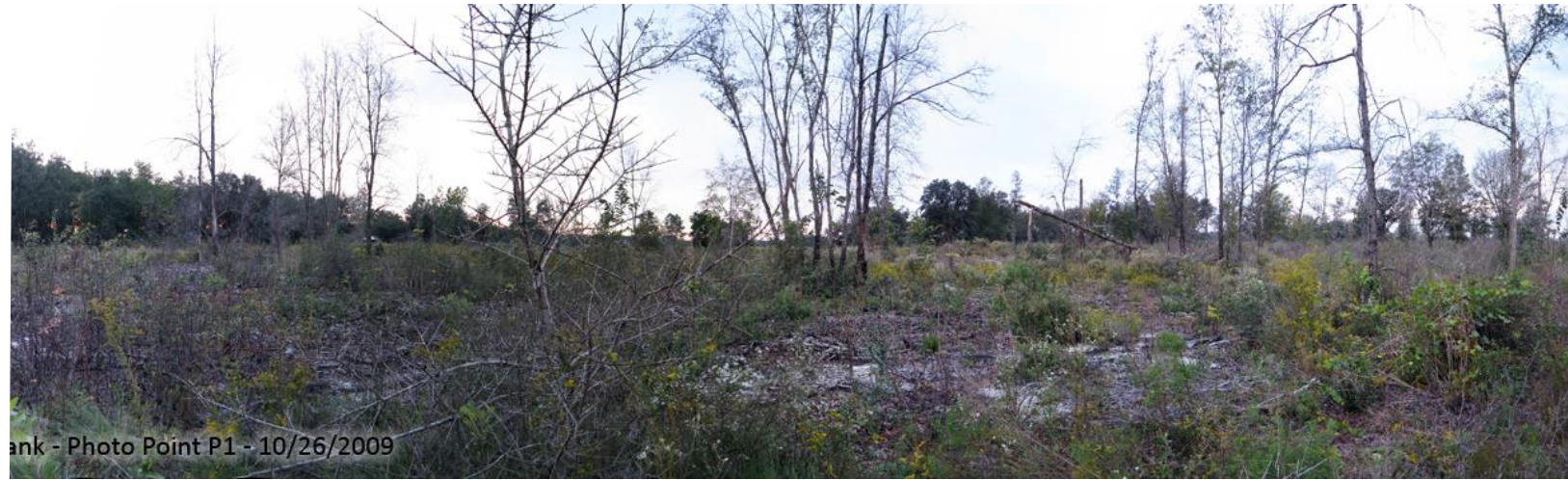
Sand Hill Lakes Mitigation Bank - Photo Point P1 - 10/26/2009