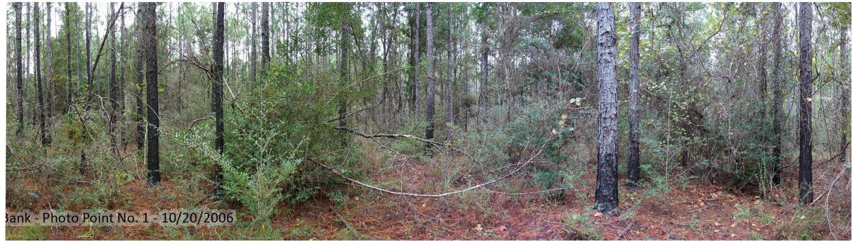
Bank - Photo Point No. 1 - 10/20/2006