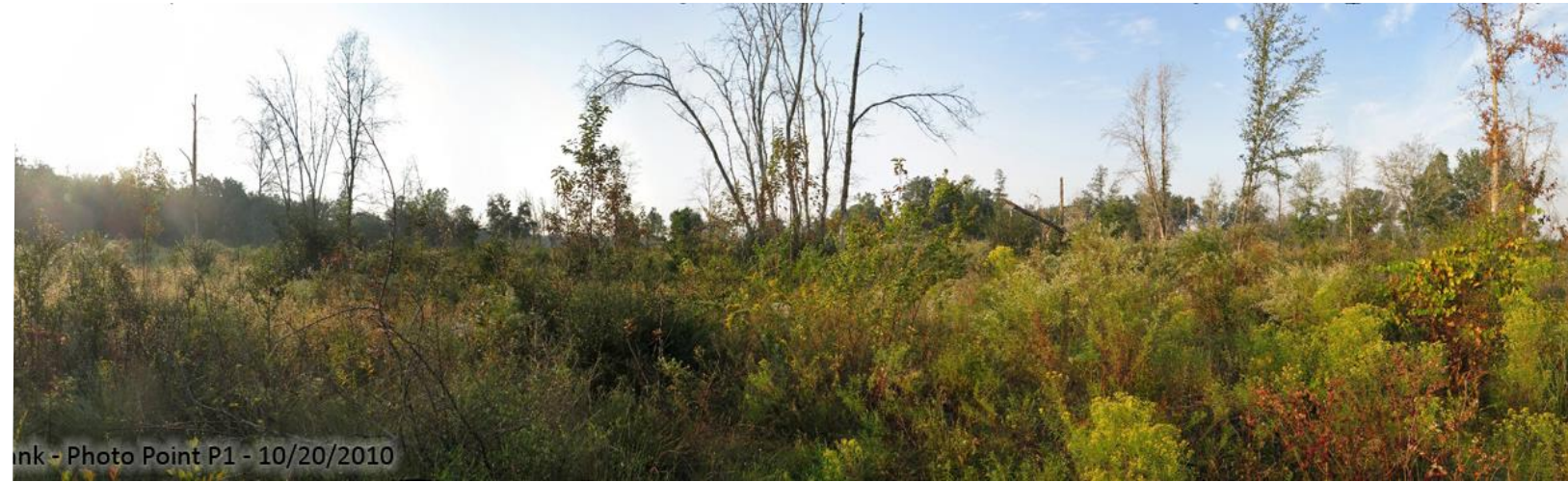
Sand Hill Lakes Mitigation Bank - Photo Point P1 - 10/20/2010