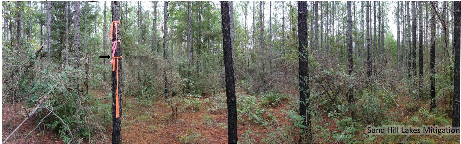
Sand Hill Lakes Mitigation