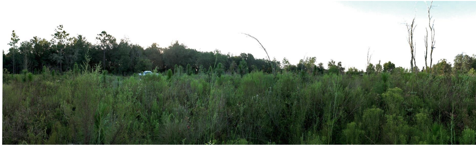
P1 – 2011 (10/20/2011)