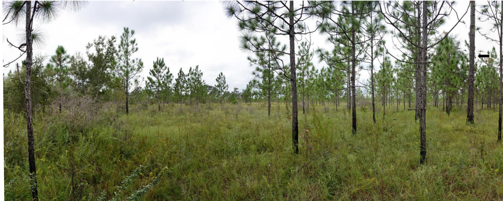
P1 – 2022 (9/27/2022)