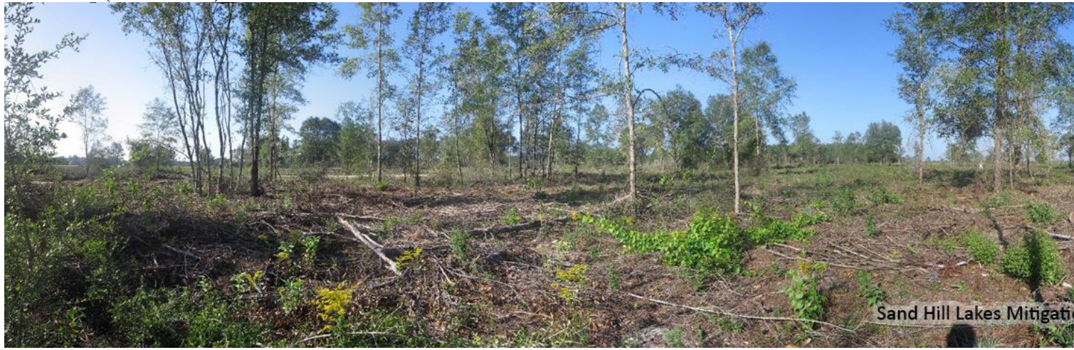
Sand Hill Lakes Mitigation