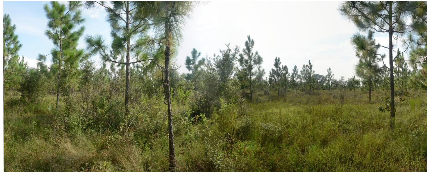
P1 – 2020 (10/16/2020)