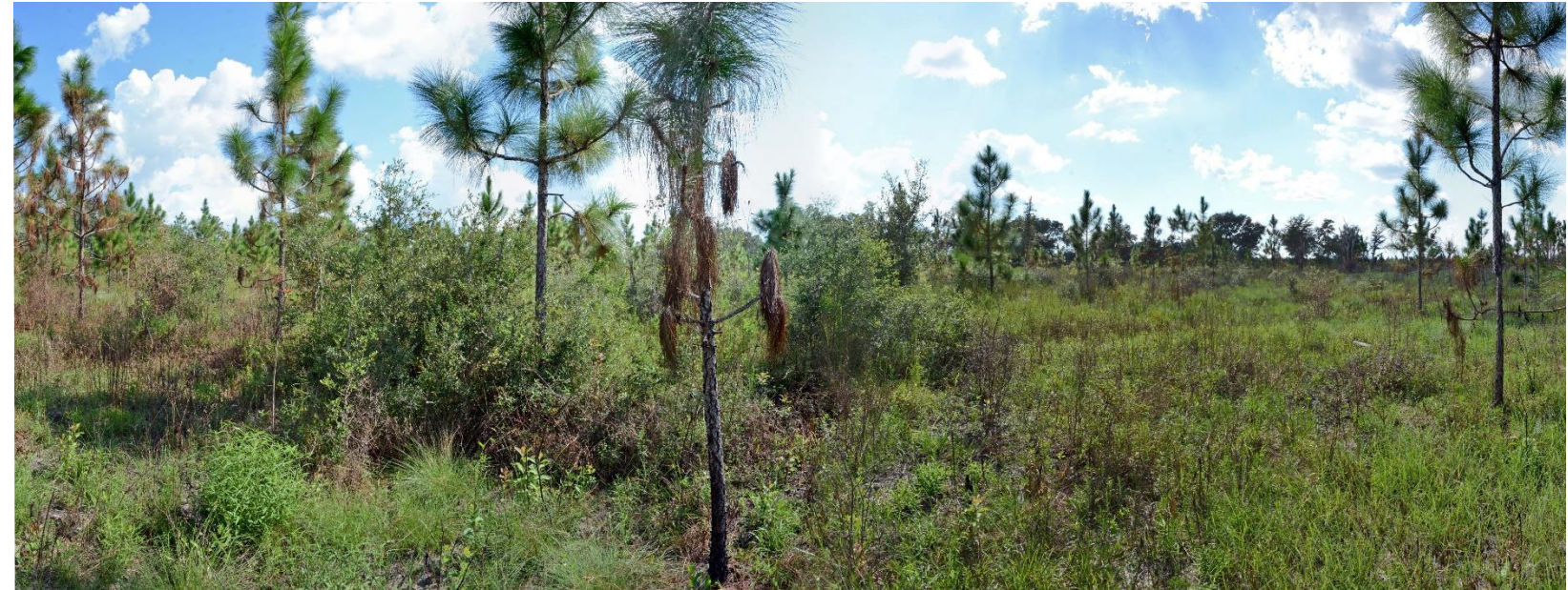
P1 – 2017 (10/19/2017)