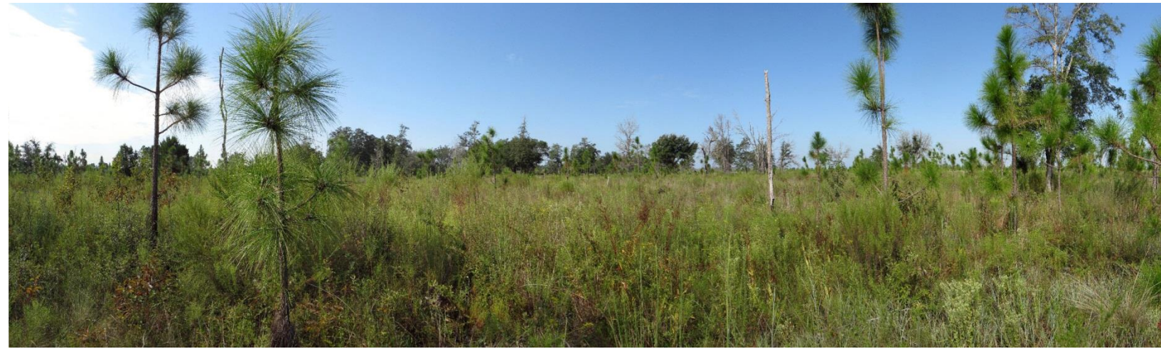
P1 – 2014 (9/26/2014)