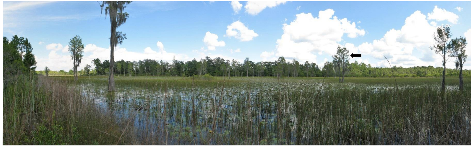
P5 – 2012 (9/14/2012)