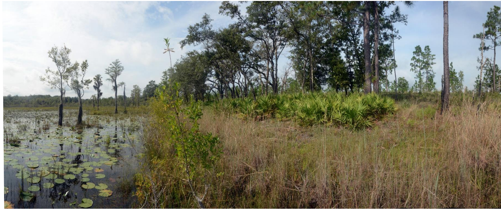
P5 – 2020 (10/16/2020)