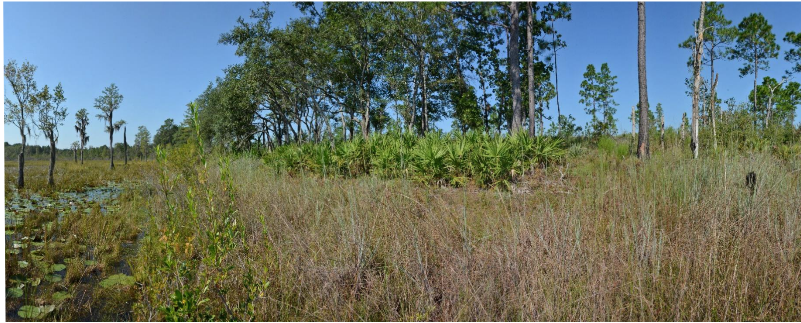
P5 – 2018 (9/14/2018)