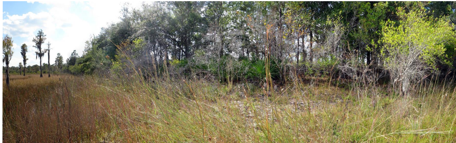
P5 – 2009 (10/26/2009)