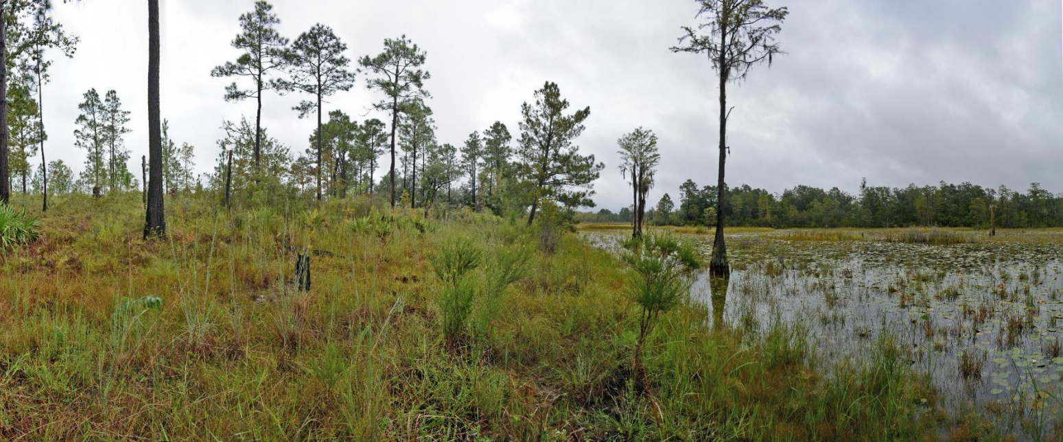
P5 – 2023 (9/26/2023)