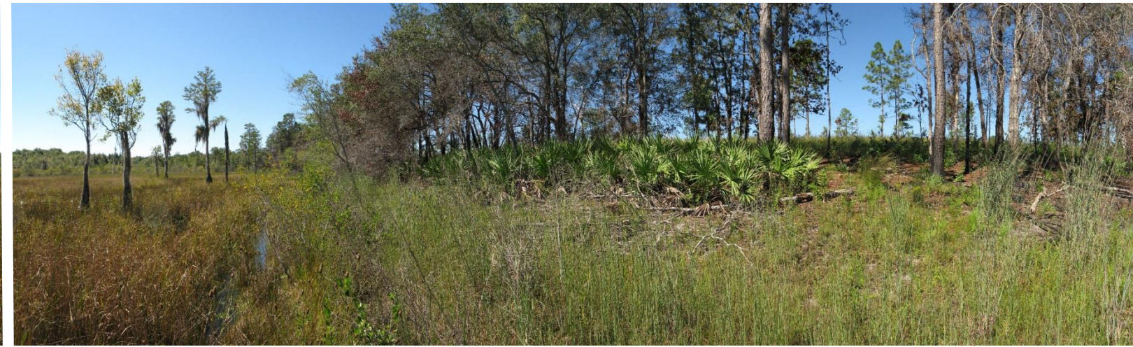
P5 – 2015 (9/23/2015)