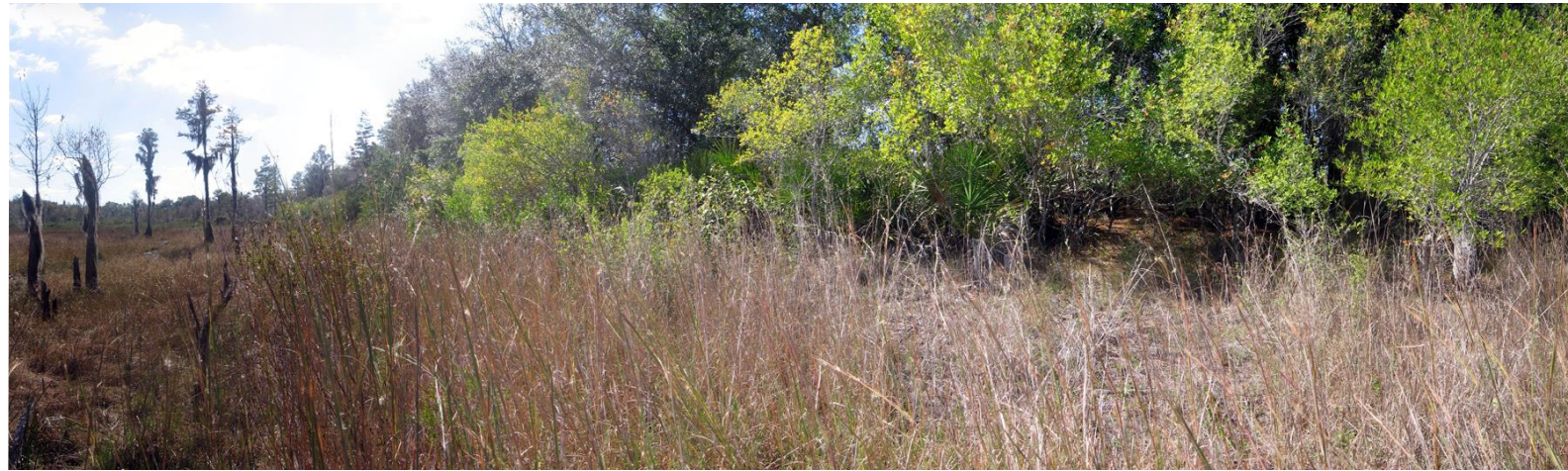
P5 – 2006 (10/26/2006)