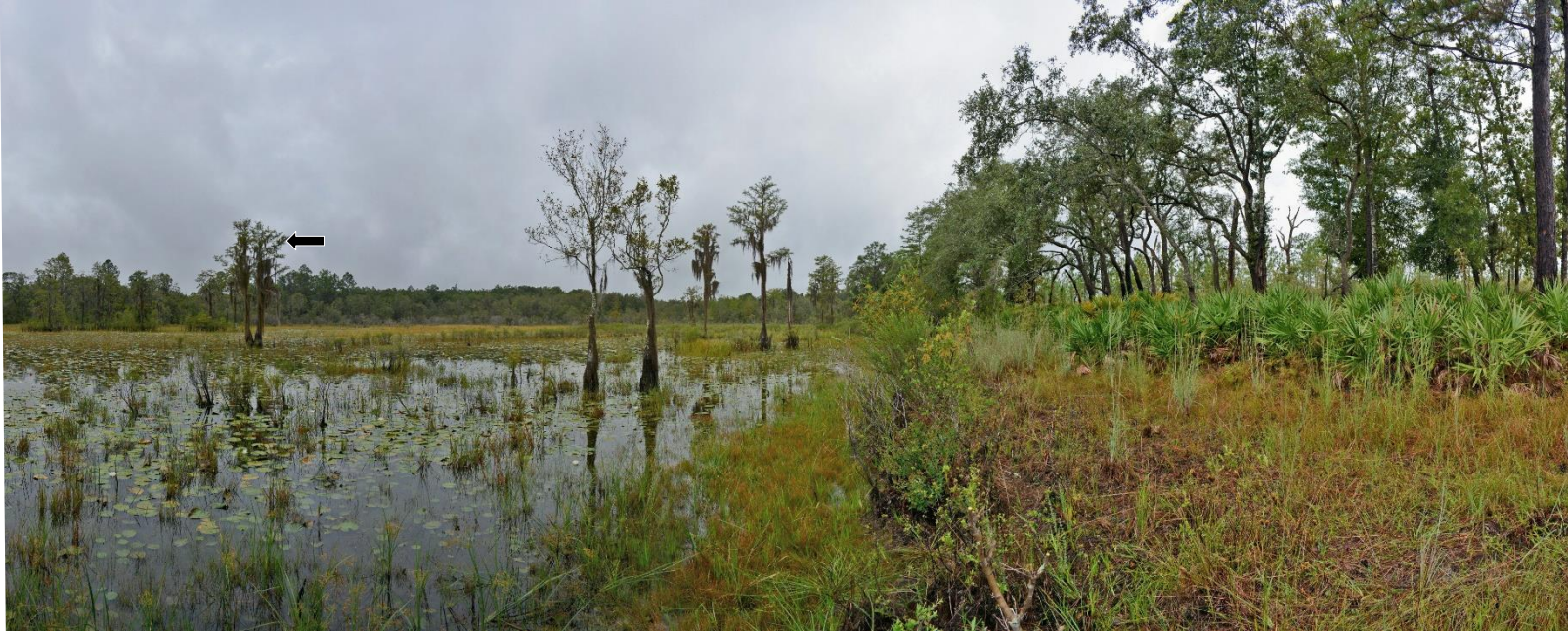
P5 – 2022 (9/27/2022)