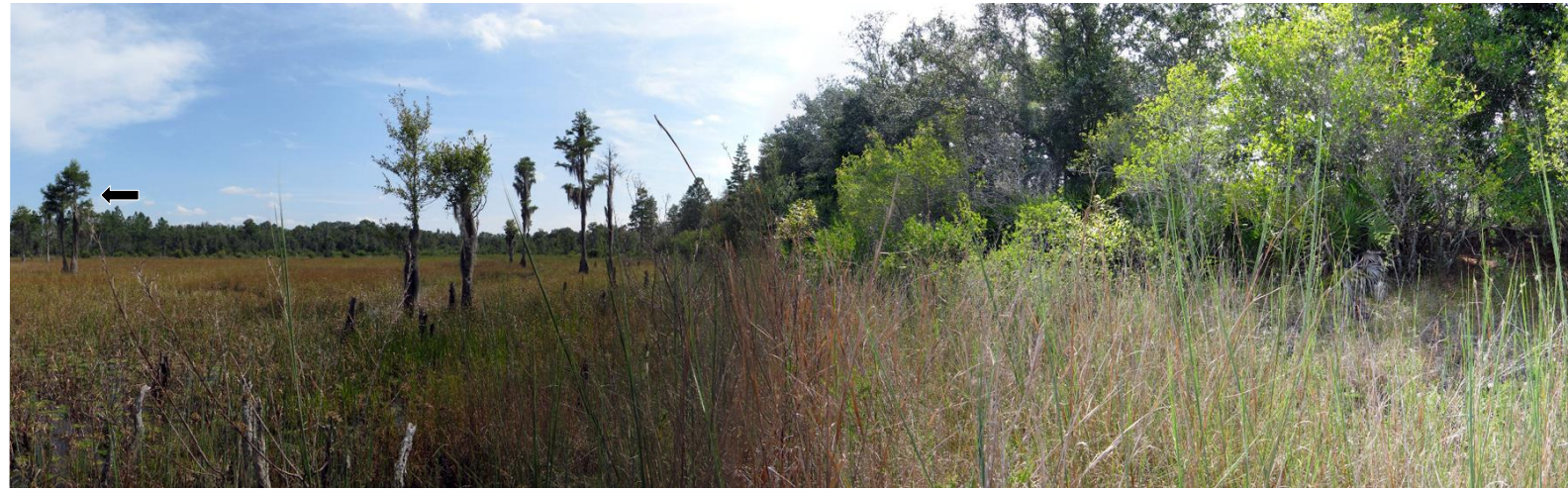
P5 – 2007 (11/01/2007)