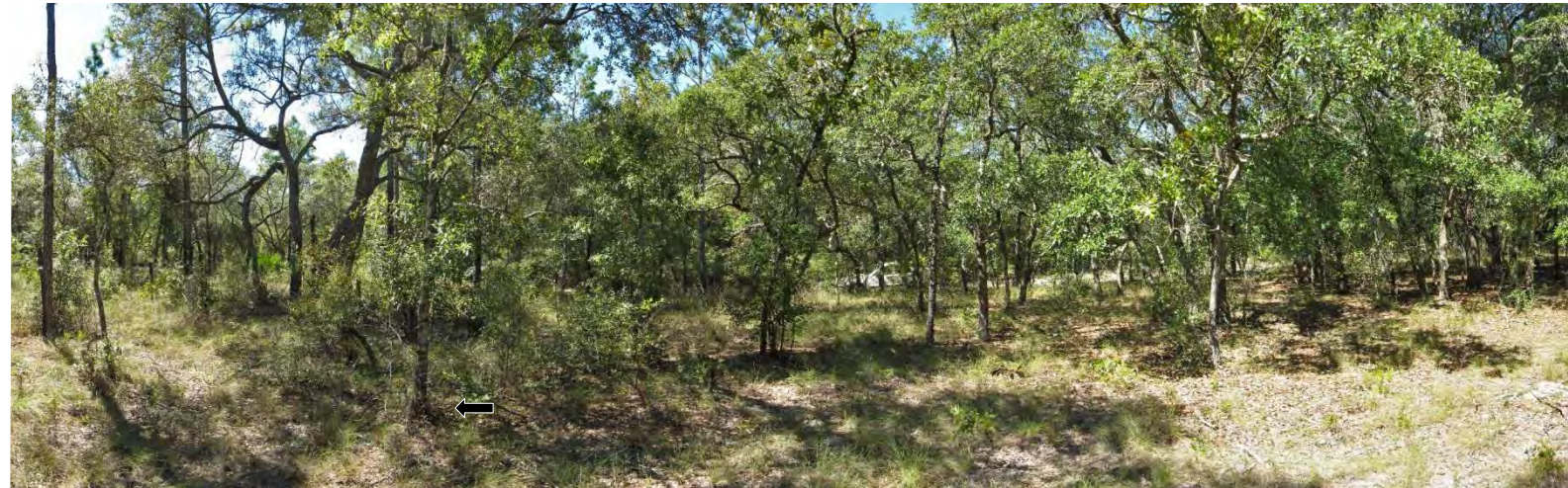
P6 – 2015 (9/23/2015)