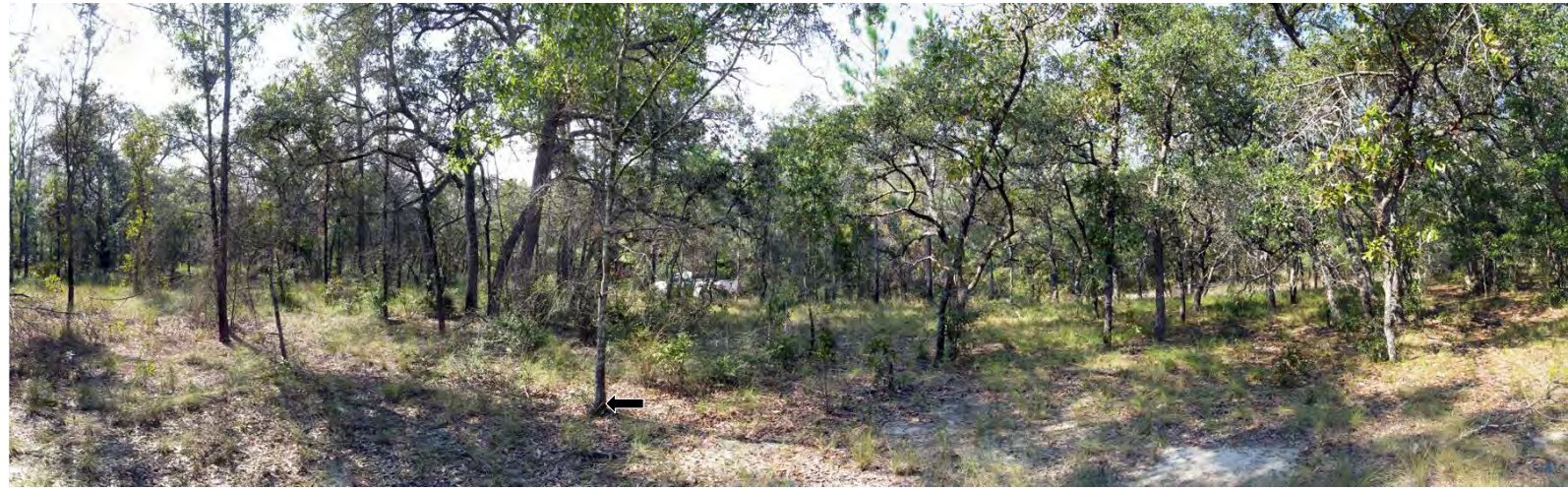
P6 – 2009 (10/26/2009)