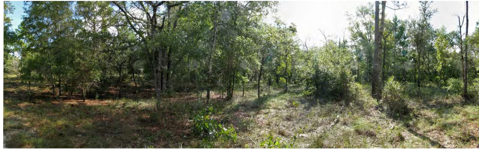
P6 – 2012 (9/14/2012)