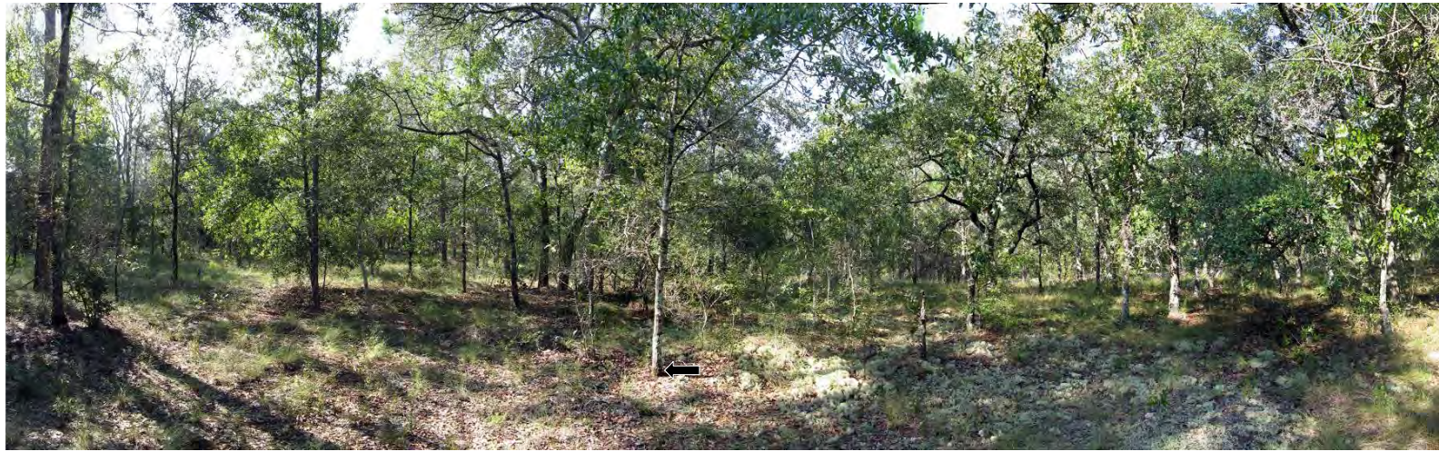
P6 – 2007 (11/02/2007)