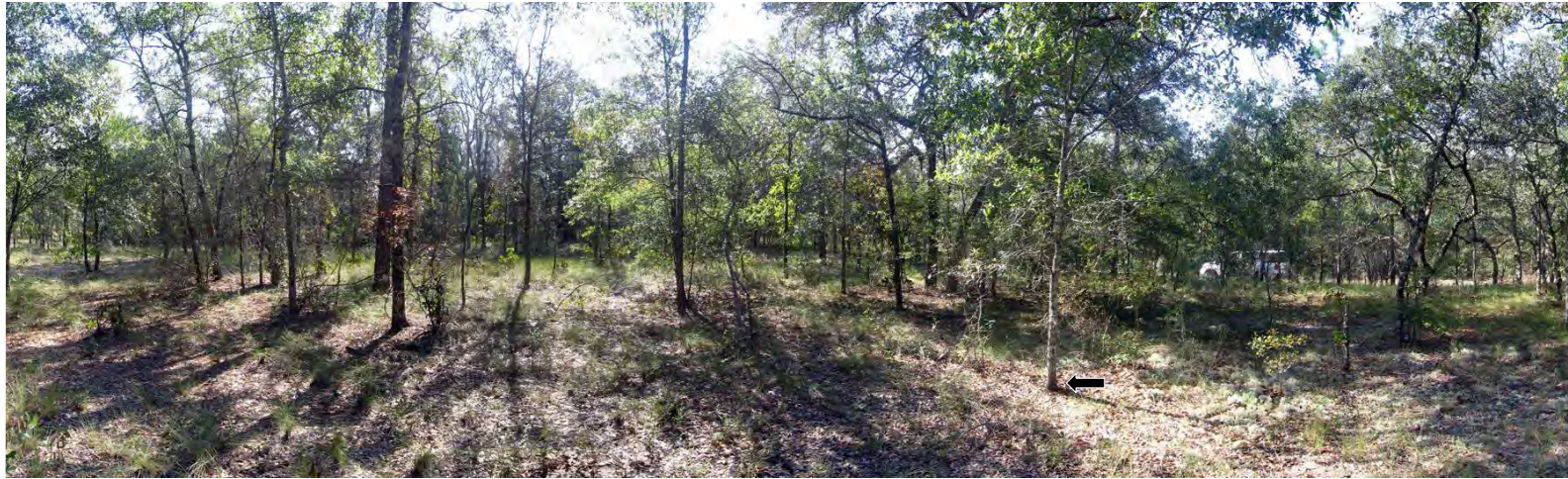
P6 – 2006 (10/20/2006)