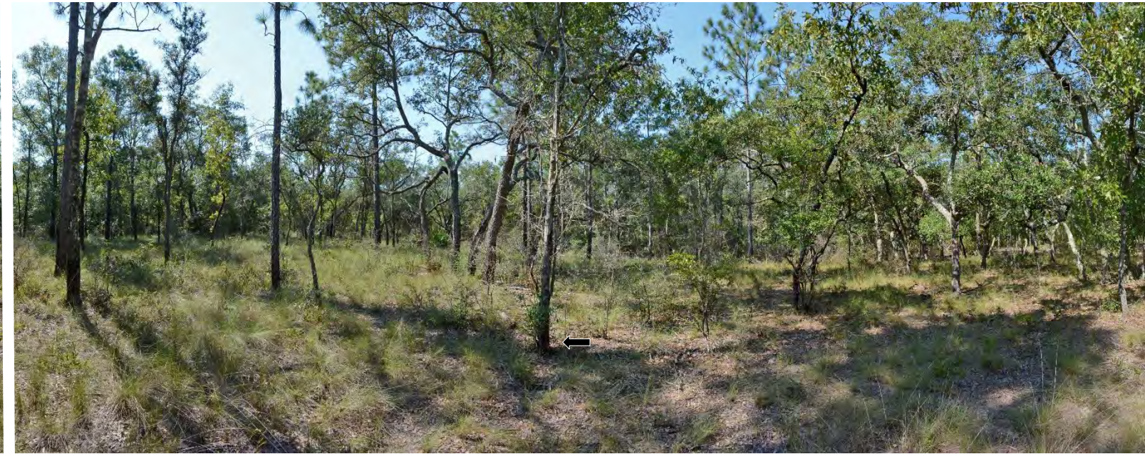
P6 – 2018 (9/14/2018)