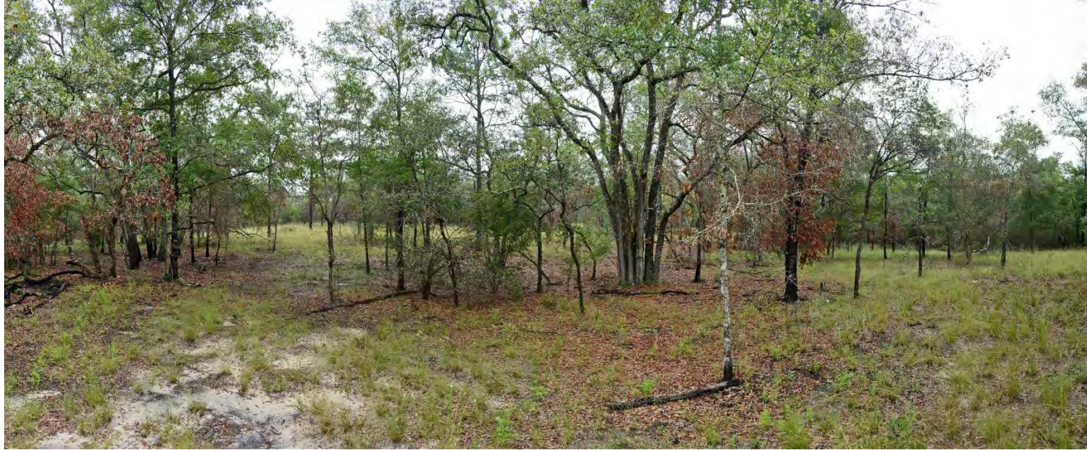
P6 – 2023 (9/26/2023)