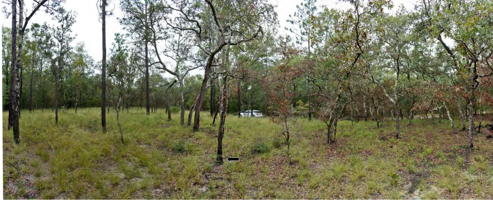
P6 – 2022 (9/27/2022)