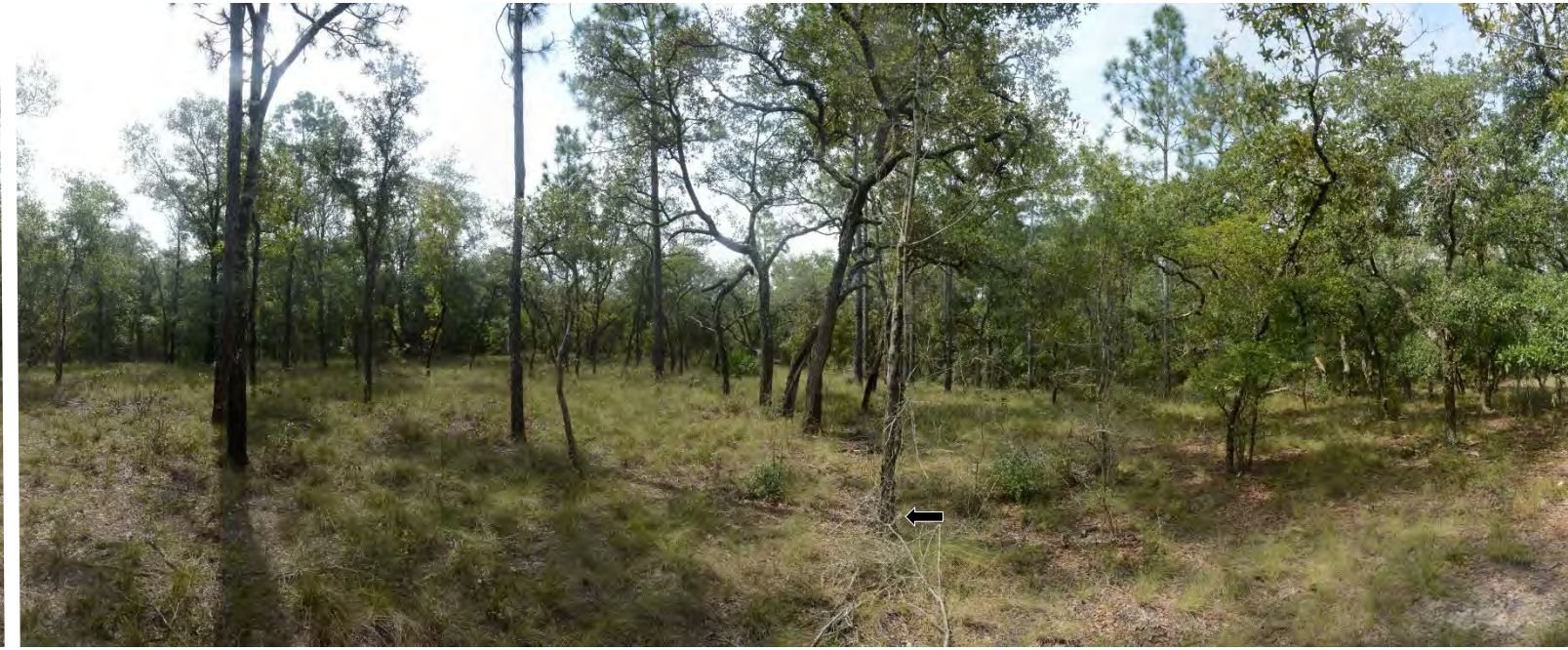
P6 – 2020 (10/16/2020)