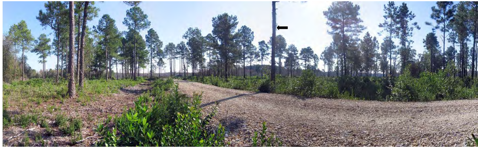
P8 – 2006 (10/20/2006)