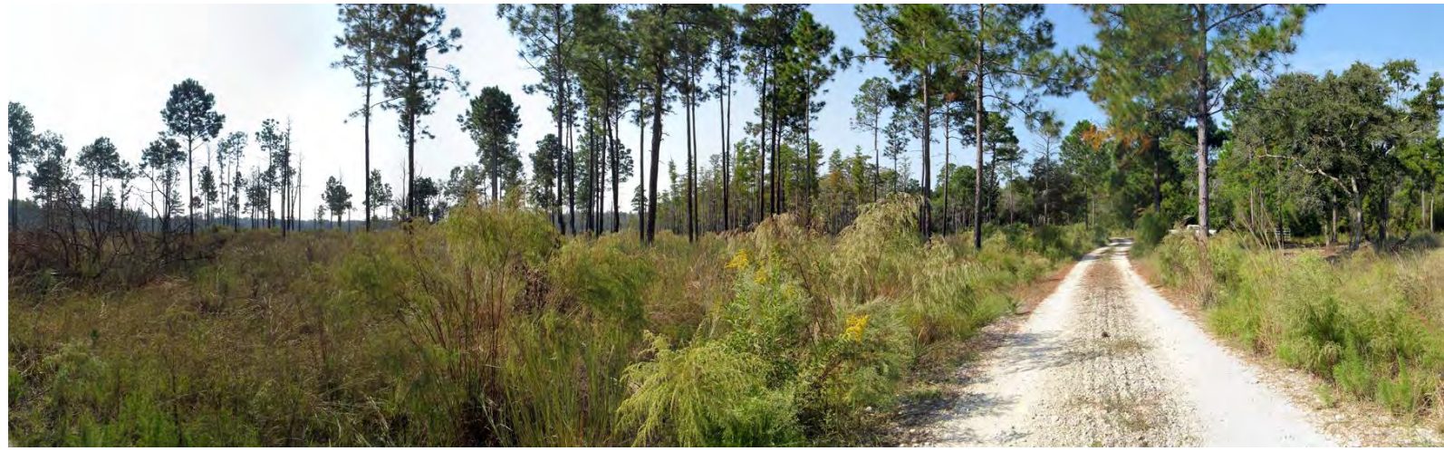
P8 – 2009 (10/26/2009)