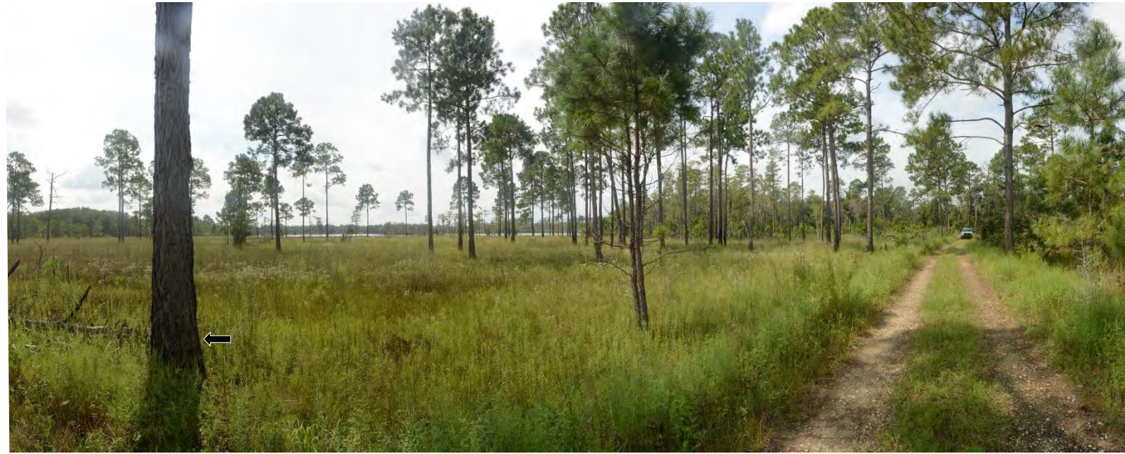
P8 – 2020 (10/16/2020)