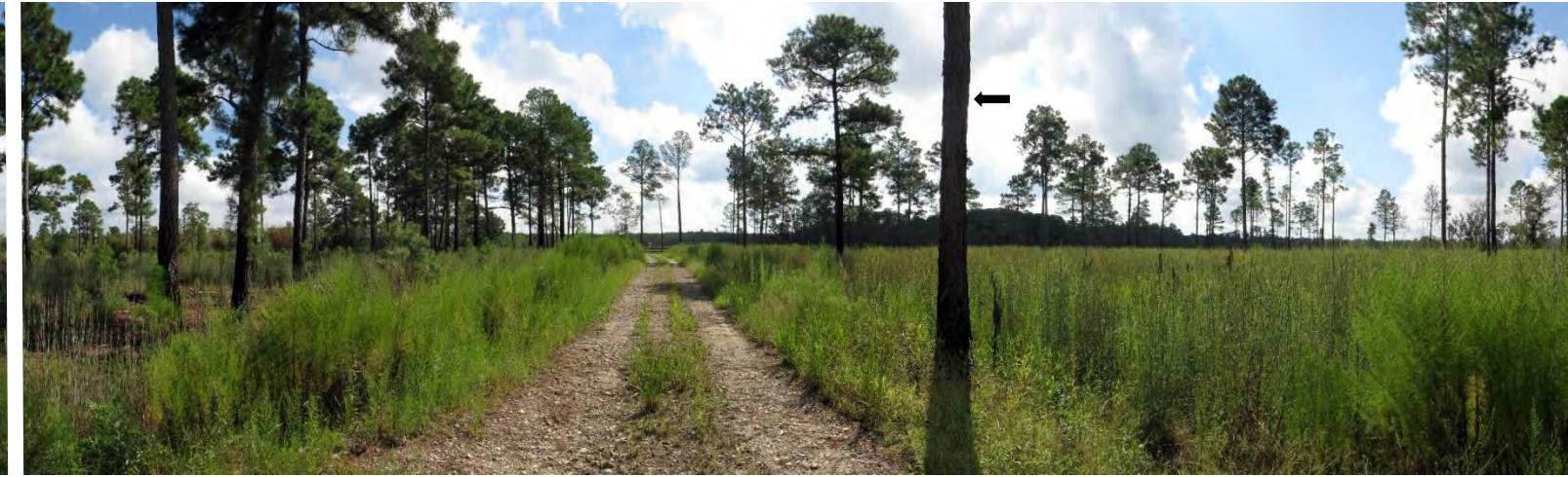
P8 – 2012 (9/14/2012)