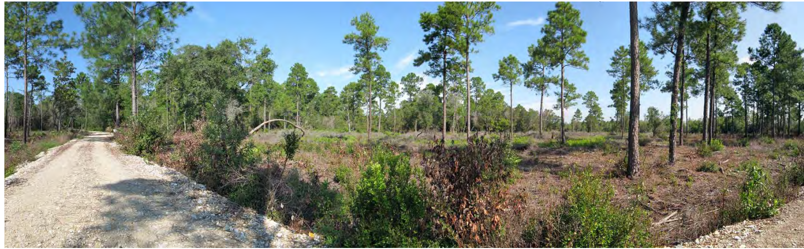
P8 – 2007 (11/02/2007)