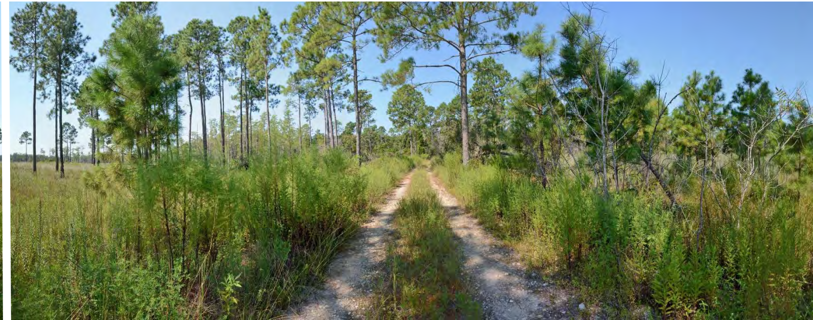
P8 – 2018 (9/14/2018)