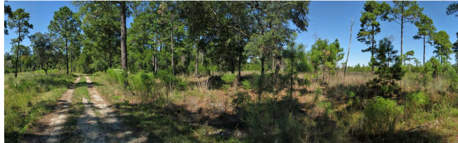
P8 – 2015 (9/23/2015)