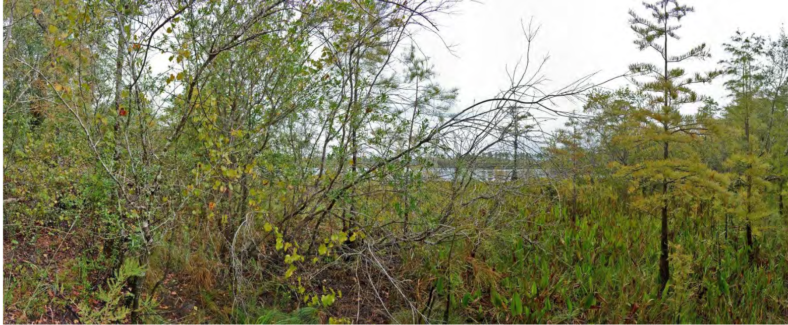
P9 – 2023 (9/26/2023)