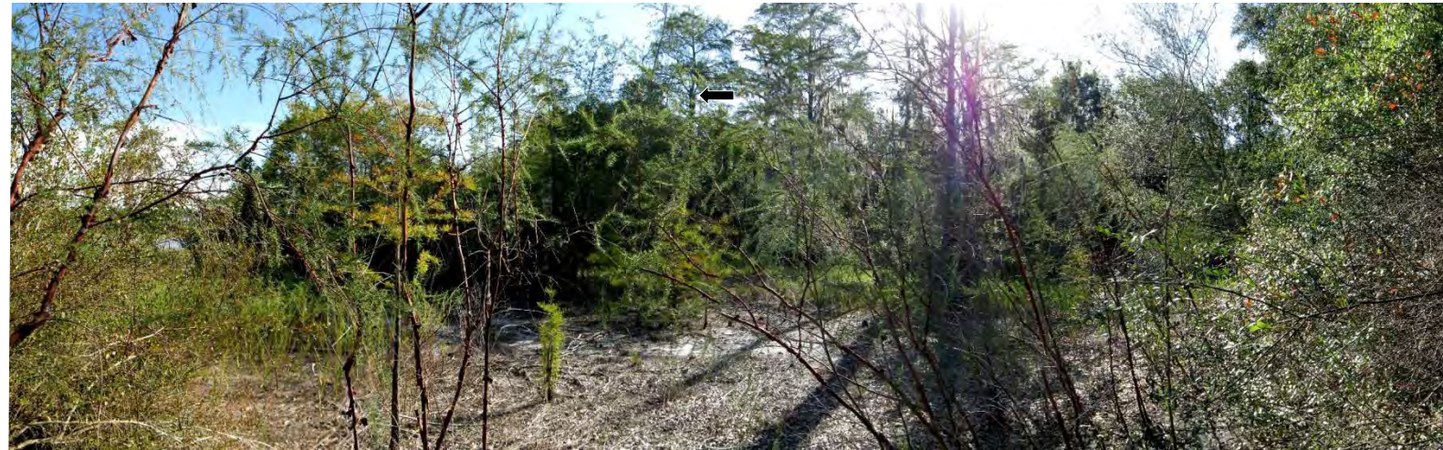
P9 – 2011 (10/13/2011)