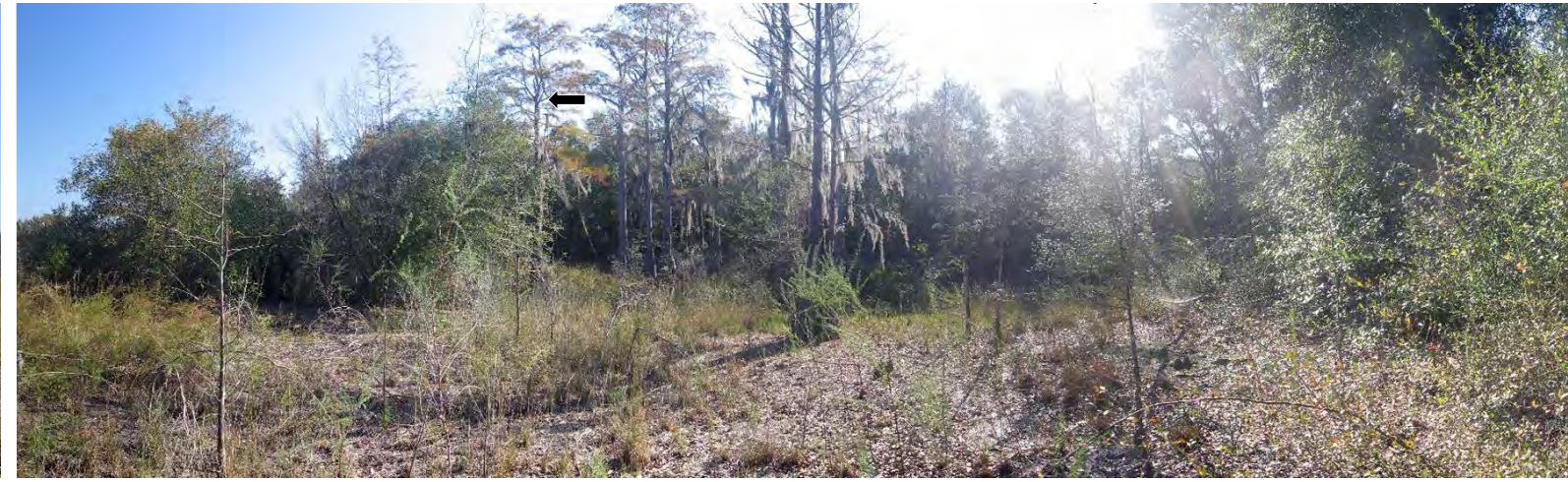
P9 – 2006 (10/20/2006)