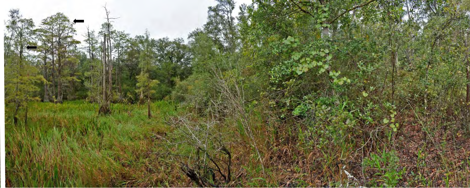
P9 – 2022 (9/27/2022)