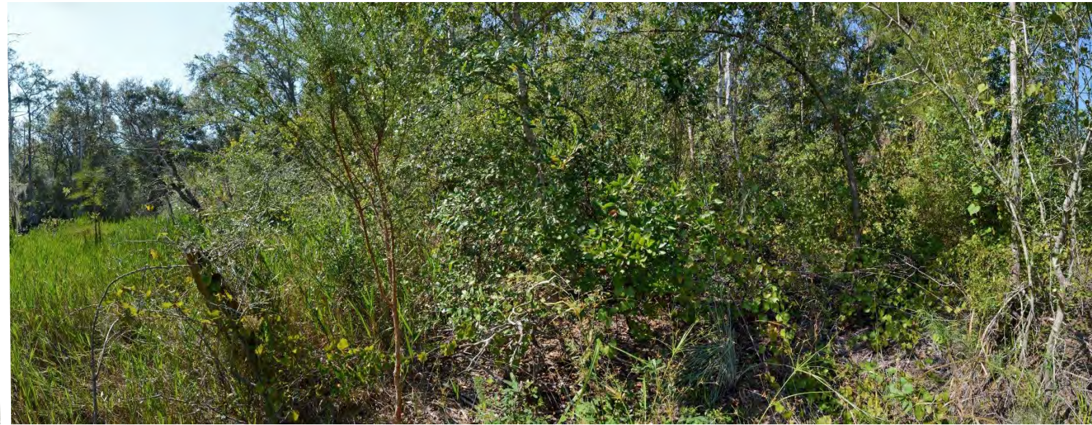
P9 – 2018 (9/14/2018)