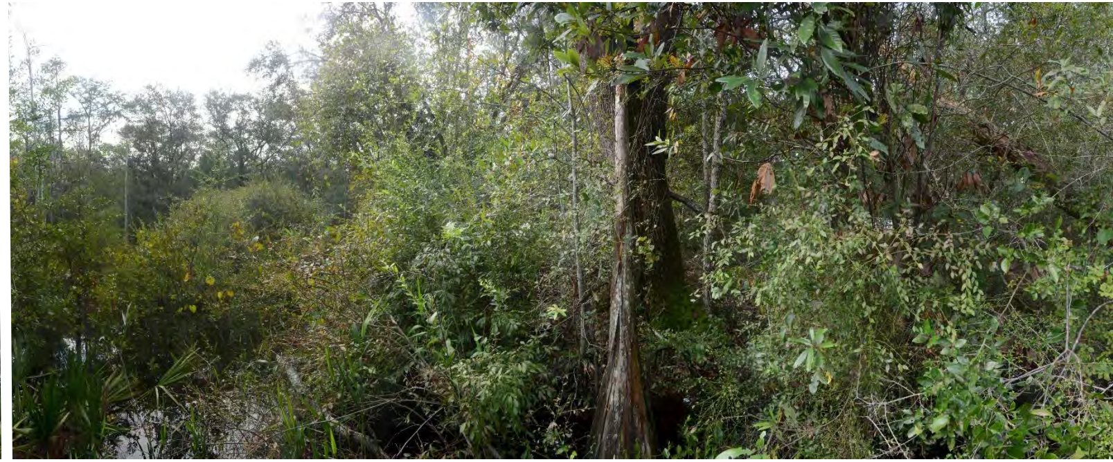
P9 – 2020 (10/16/2020)