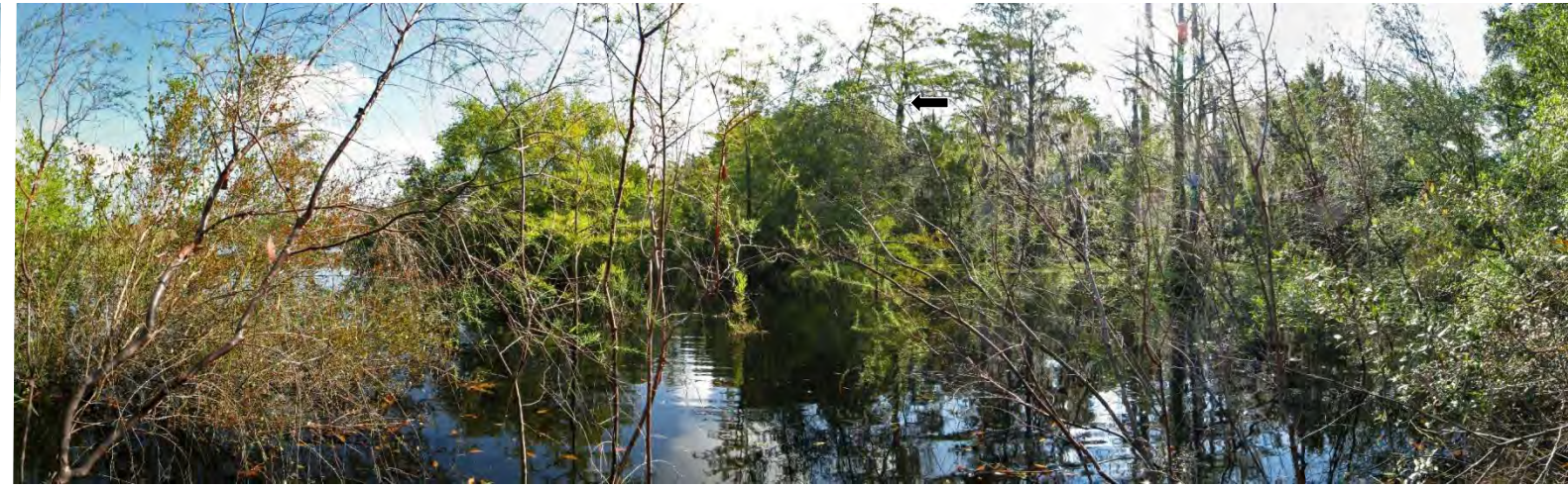
P9 – 2012 (9/14/2012)