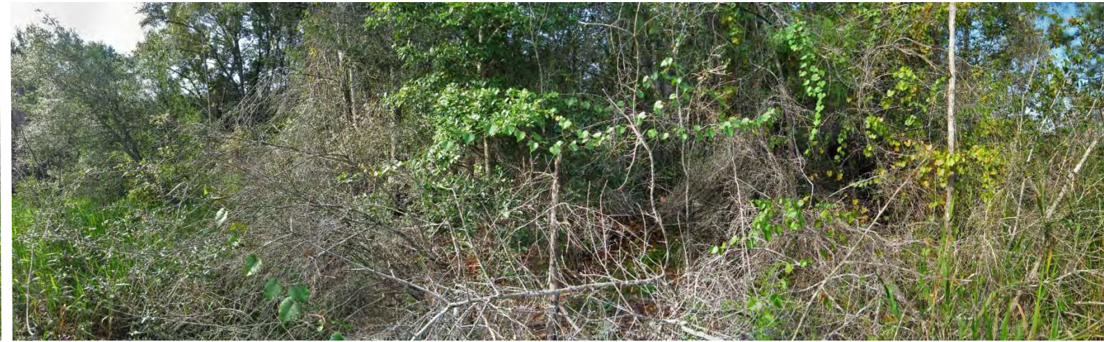
P9 – 2014 (9/26/2014)