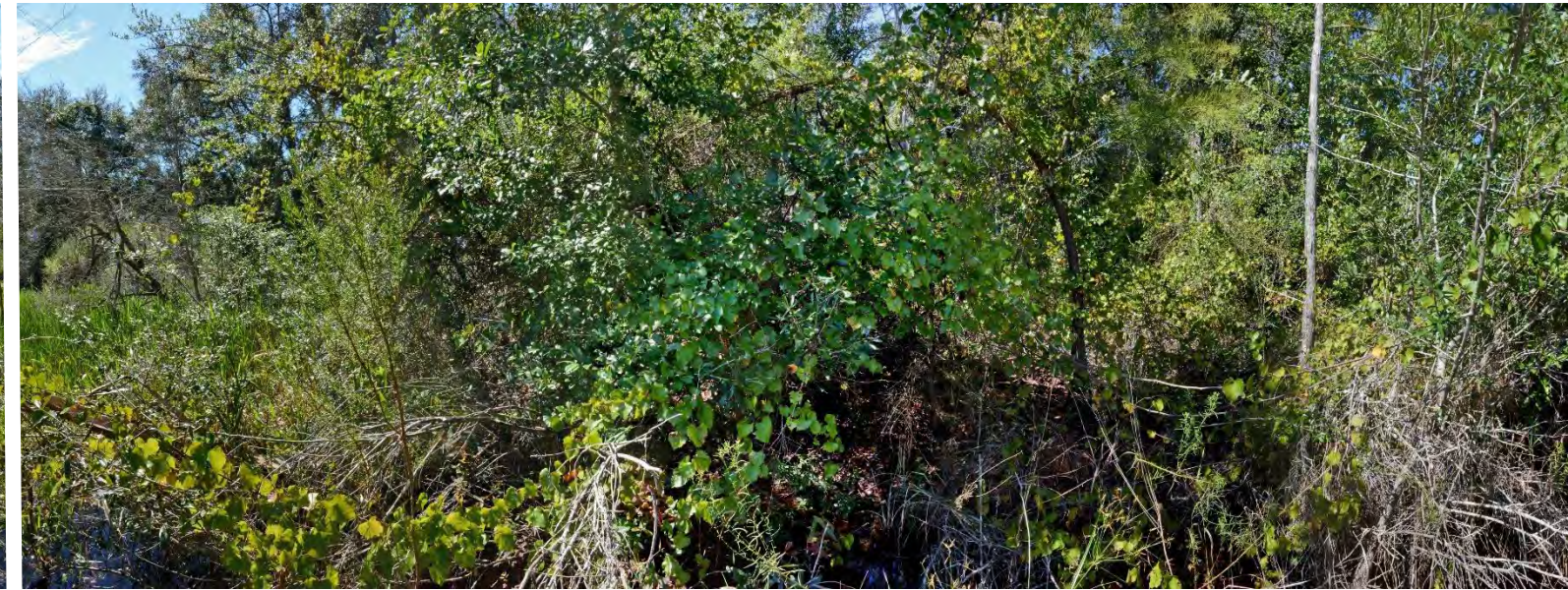
P9 – 2017 (10/19/2017)