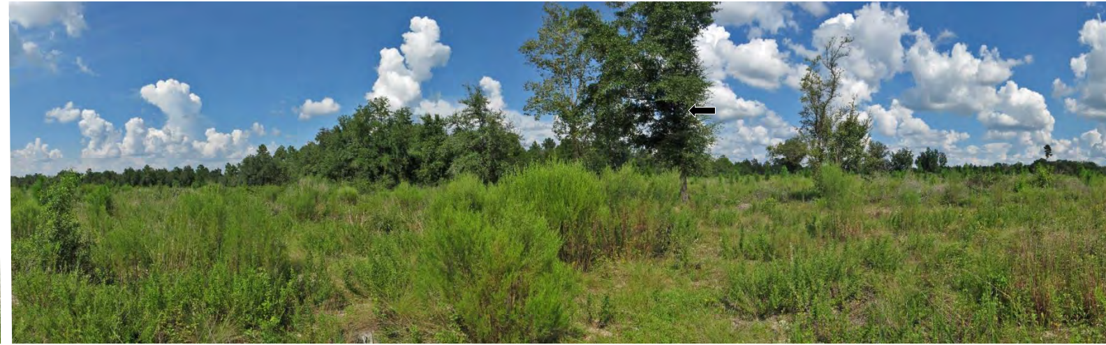
T1 – 2012 (9/14/2012)