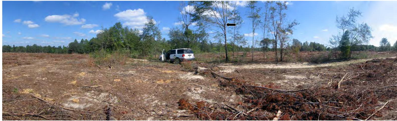
T1 – 2006 (10/20/2006)