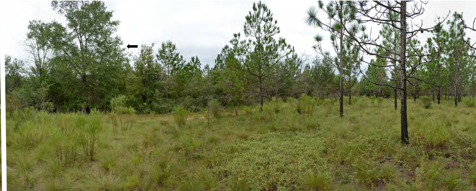
T1 – 2022 (9/27/2022)