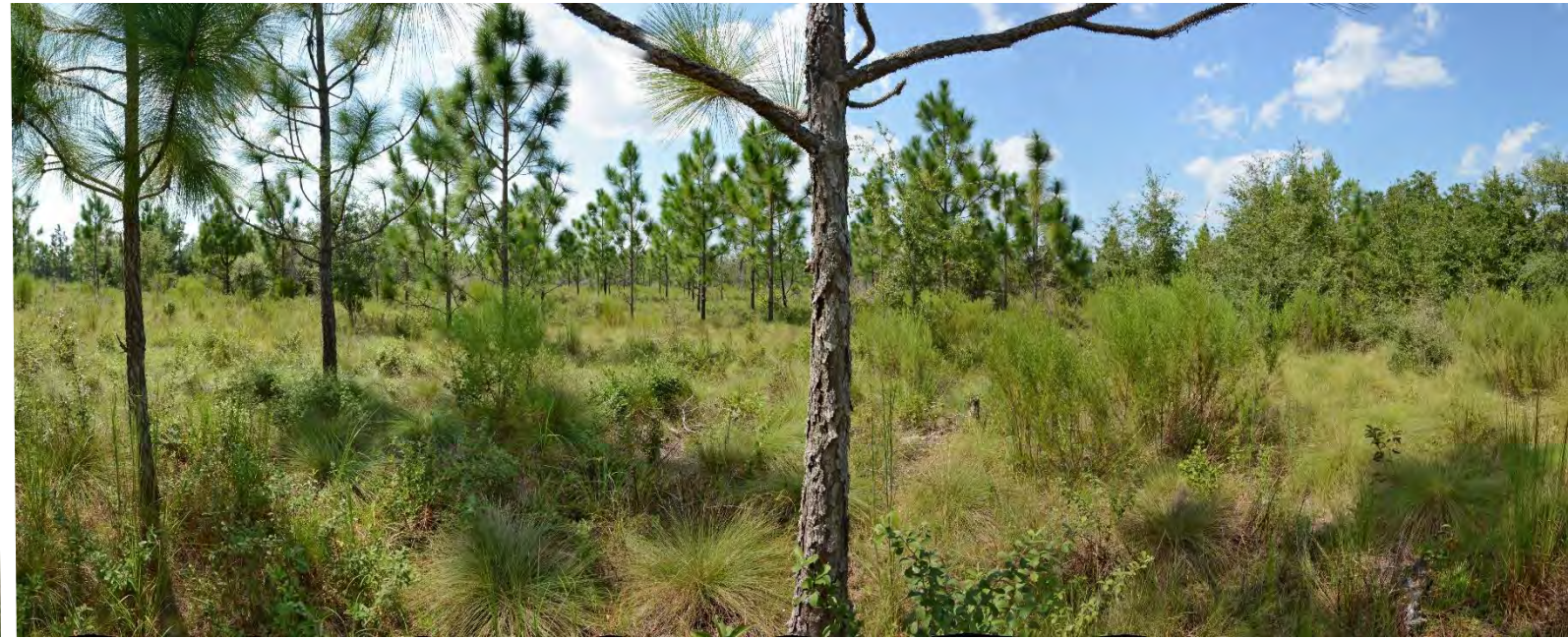
T1 – 2018 (9/14/2018)