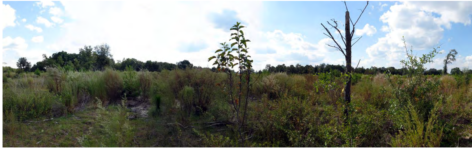
T1 – 2009 (10/26/2009)