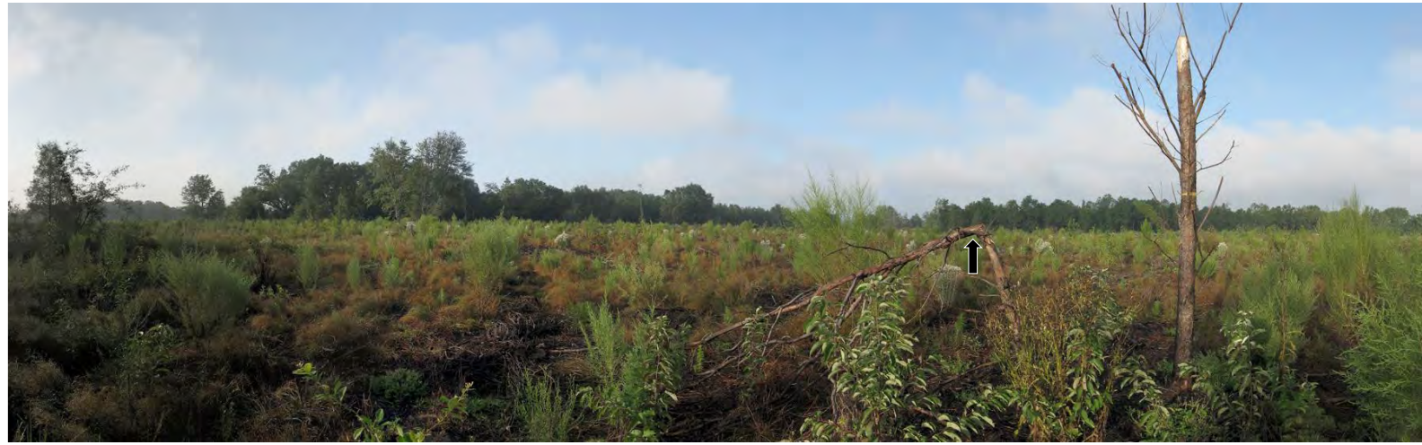
T1 – 2007 (11/01/2007)