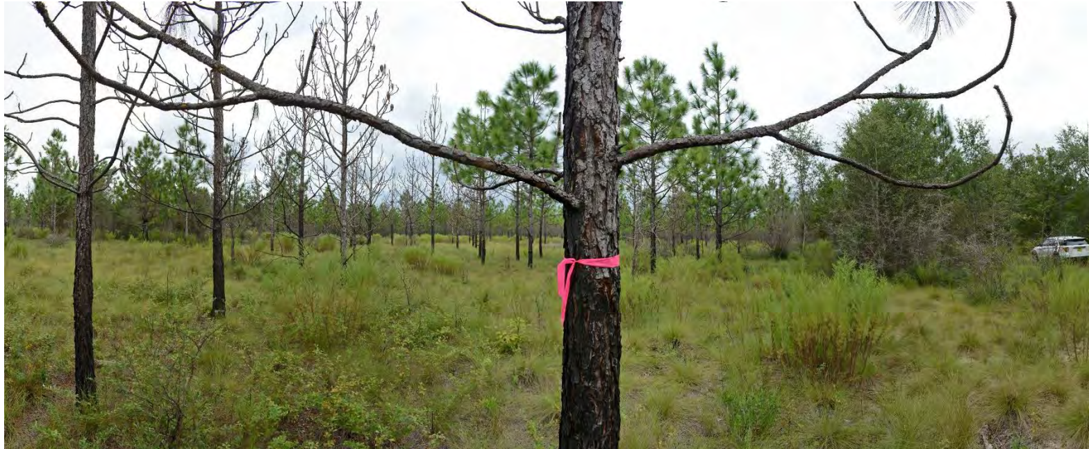
T1 – 2023 (9/26/2023)