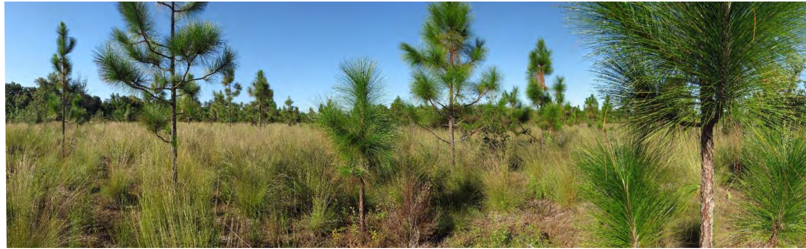
T1 – 2015 (9/23/2015)