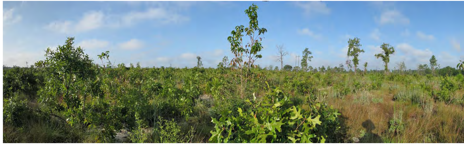
T3 – 2007 (11/01/2007)