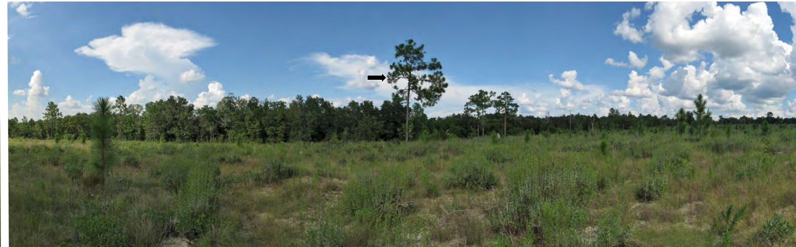
T3 – 2012 (9/14/2012)