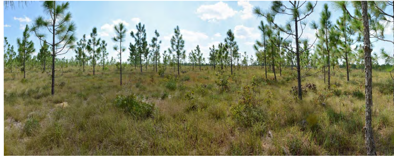
T3 – 2018 (9/14/2018)