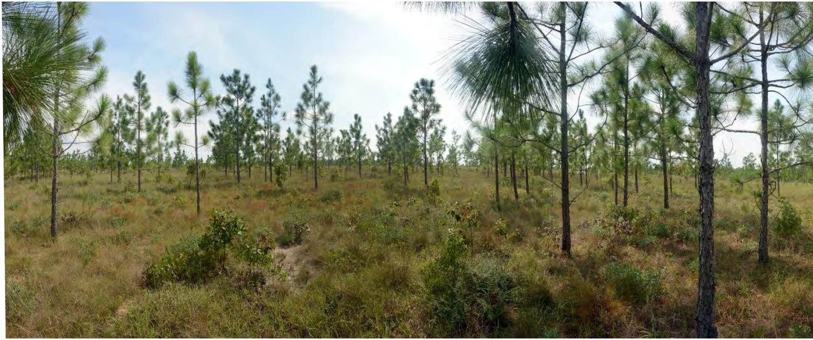
T3 – 2020 (10/16/2020)