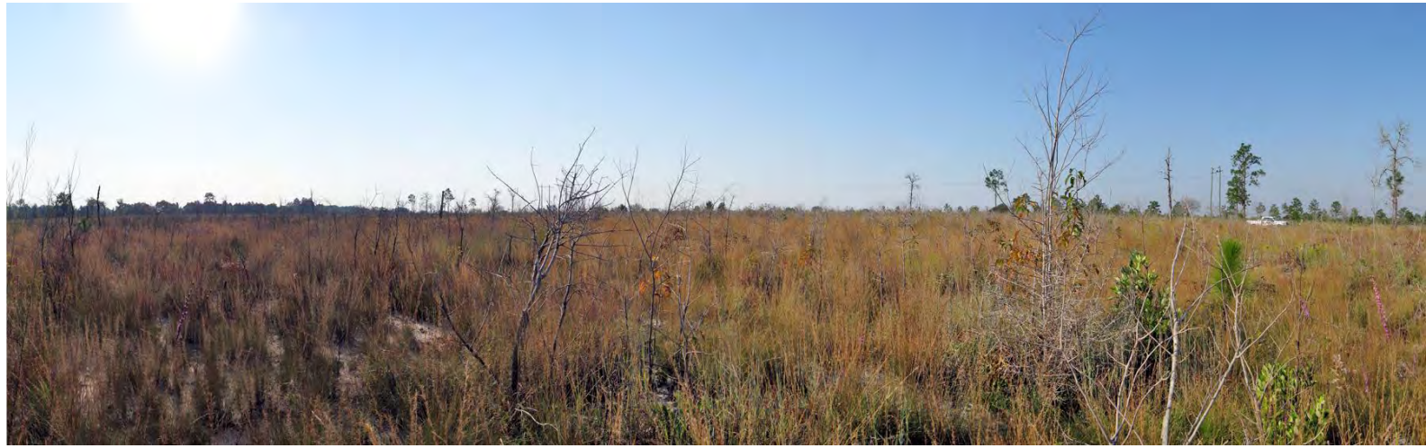
T3 – 2009 (10/26/2009)