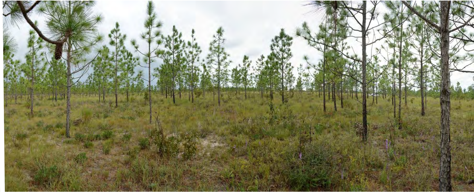
T3 – 2022 (9/27/2022)