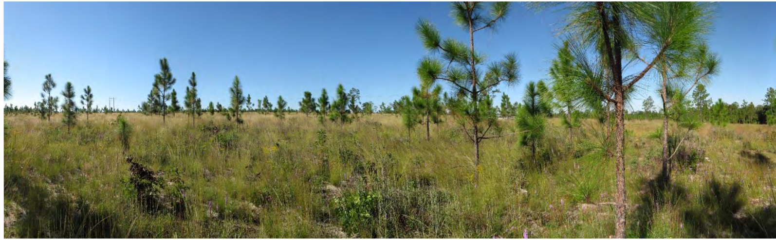
T3 – 2015 (9/23/2015)