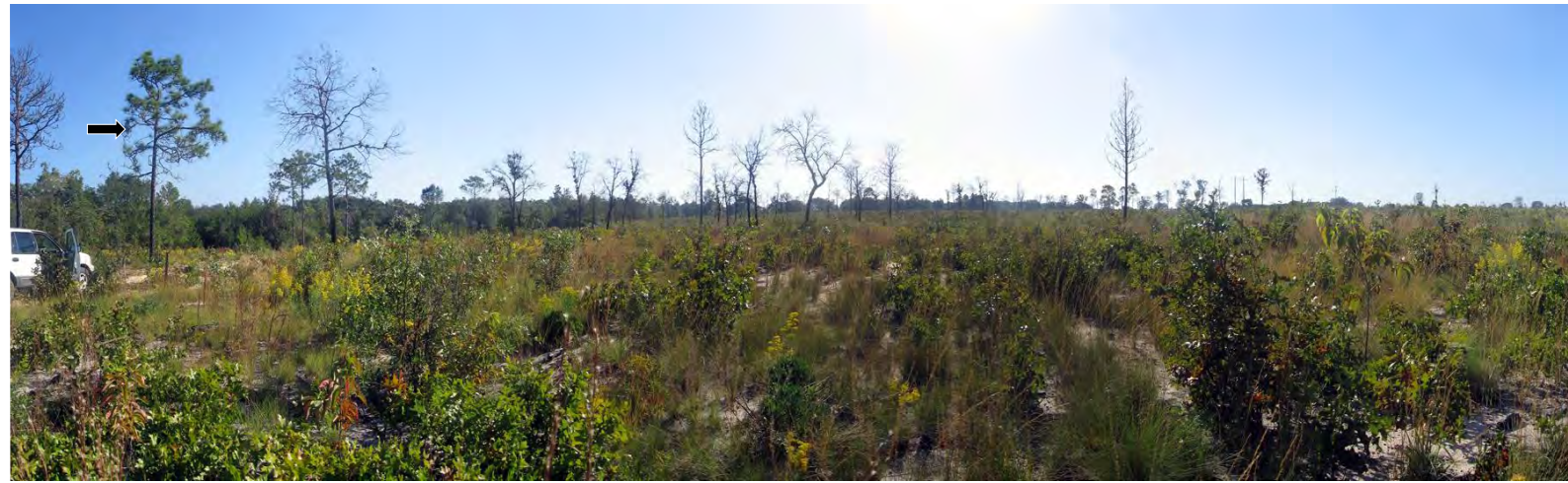
T3 – 2006 (10/20/2006)