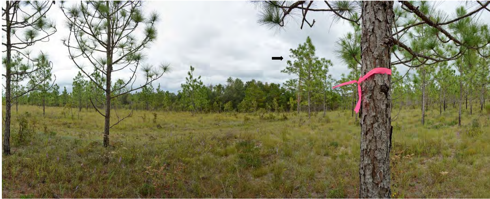
T3 – 2023 (9/26/2023)