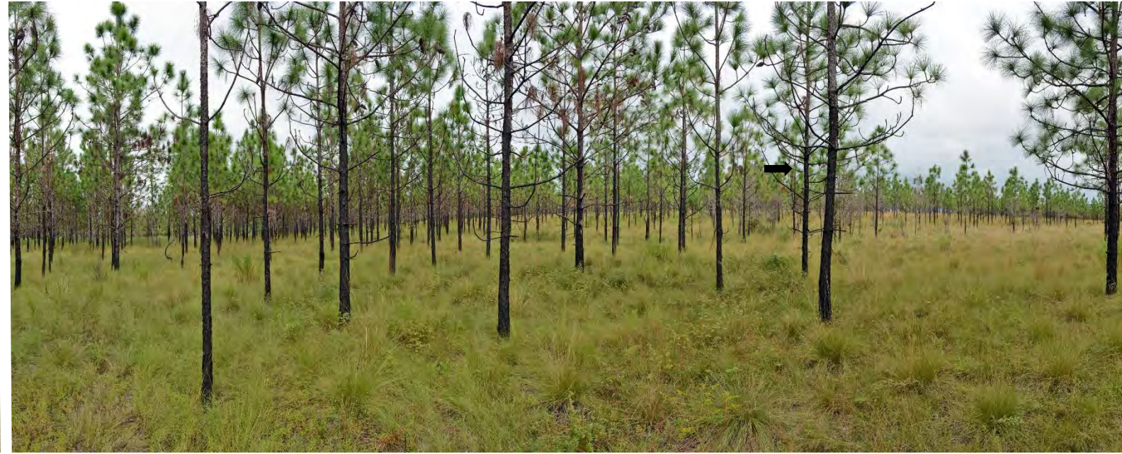
T4 – 2022 (9/27/2022)