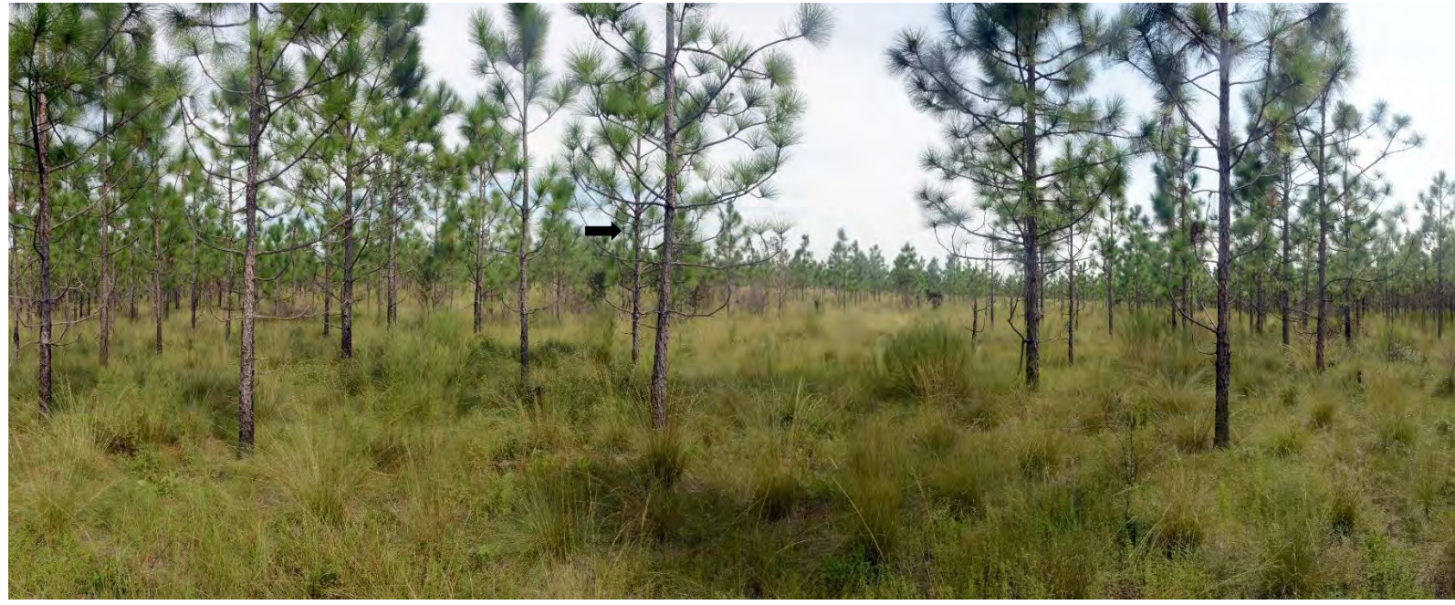
T4 – 2020 (10/16/2020)