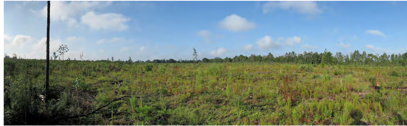
T4 – 2007 (11/01/2007)