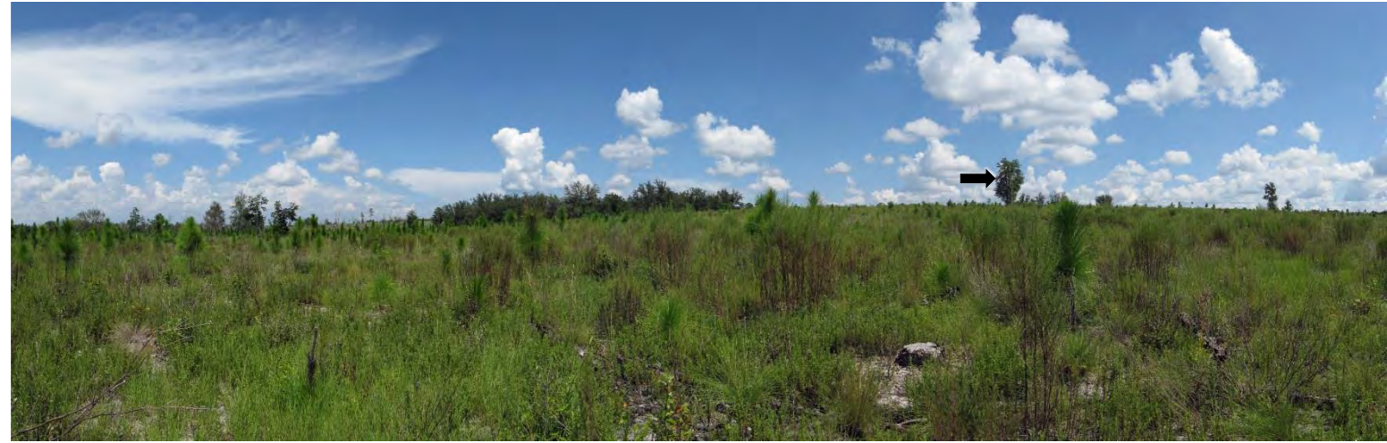
T4 – 2012 (9/14/2012)