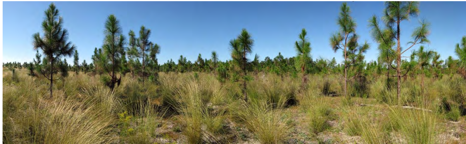
T4 – 2015 (9/23/2015)