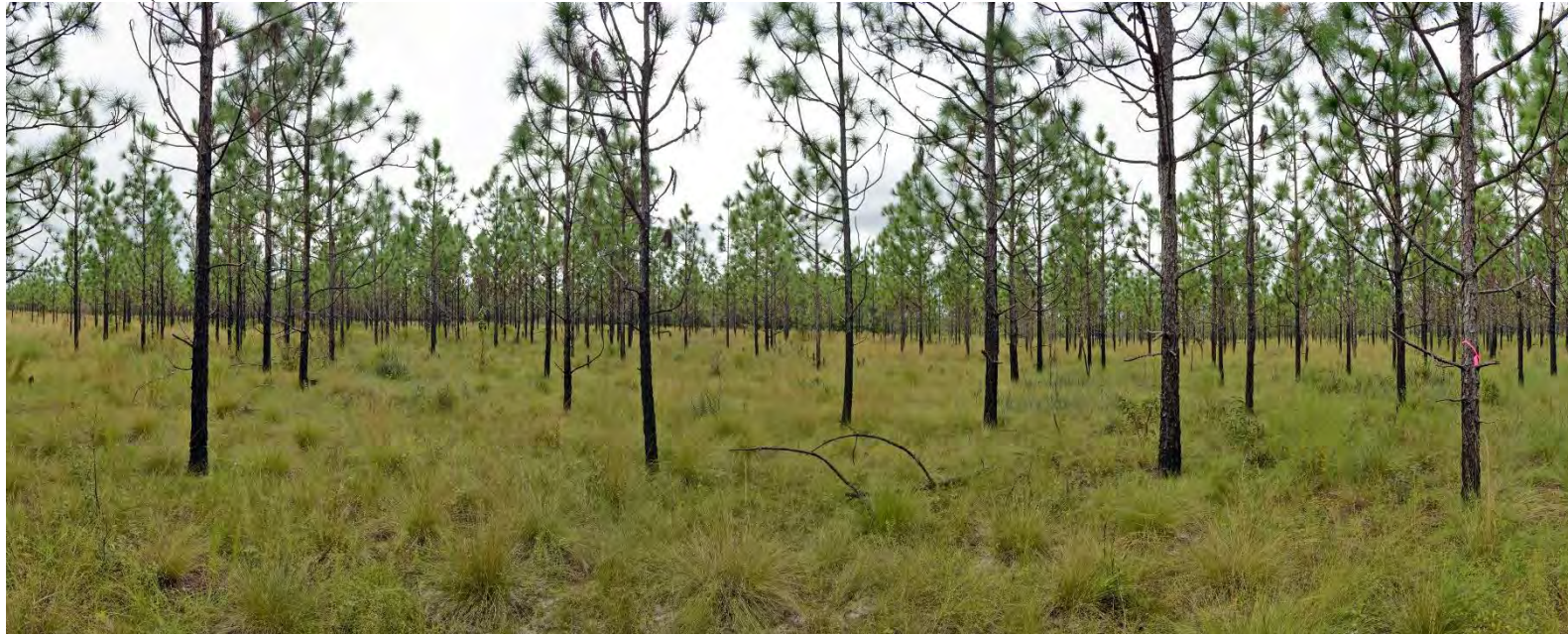
T4 – 2023 (9/26/2023)