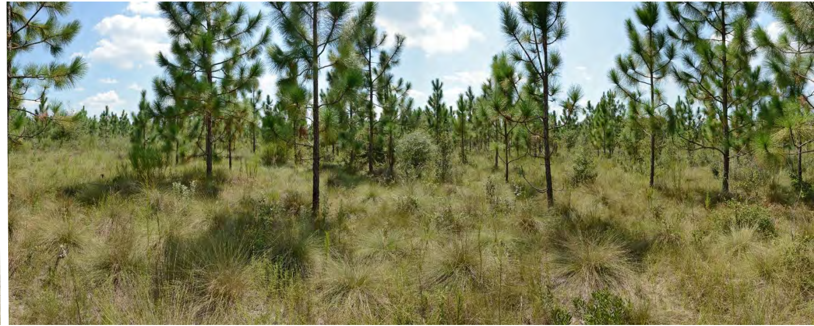
T4 – 2018 (9/14/2018)