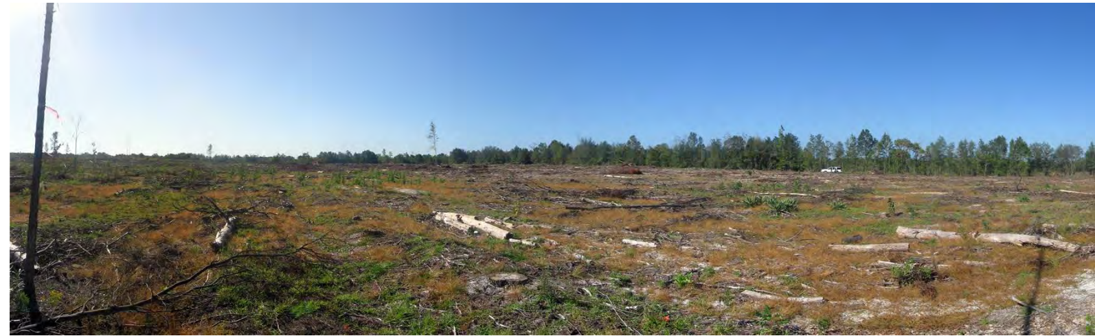
T4 – 2006 (10/20/2006)