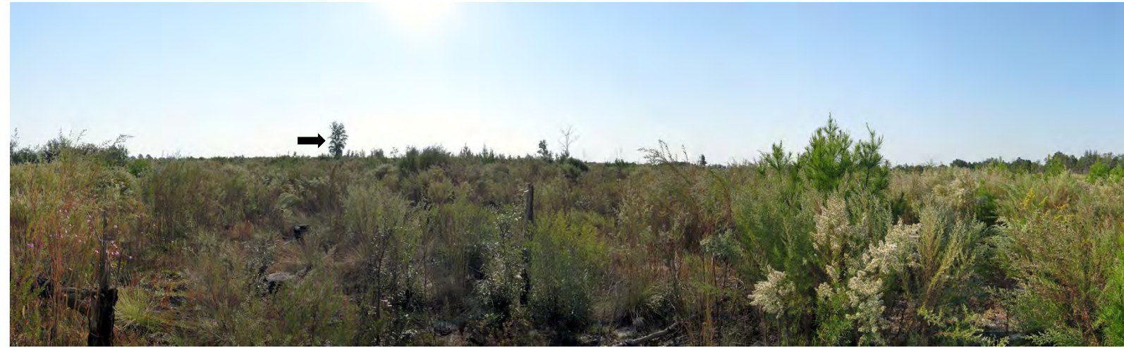
T4 – 2009 (10/26/2009)