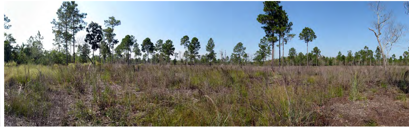
T6 – 2009 (10/26/2009)