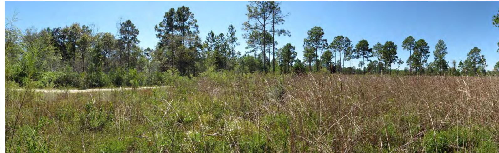
T6 – 2015 (9/23/2015)