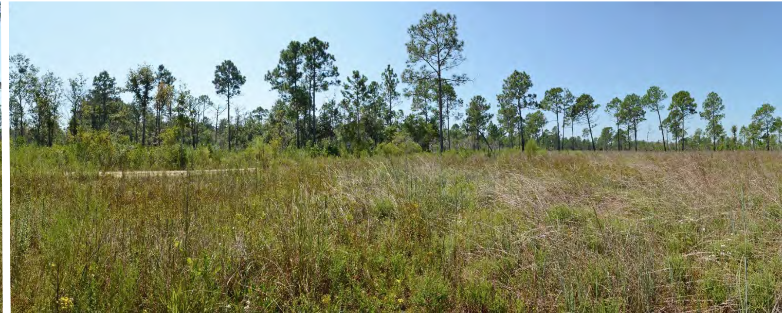
T6 – 2018 (9/14/2018)