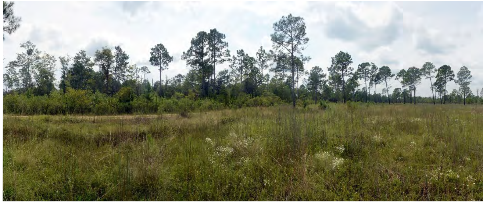
T6 – 2020 (10/16/2020)