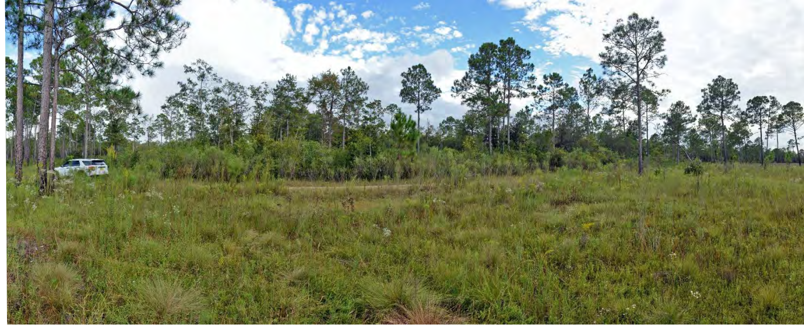
T6 – 2022 (9/27/2022)