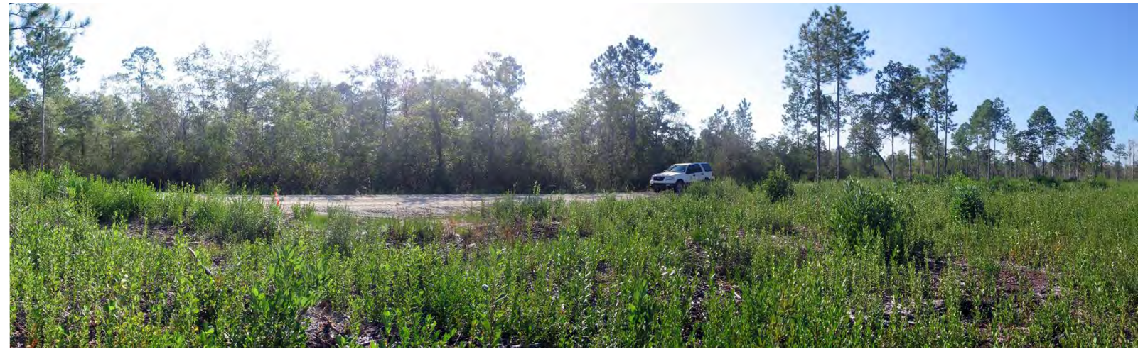
T6 – 2006 (10/20/2006)