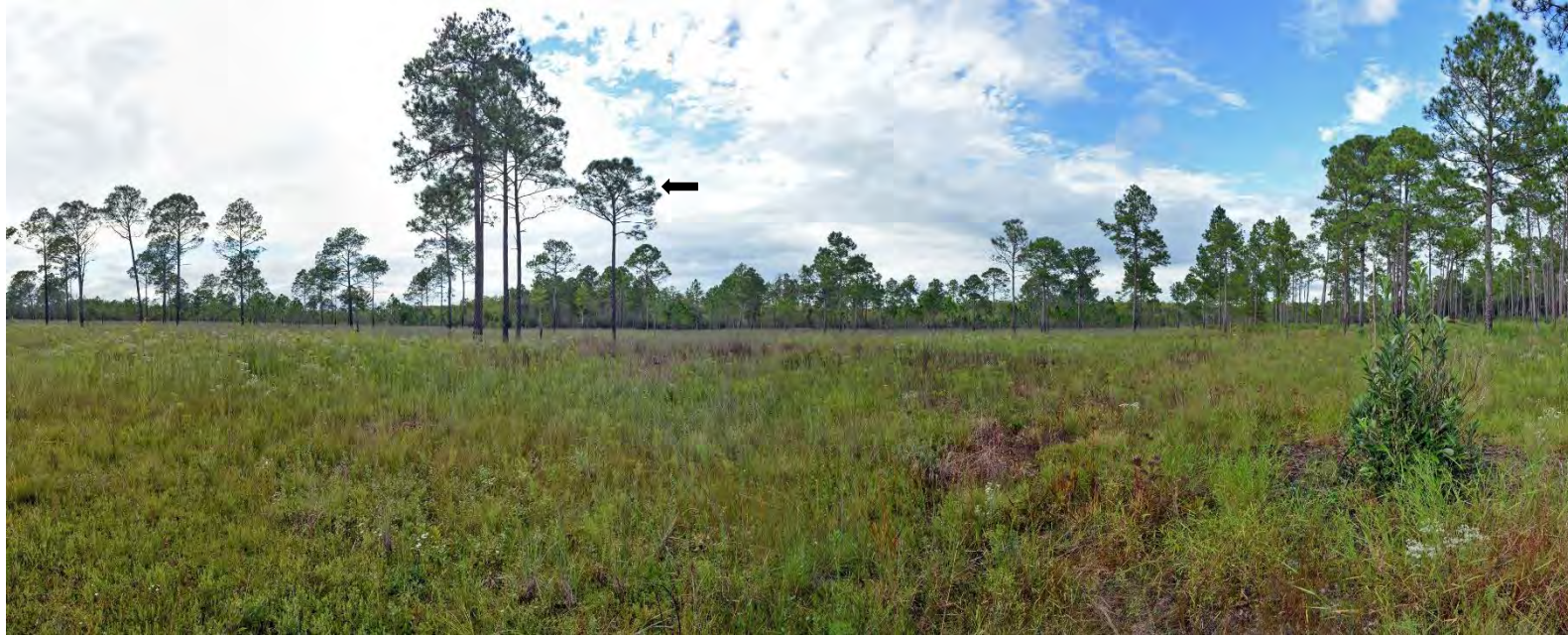
T6 – 2023 (9/26/2023)