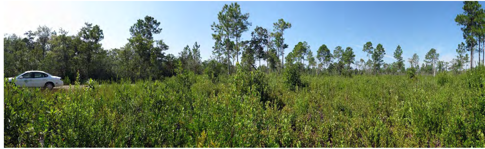
T6 – 2007 (11/02/2007)