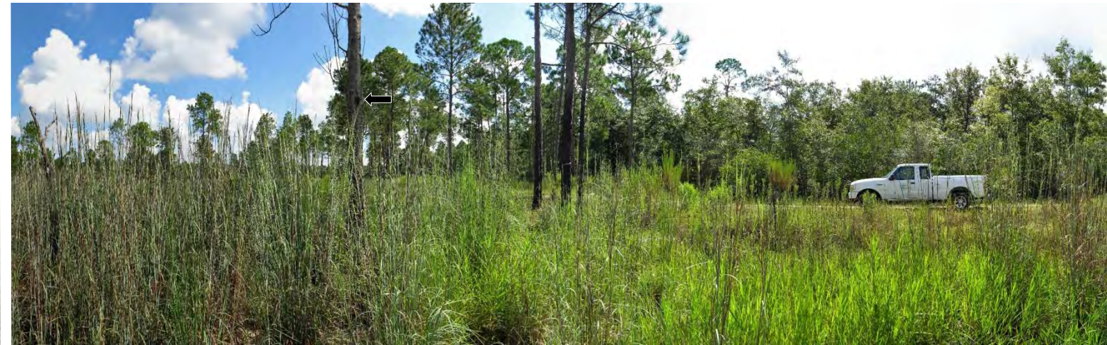
T6 – 2012 (9/14/2012)