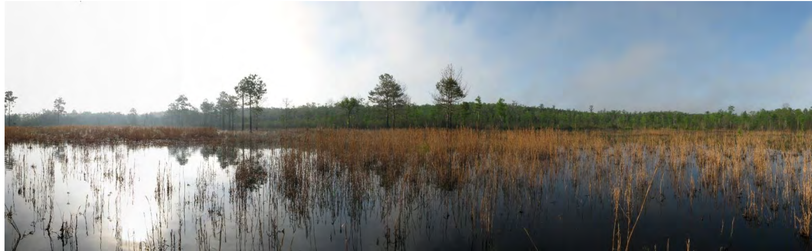
T7 – 2013 (9/5/2013)