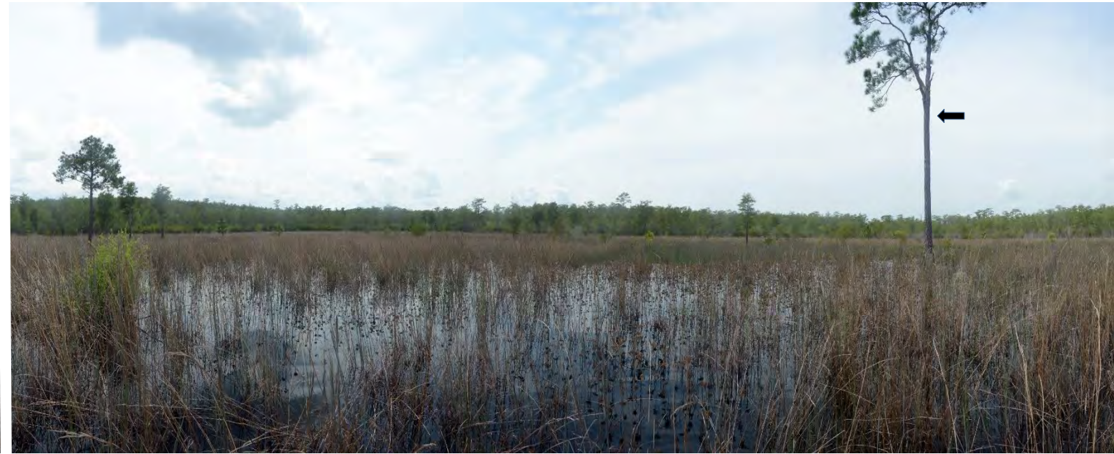
T7 – 2020 (10/16/2020)