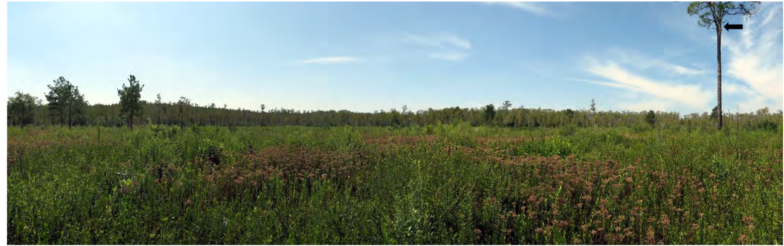
T7 – 2007 (11/02/2007)