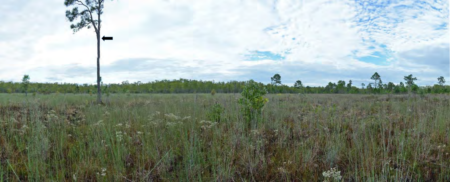
T7 – 2023 (9/26/2023)