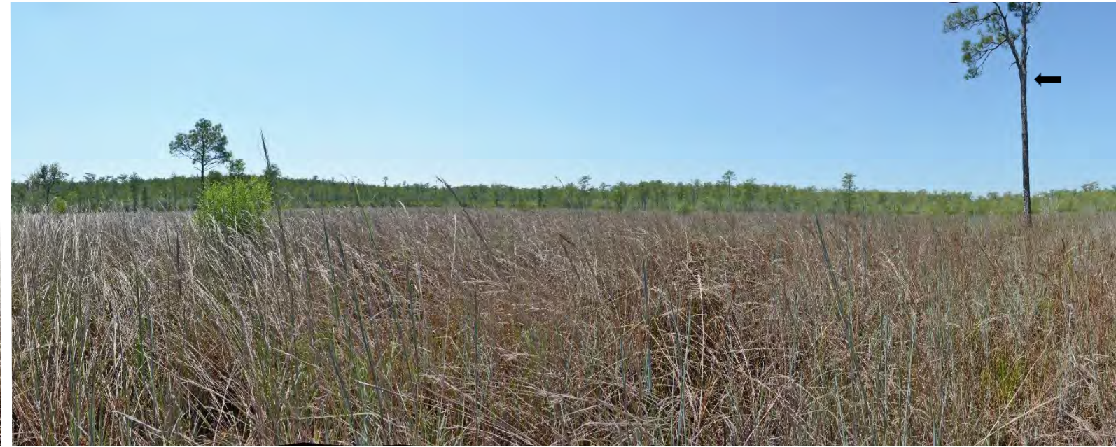
T7 – 2018 (9/14/2018)