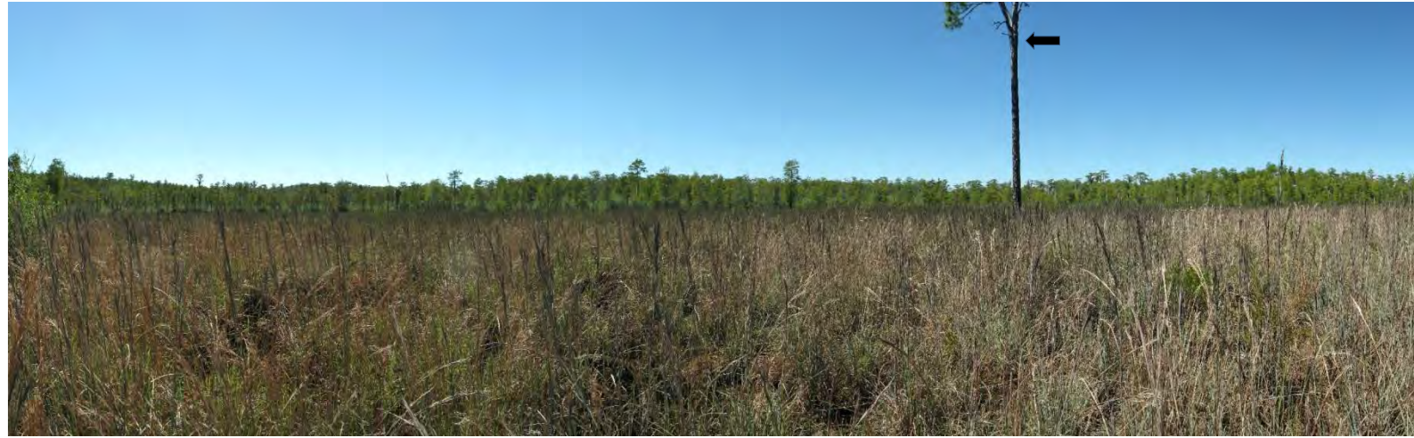
T7 – 2015 (9/23/2015)