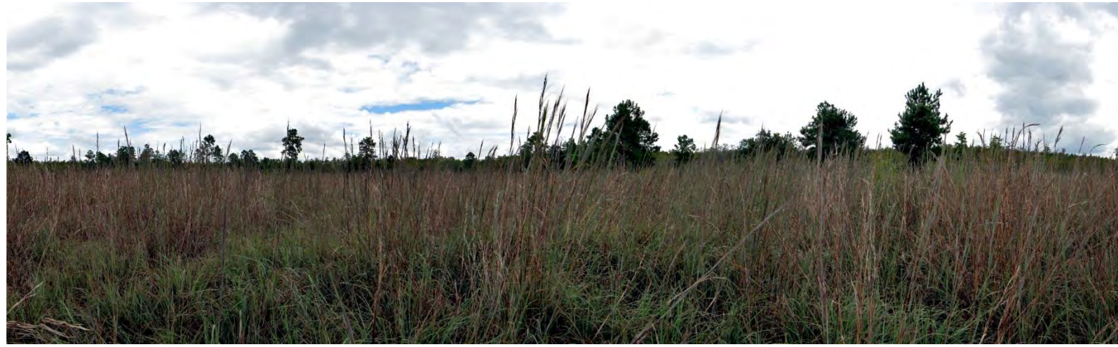
T7 – 2011 (10/13/2011)