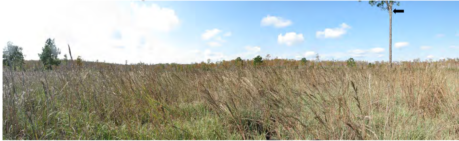
T7 – 2010 (10/20/2010)