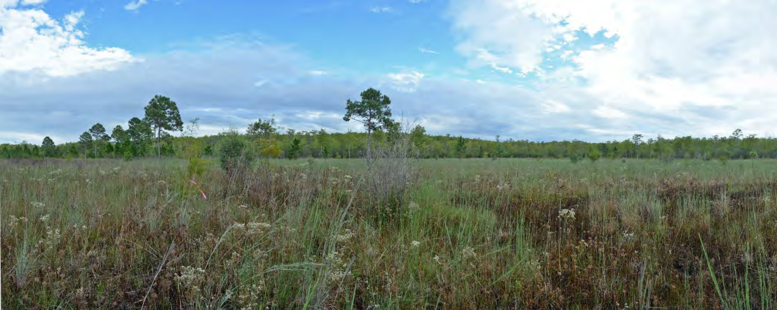
T7 – 2022 (9/27/2022)