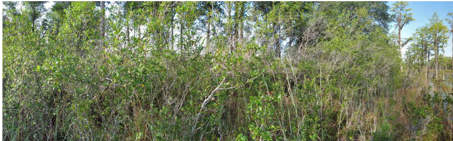
T9 – 2014 (9/26/2014)