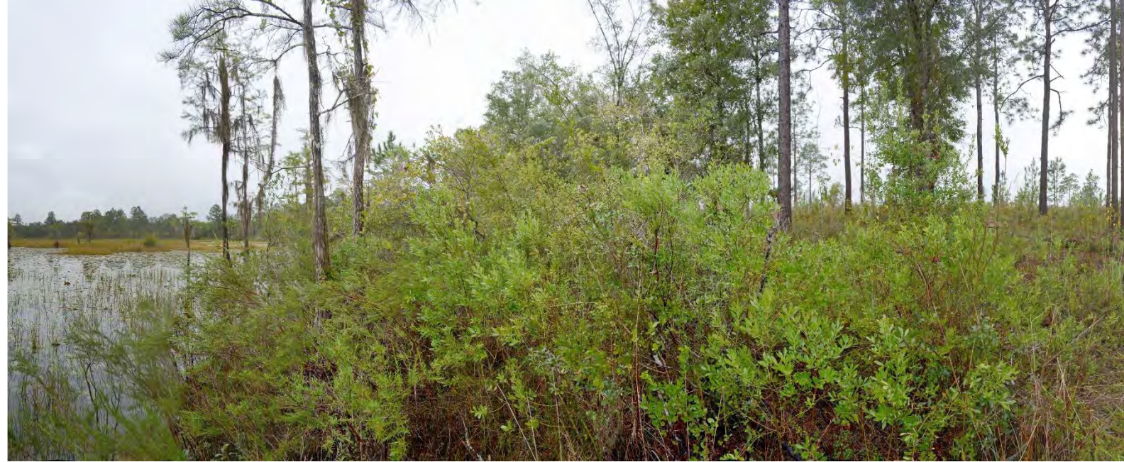
T9 – 2022 (9/27/2022)