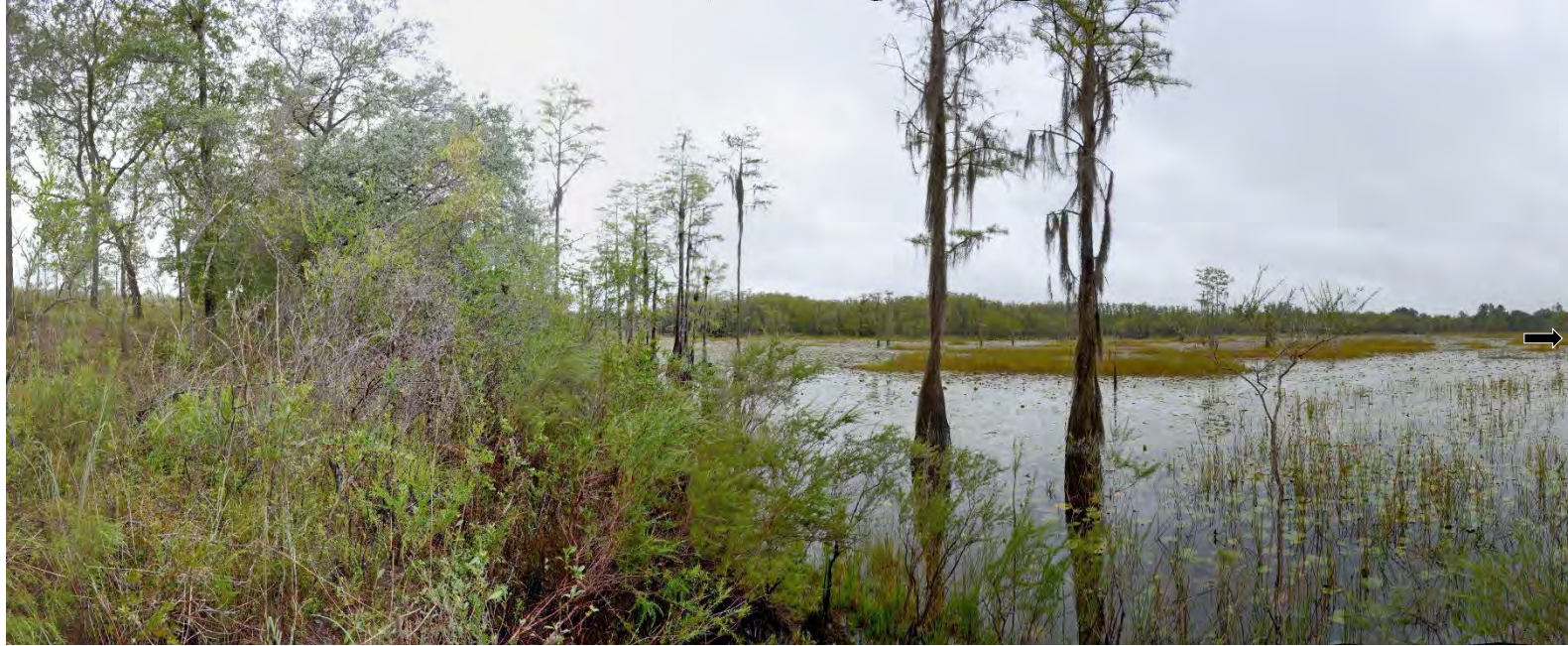
T9 – 2023 (9/26/2023)