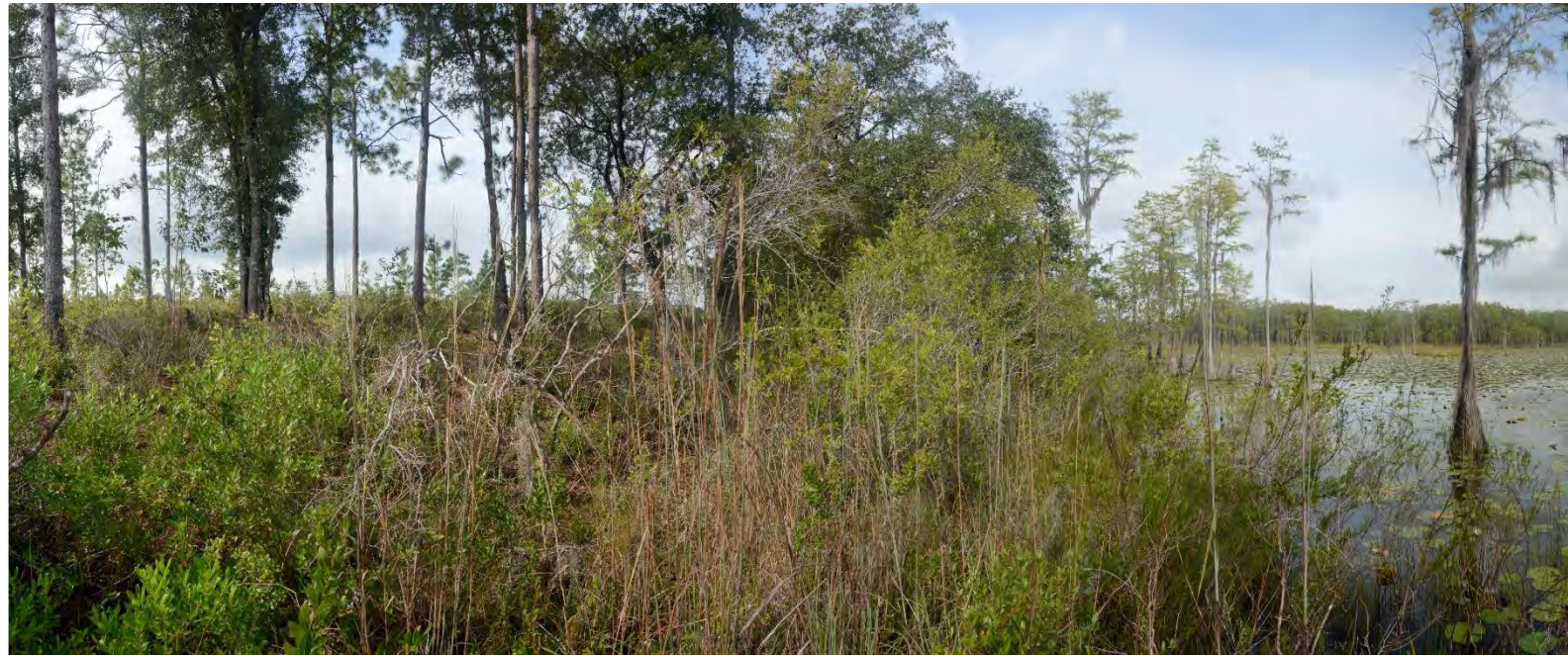
T9 – 2020 (10/16/2020)