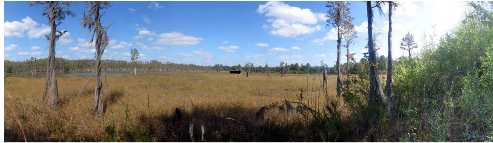
T9 – 2006 (10/20/2006)