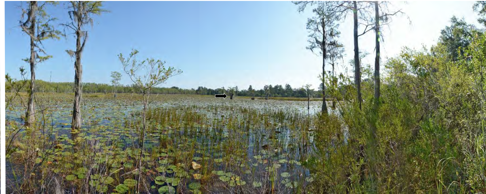
T9 – 2018 (9/14/2018)