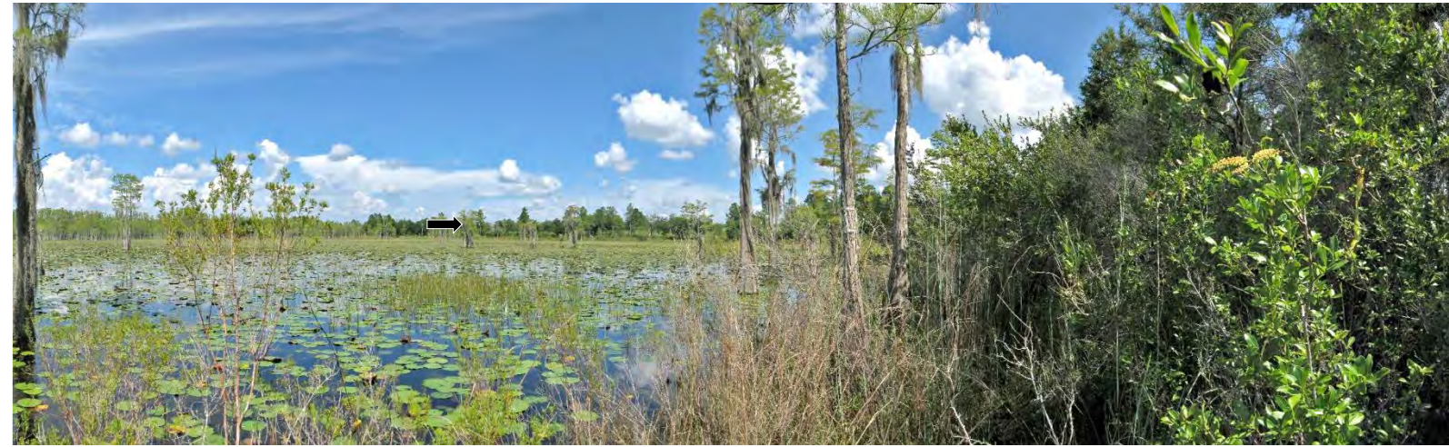
T9 – 2012 (9/14/2012)