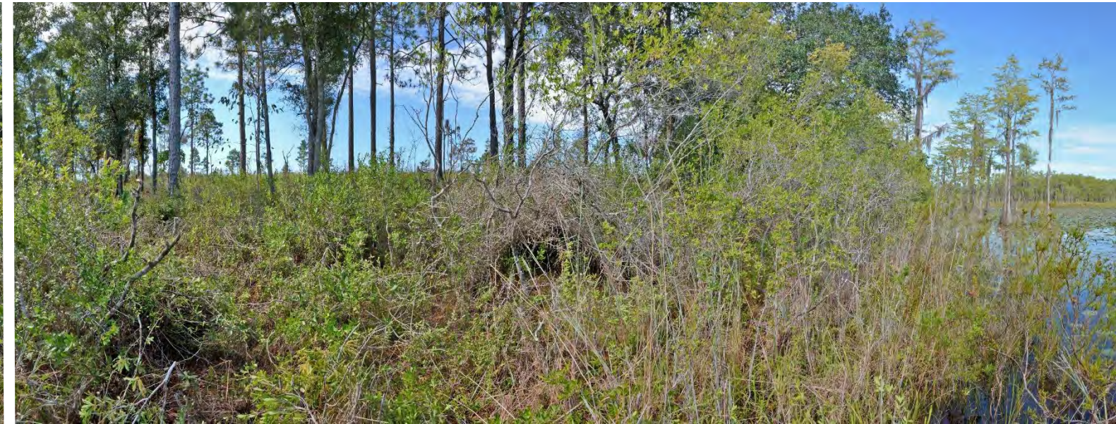
T9 – 2017 (10/19/2017)