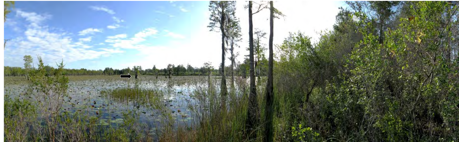
T9 – 2011 (10/13/2011)