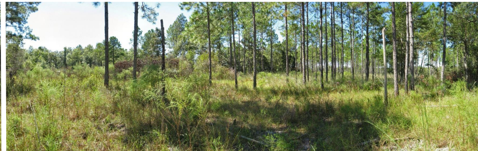
P10 – 2015 (9/23/2015)