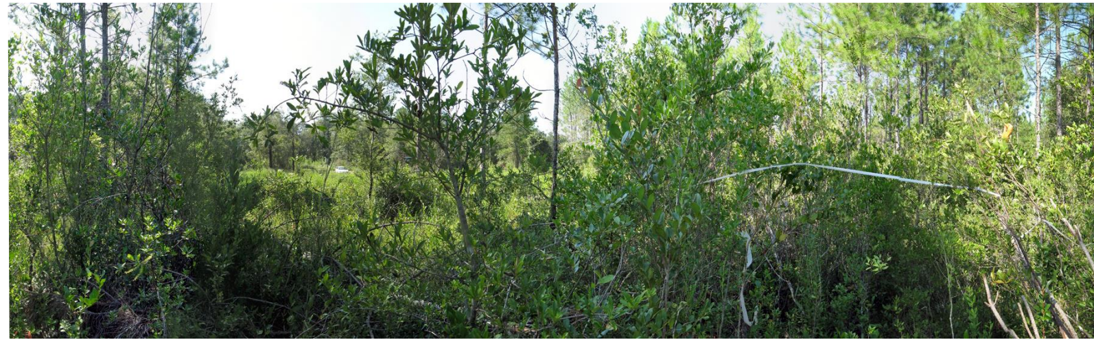
P10 – 2007 (11/01/2007)