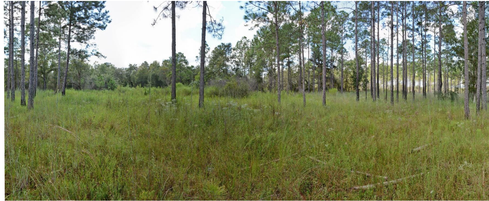
P10 – 2017 (10/19/2017)