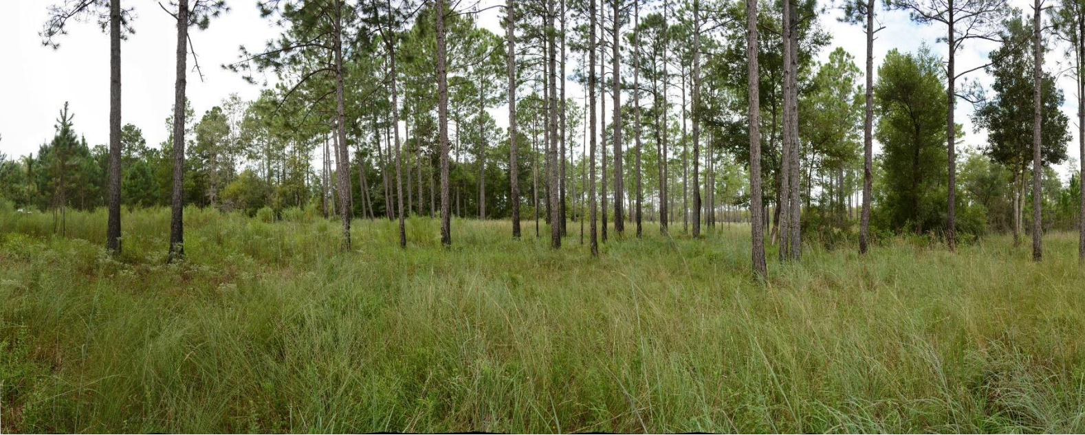
P10 – 2023 (9/26/2023)