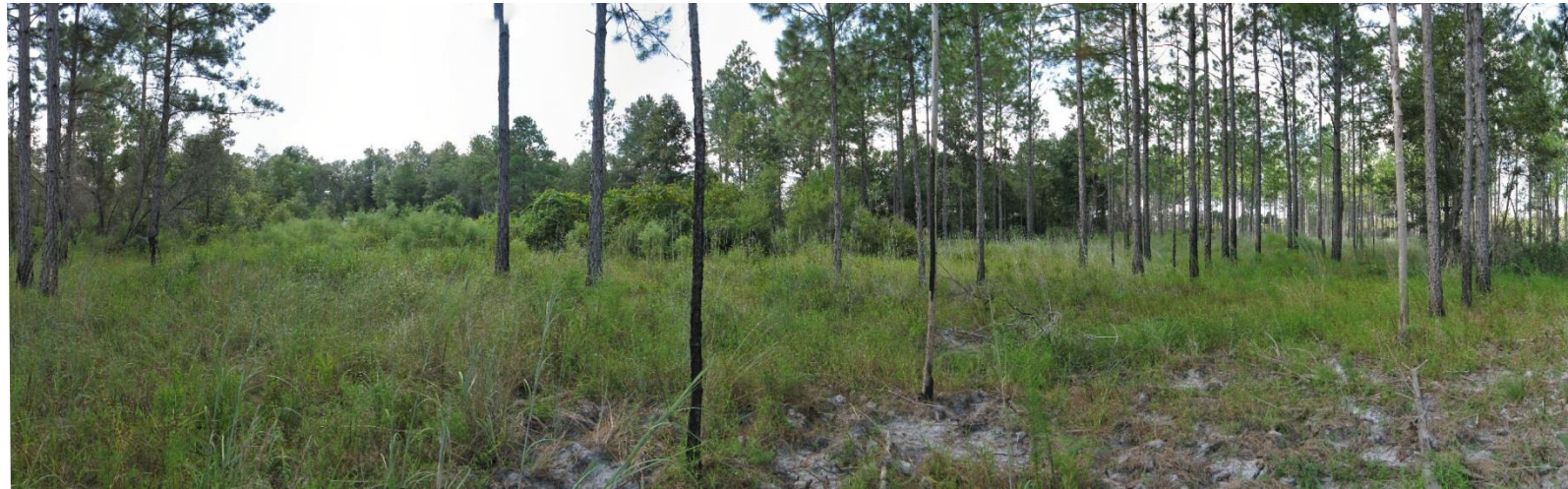
P10 – 2014 (9/26/2014)