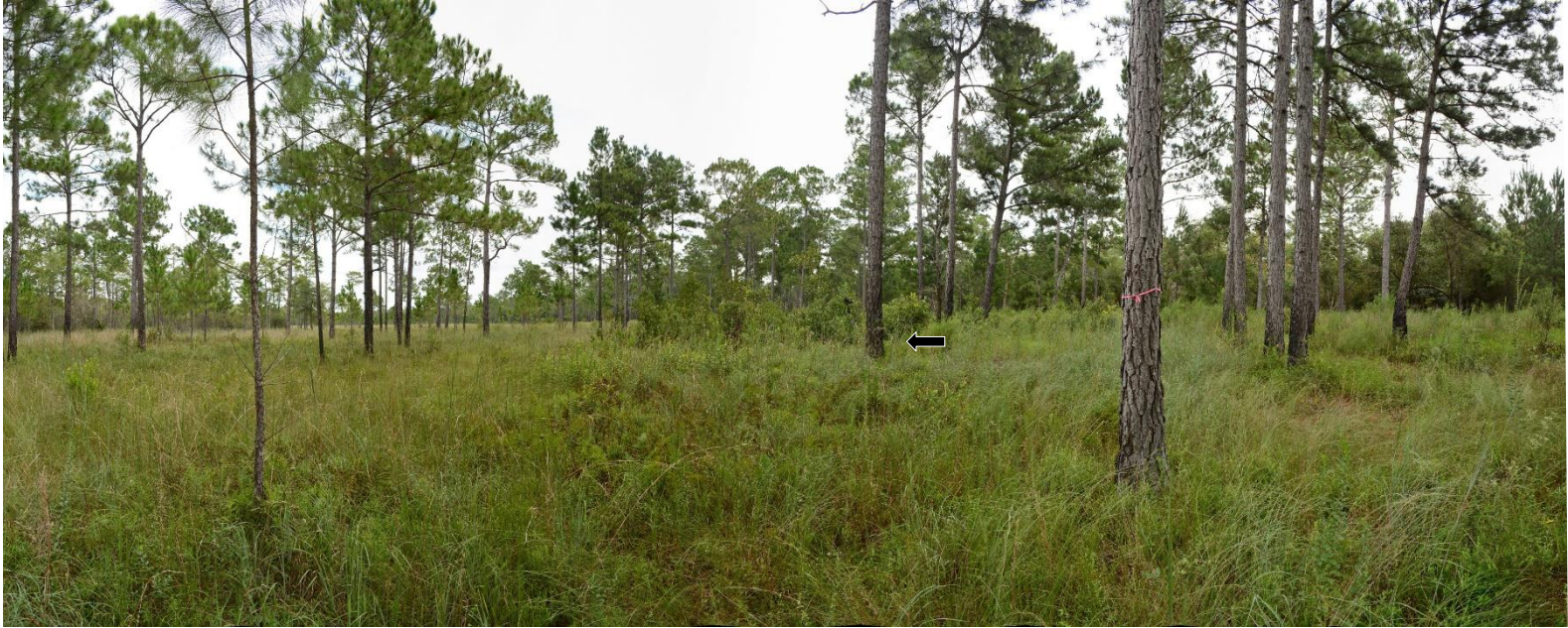
P10 – 2024 (9/4/2024)