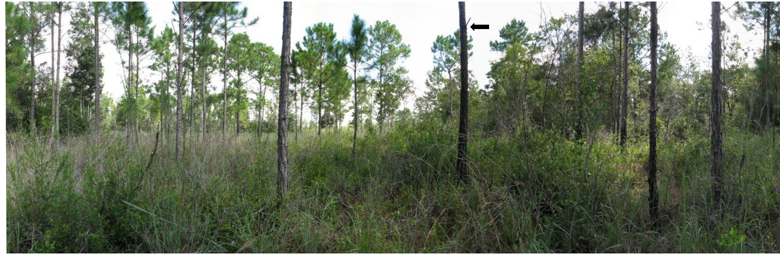
P10 – 2011 (10/13/2011)