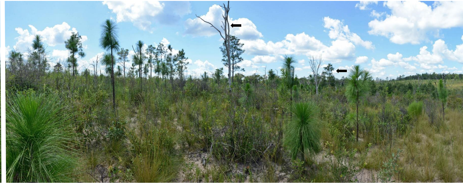
P11 – 2017 (10/19/2017)