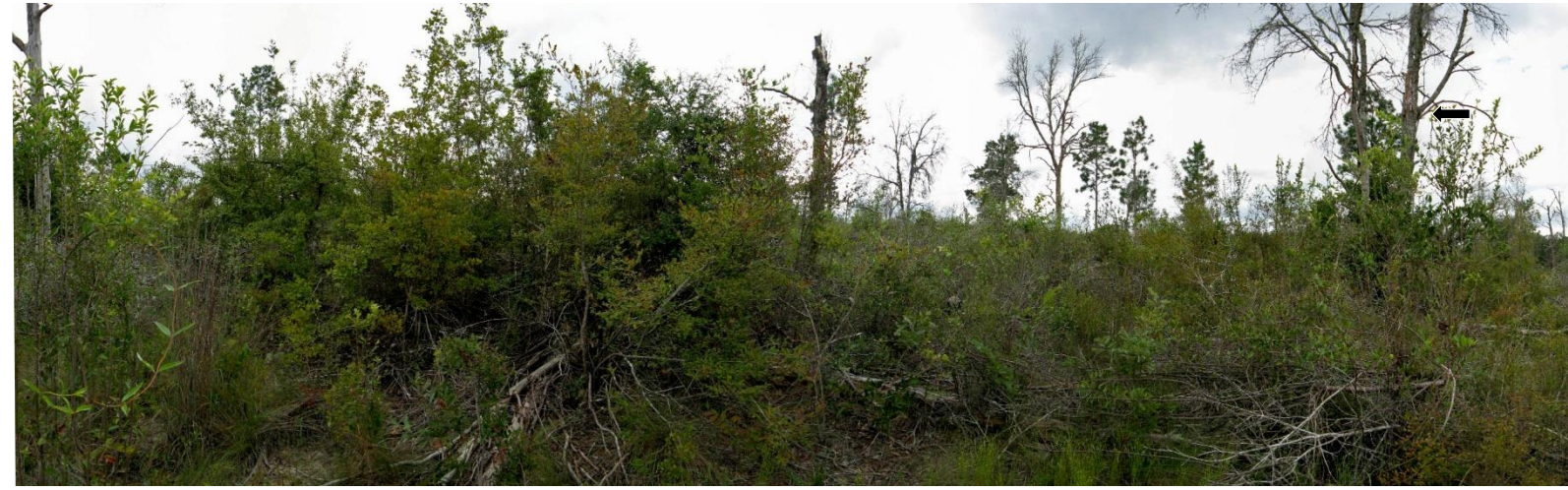
P11 – 2011 (10/13/2011)