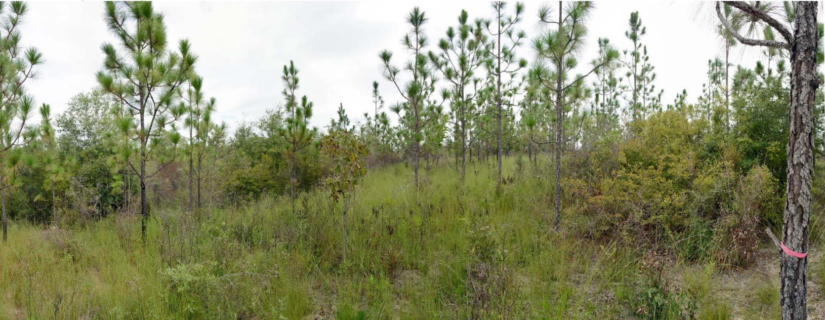
P11 – 2024 (9/4/2024)