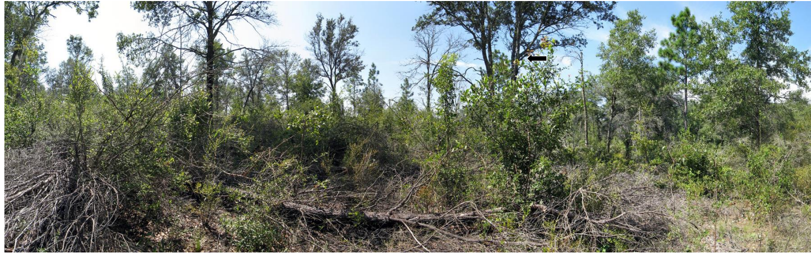
P11 – 2007 (11/02/2007)