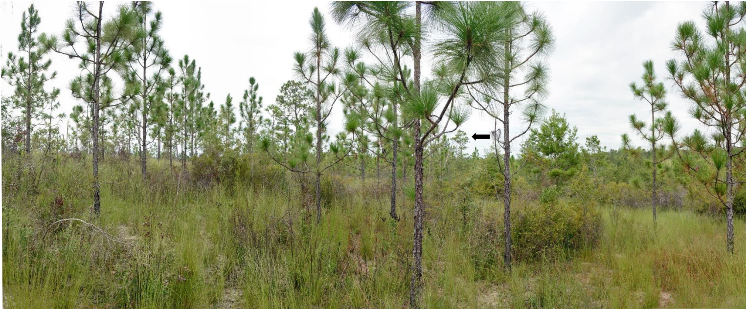
P11 – 2023 (9/26/2023)