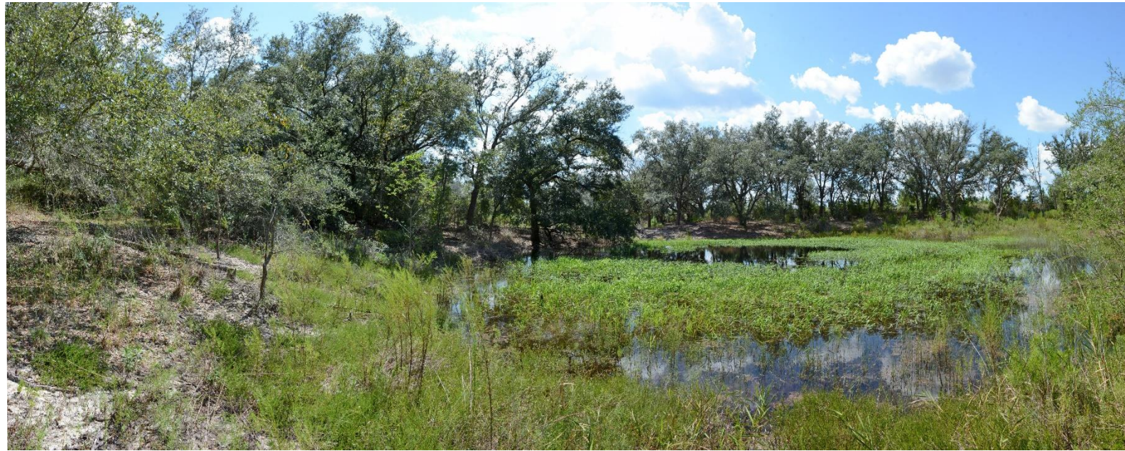
P13 – 2017 (10/19/2017)