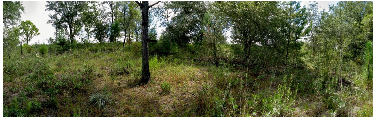
P13 – 2011 (10/13/2011)