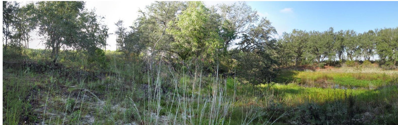
P13 – 2007 (11/02/2007)