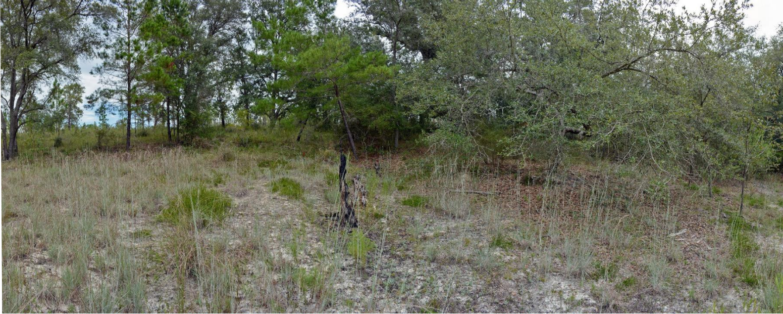
P13 – 2023 (9/26/2023)