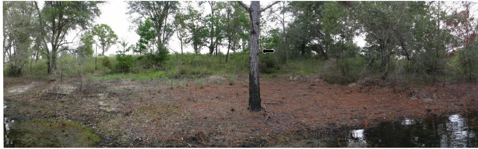
P13 – 2013 (9/5/2013) [Approximate Location of P13—Actual Point Submerged]