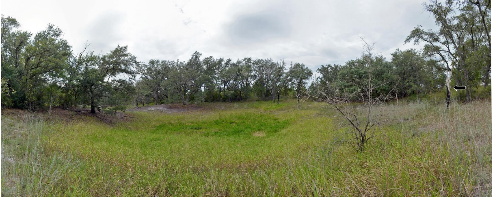
P13 – 2024 (9/4/2024)