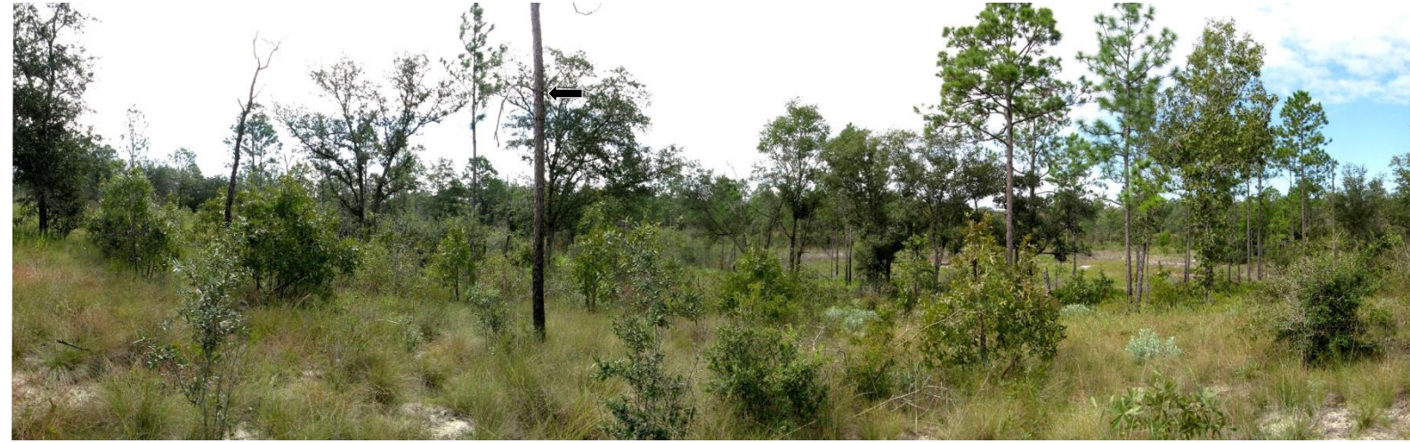
P15 – 2011 (10/20/2011)