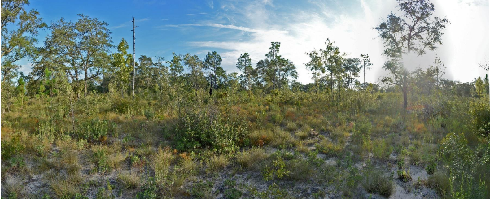
P15 – 2024 (9/4/2024)