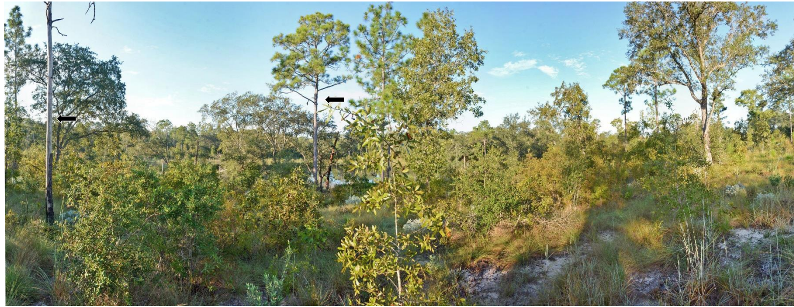
P15 – 2017 (10/19/2017)