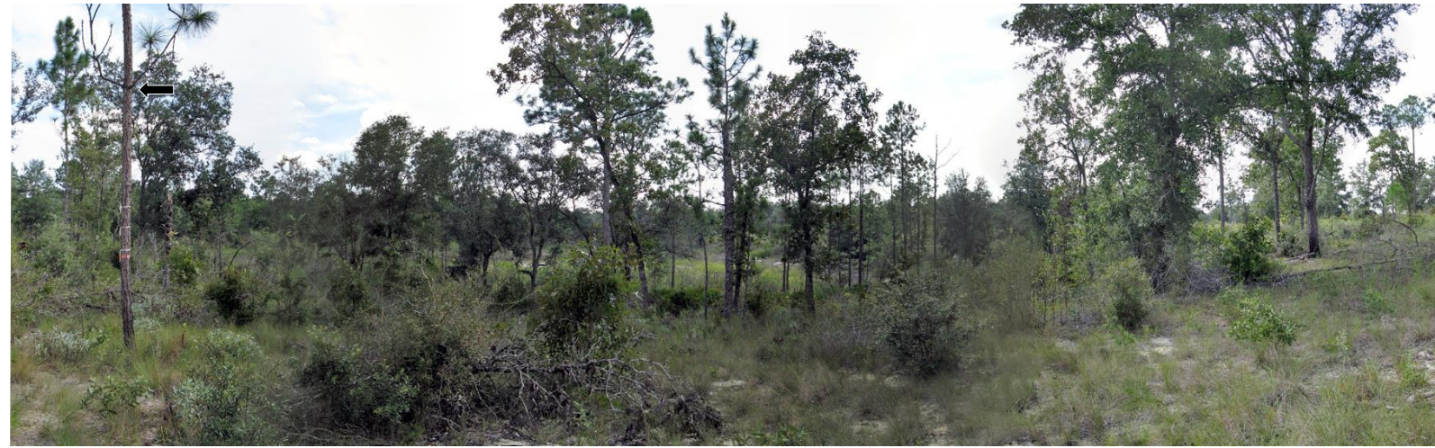
P15 – 2007 (11/02/2007)