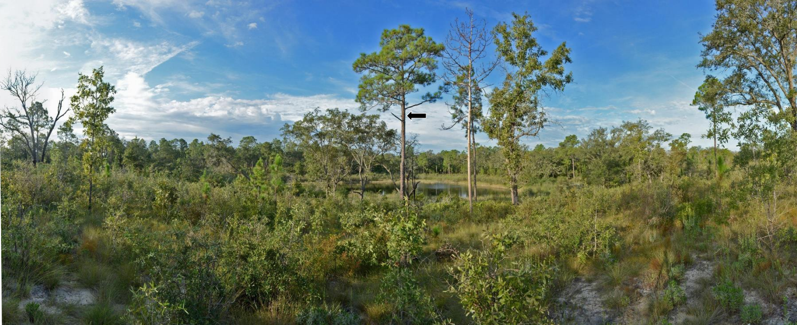
P15 – 2023 (9/26/2023)