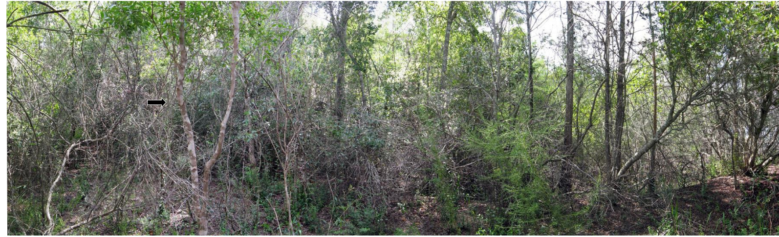
P4 – 2007 (11/02/2007)