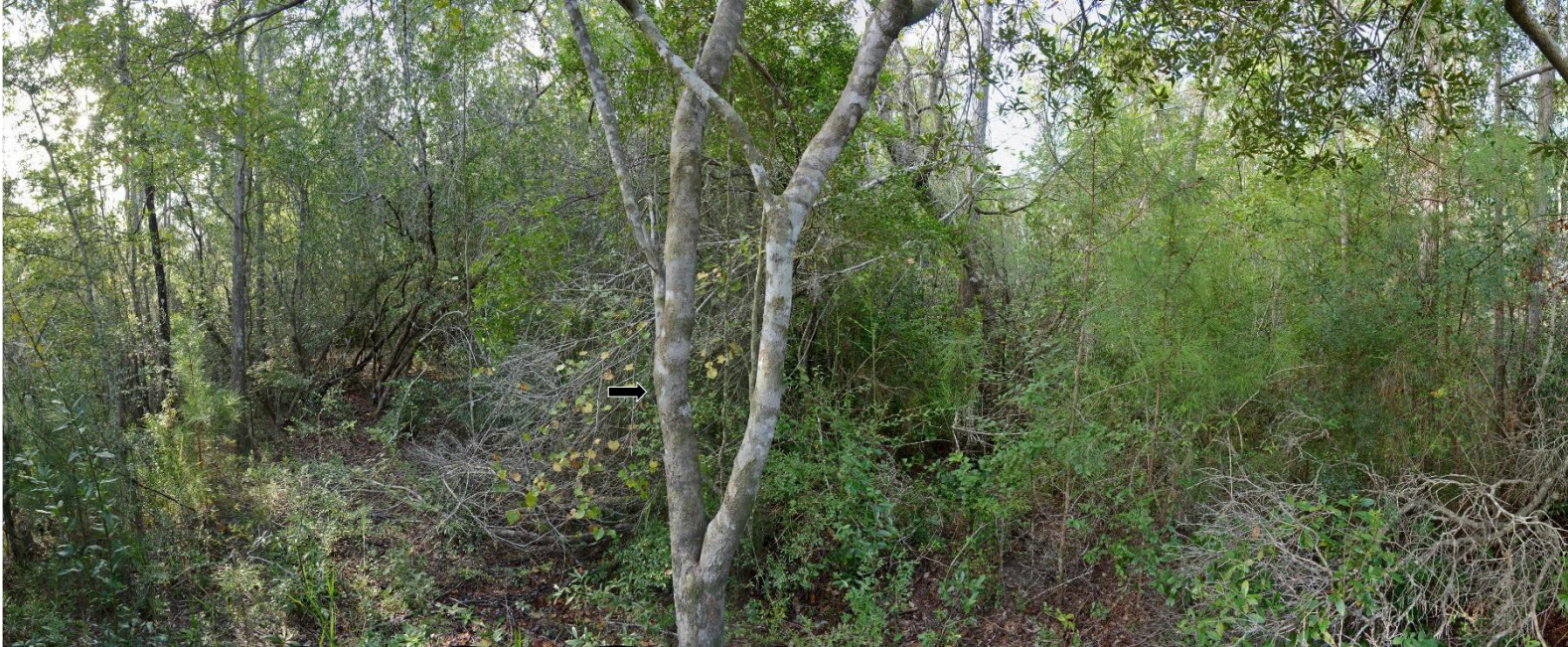
P4 – 2023 (9/26/2023)