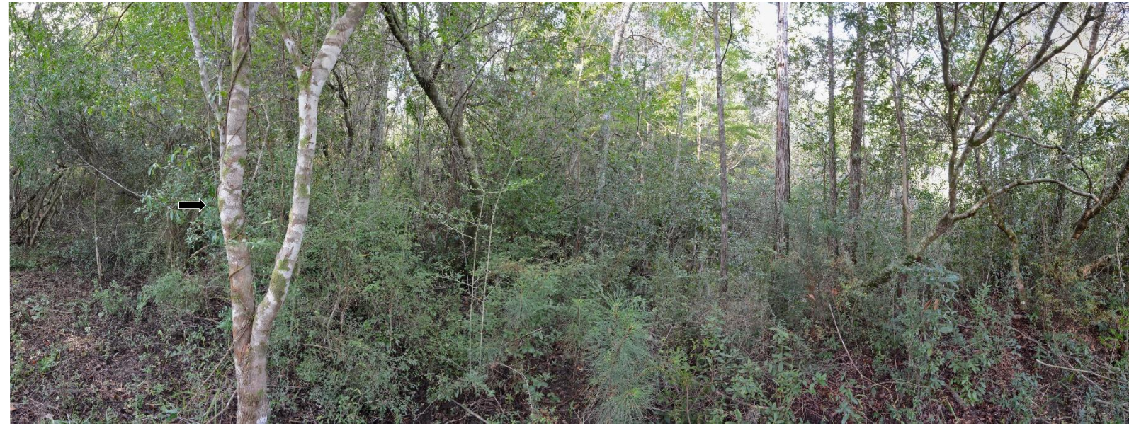
P4 – 2017 (10/19/2017)