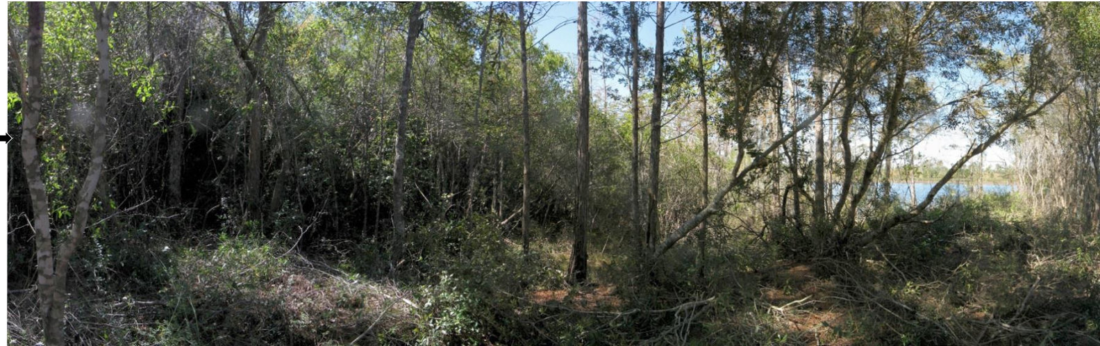
P4 – 2010 (10/20/2010)