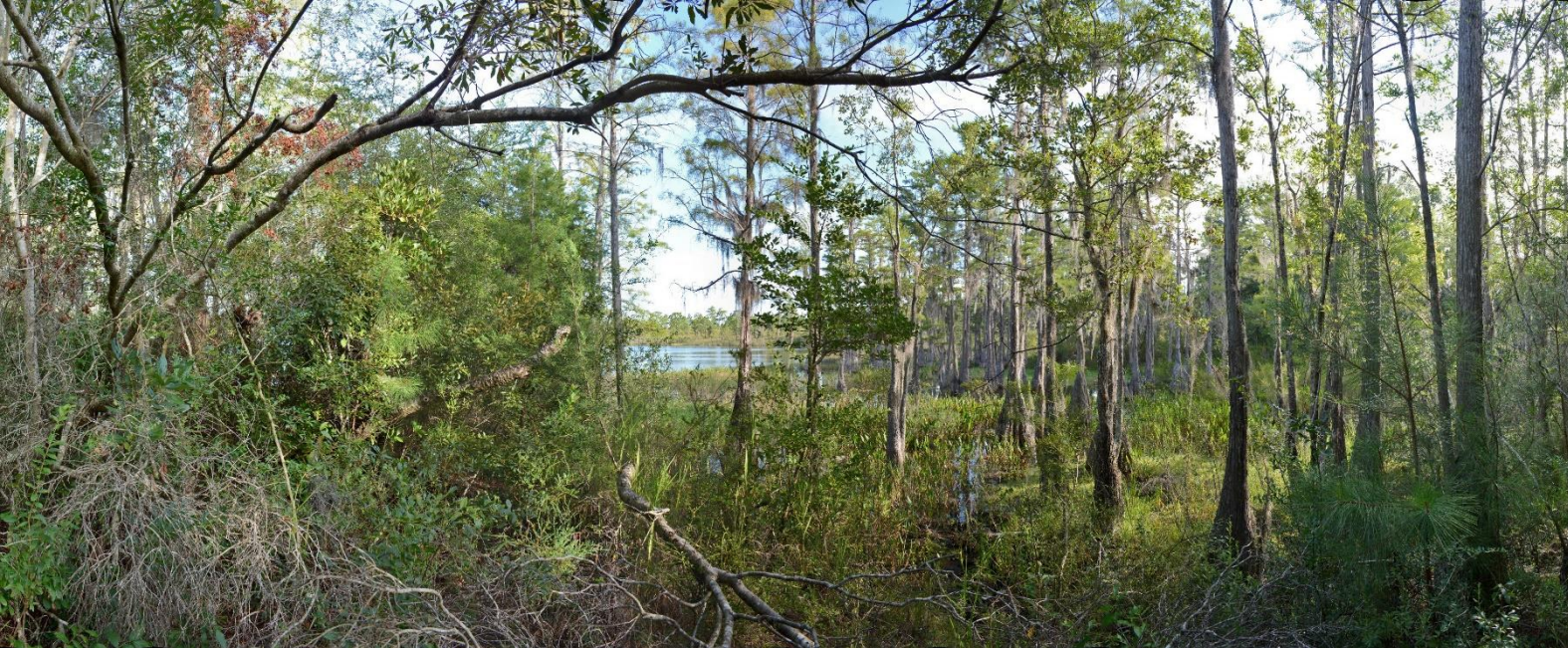
P4 – 2024 (9/4/2024)