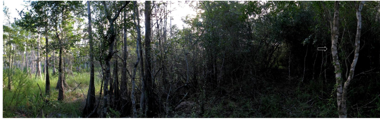
P4 – 2011 (10/20/2011)