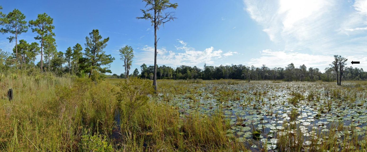
P5 – 2024 (9/4/2024)