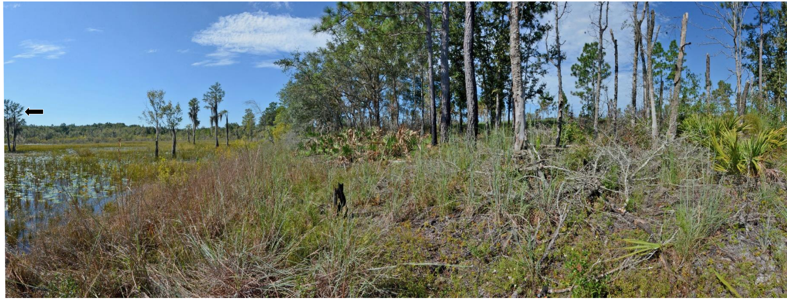
P5 – 2017 (10/19/2017)