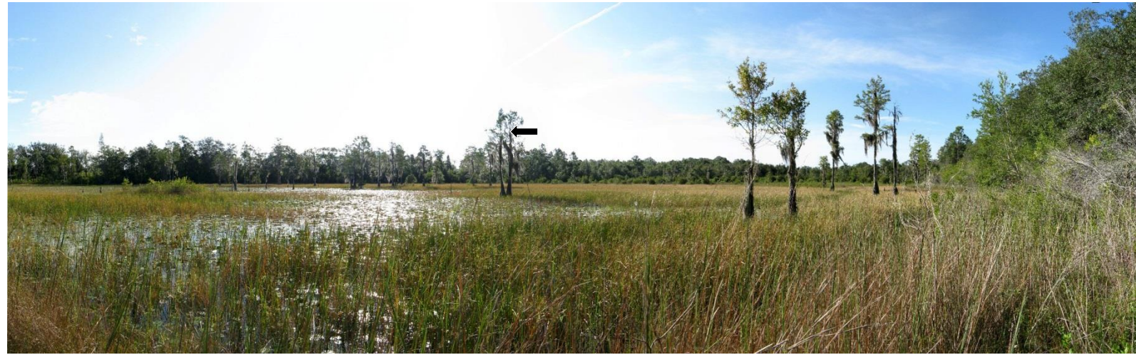
P5 – 2011 (10/13/2011)