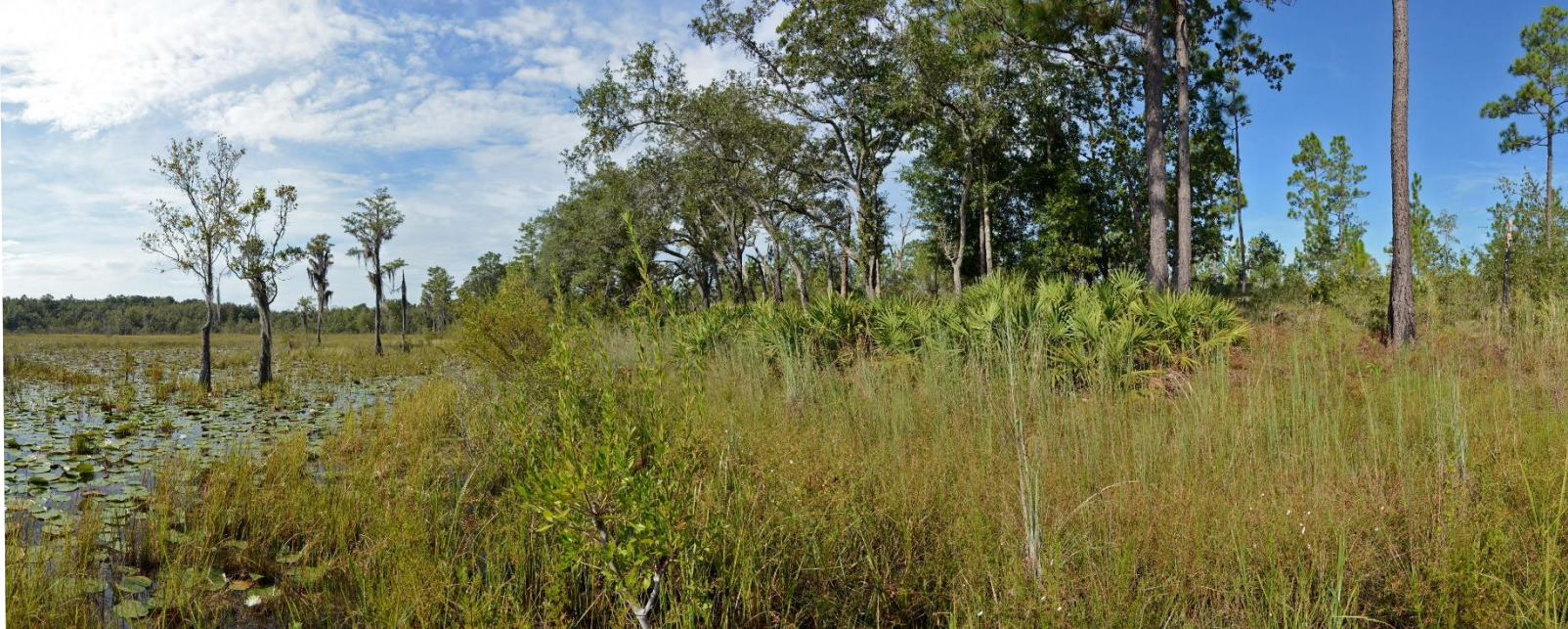
P5 – 2023 (9/26/2023)