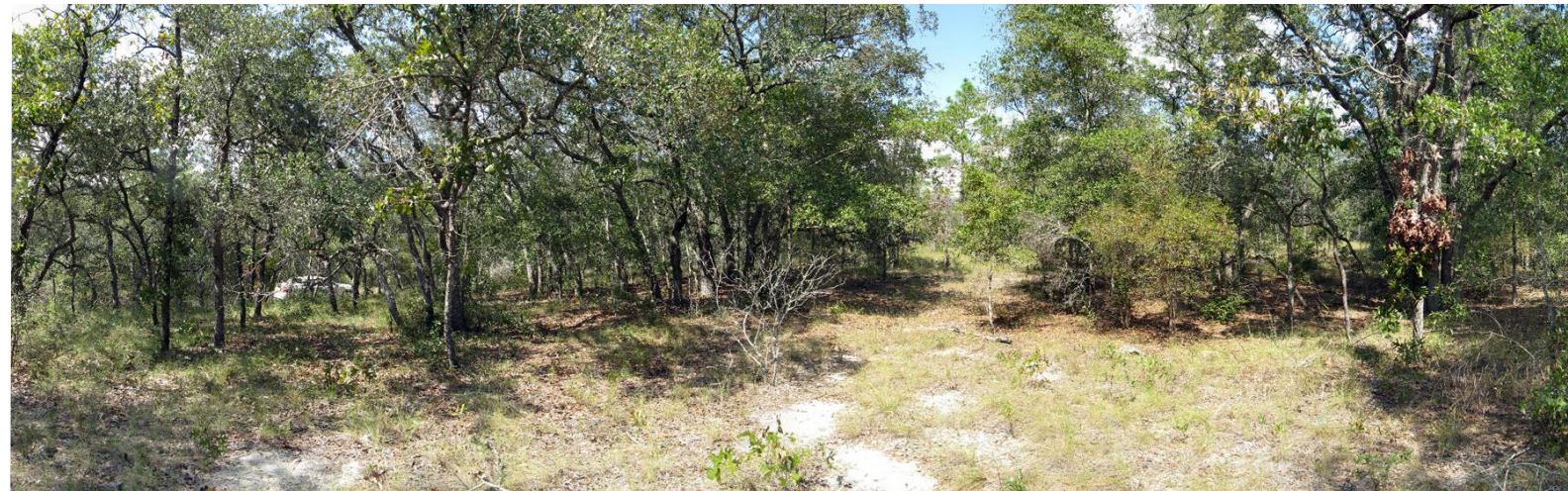
P6 – 2010 (10/20/2010)