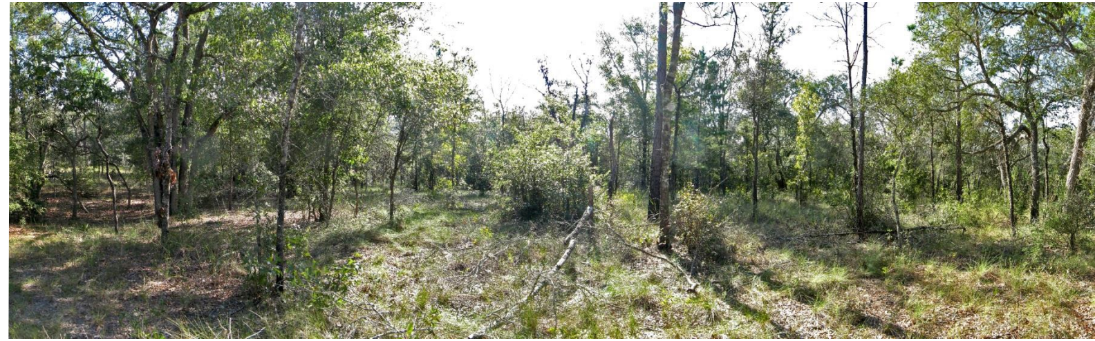
P6 – 2011 (10/13/2011)