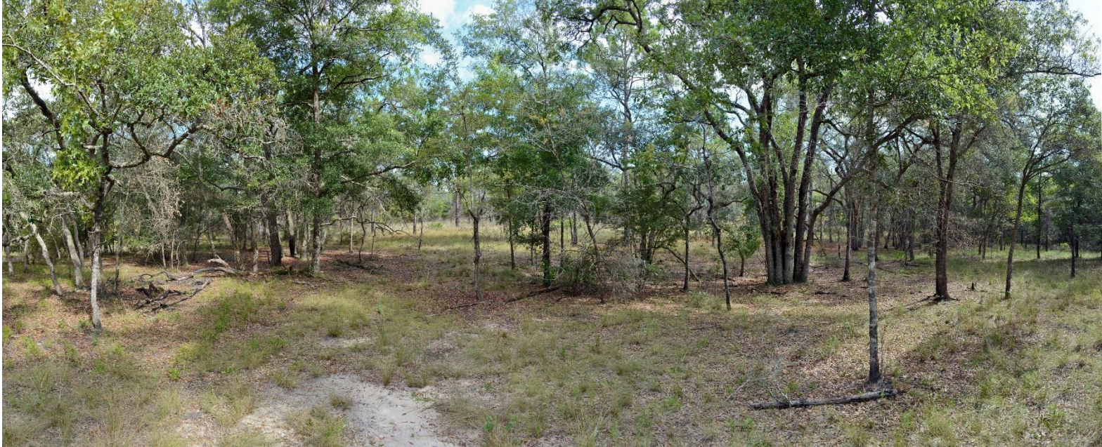
P6 – 2024 (9/4/2024)