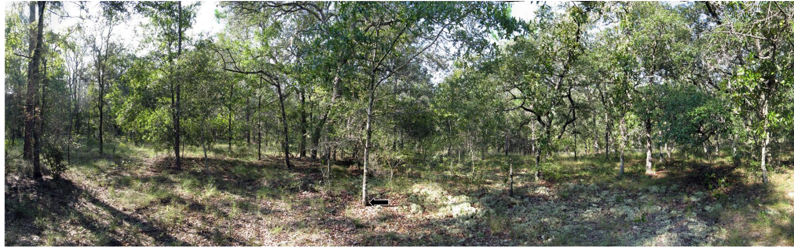
P6 – 2007 (11/02/2007)