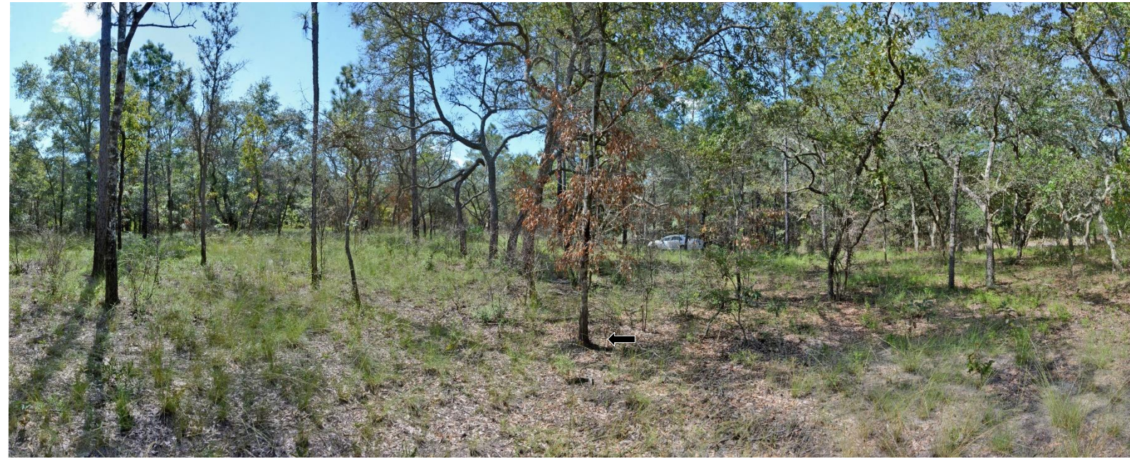
P6 – 2017 (10/19/2017)