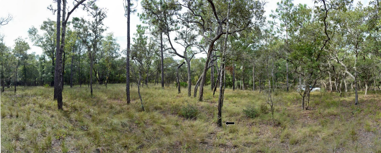
P6 – 2023 (9/26/2023)