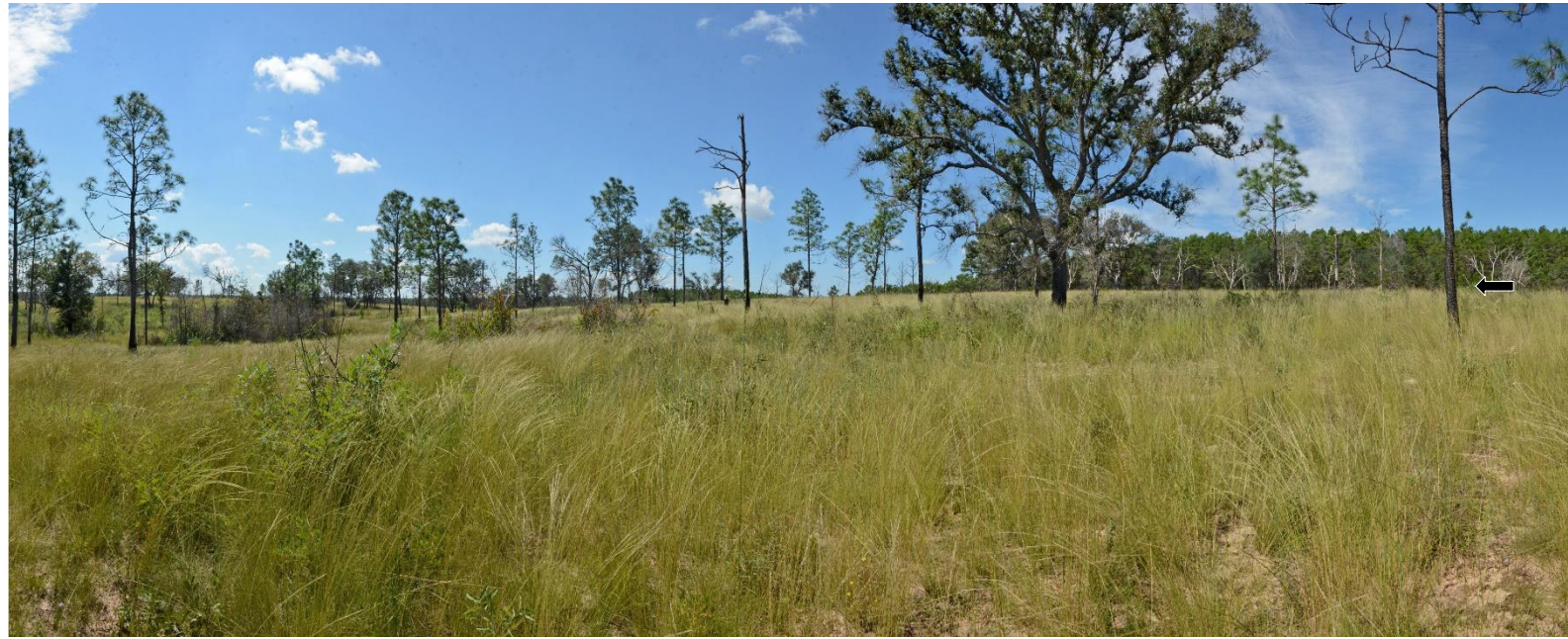
P7 – 2017 (10/19/2017)