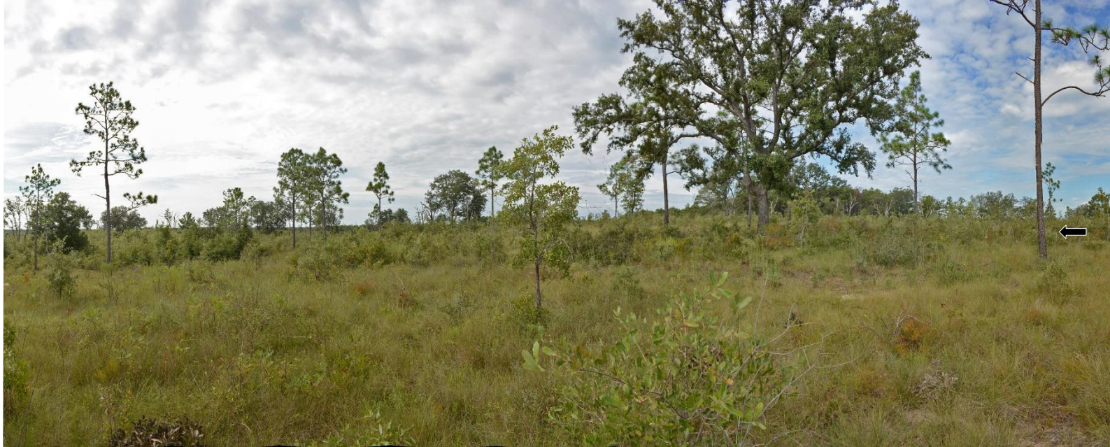
P7 – 2023 (9/26/2023)