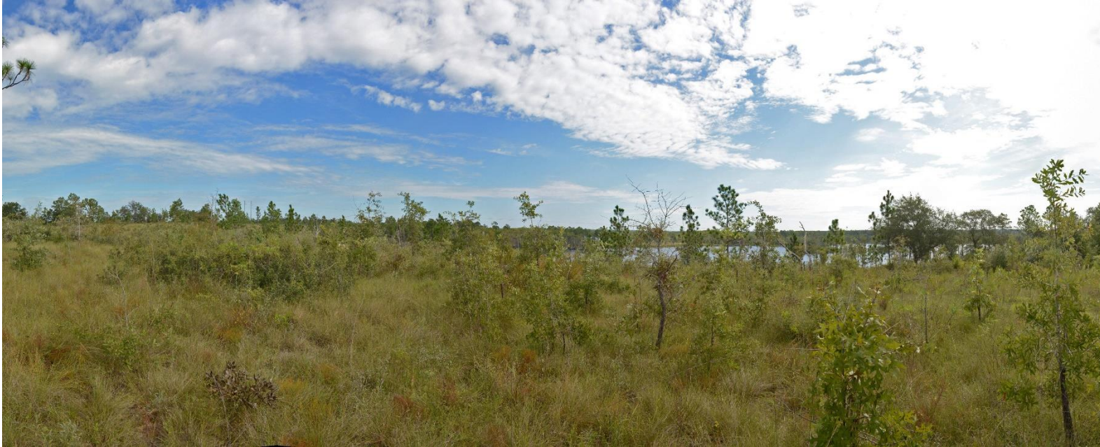
P7 – 2024 (9/4/2024)