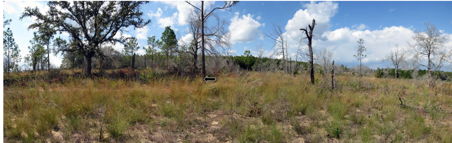
P7 – 2010 (10/20/2010)