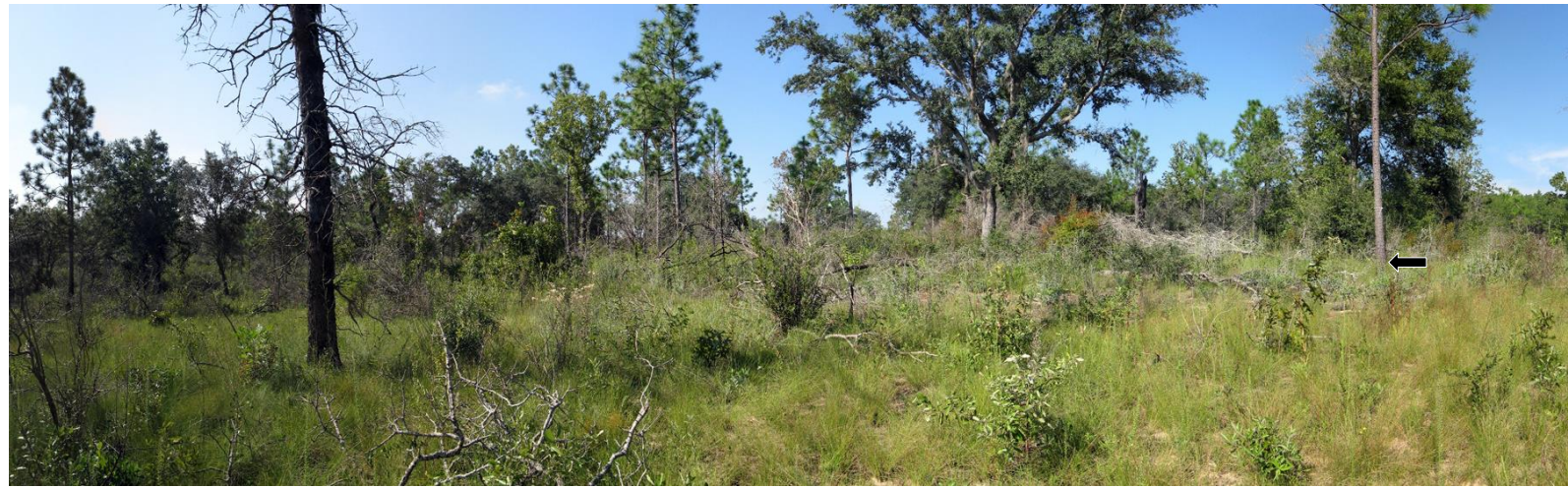
P7 – 2007 (11/02/2007)