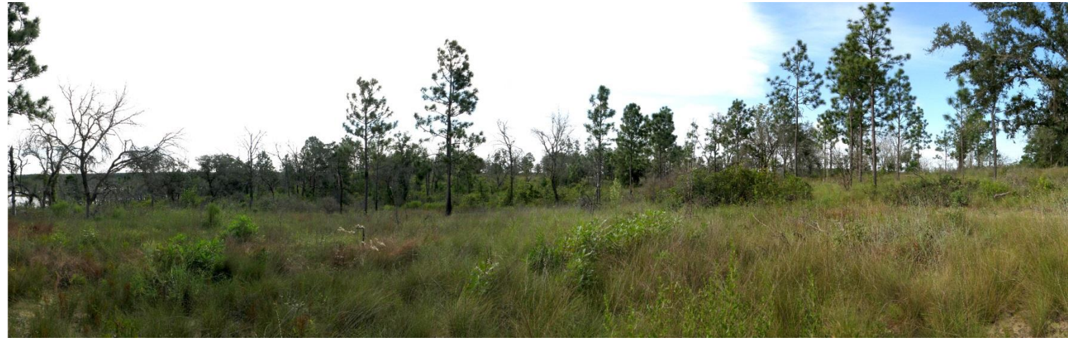
P7 – 2011 (10/13/2011)