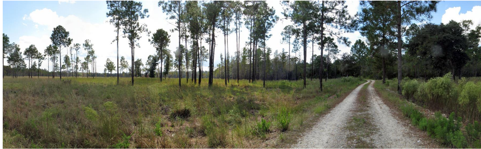
P8 – 2010 (10/20/2010)