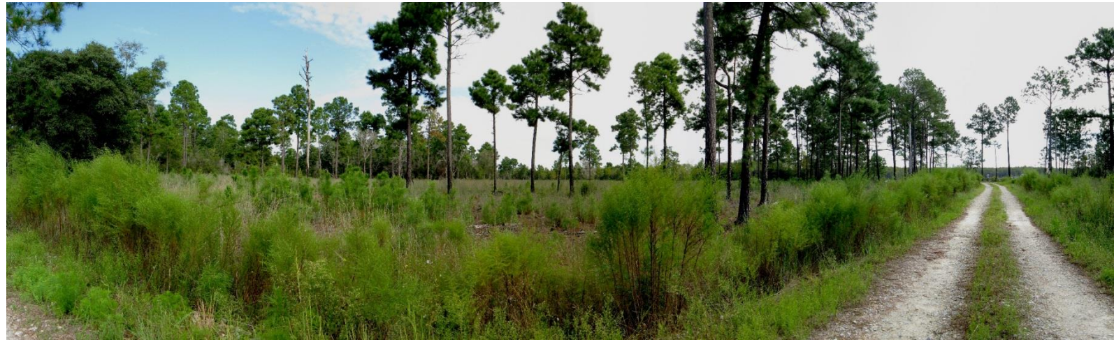
P8 – 2011 (10/13/2011)