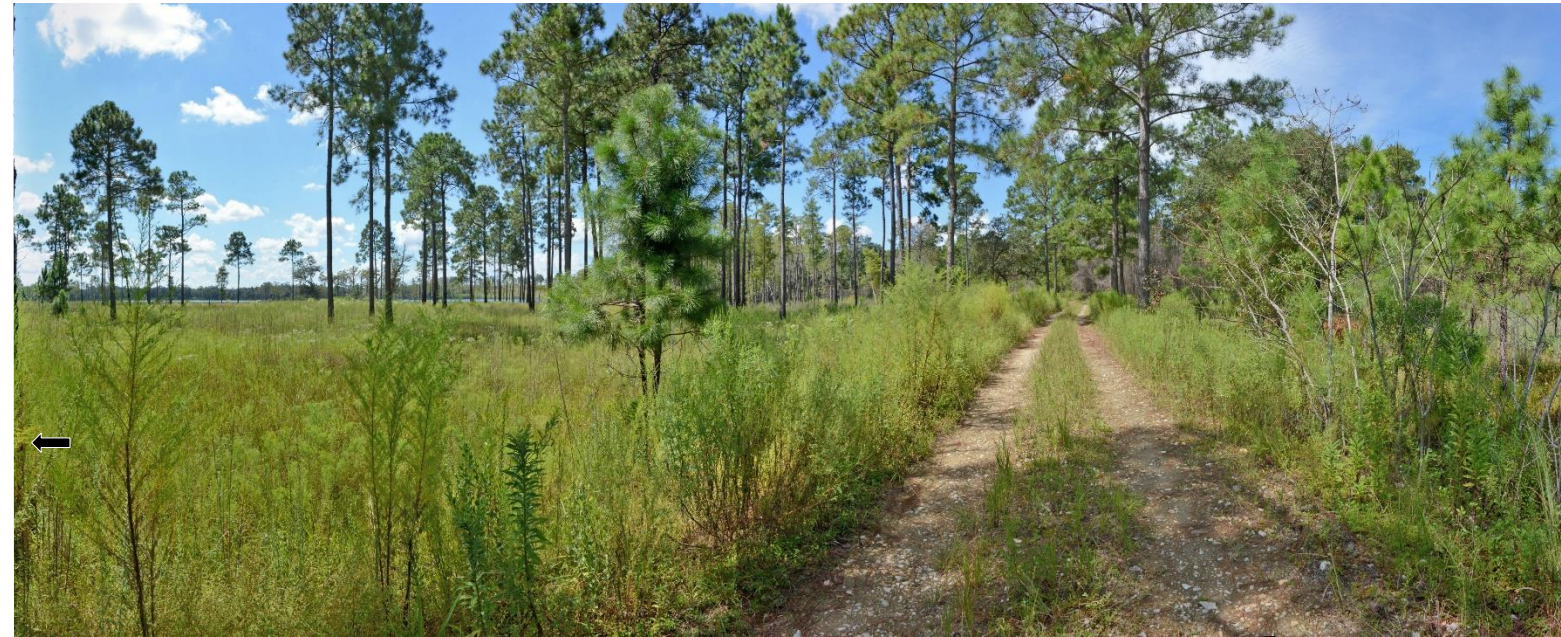
P8 – 2017 (10/19/2017)