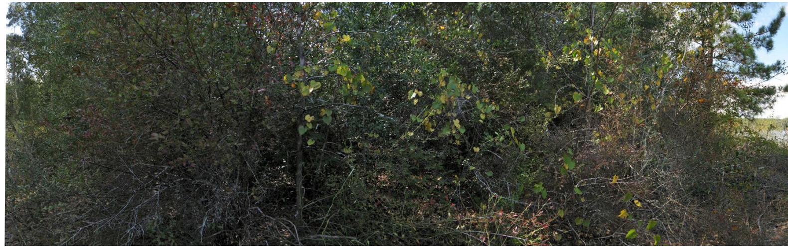
P9 – 2010 (10/20/2010)