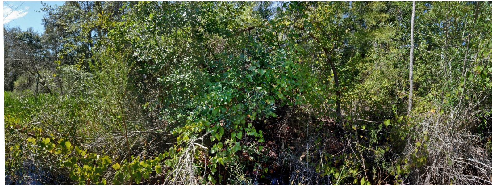
P9 – 2017 (10/19/2017)