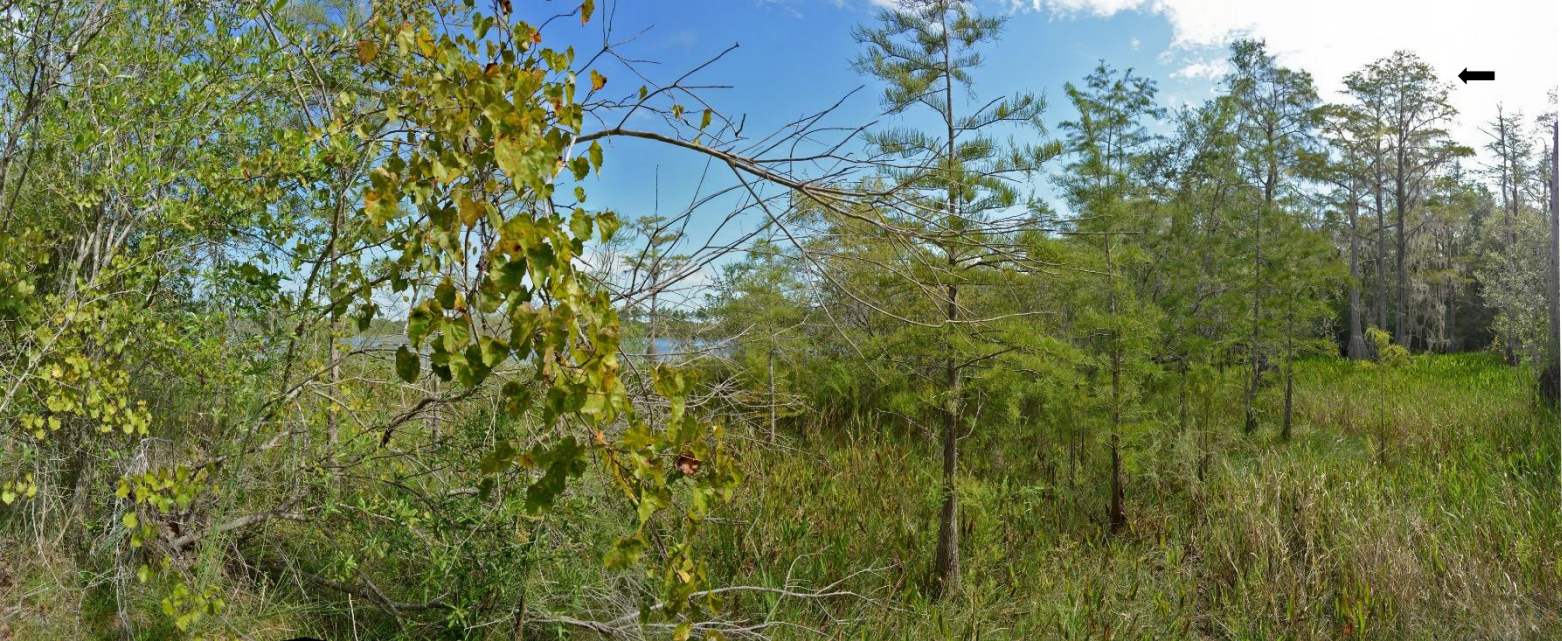
P9 – 2024 (9/4/2024)