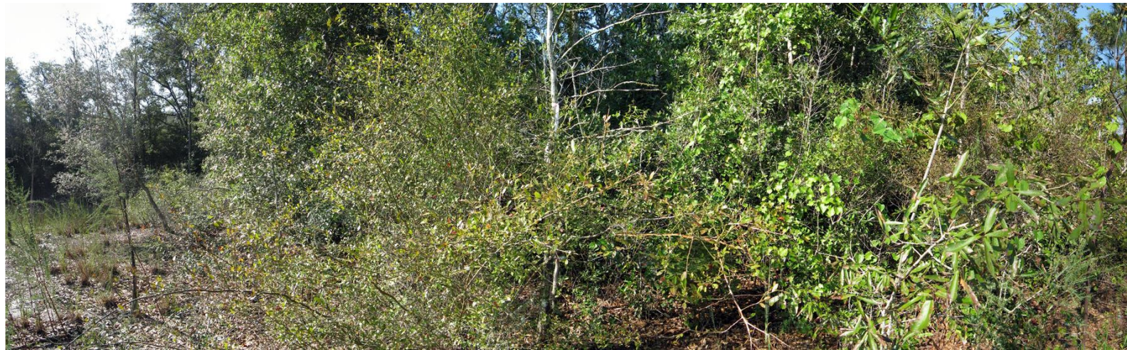
P9 – 2007 (11/02/2007)