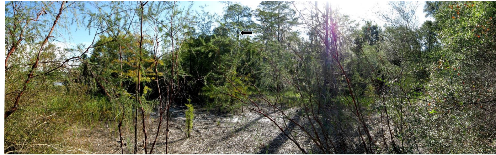
P9 – 2011 (10/13/2011)