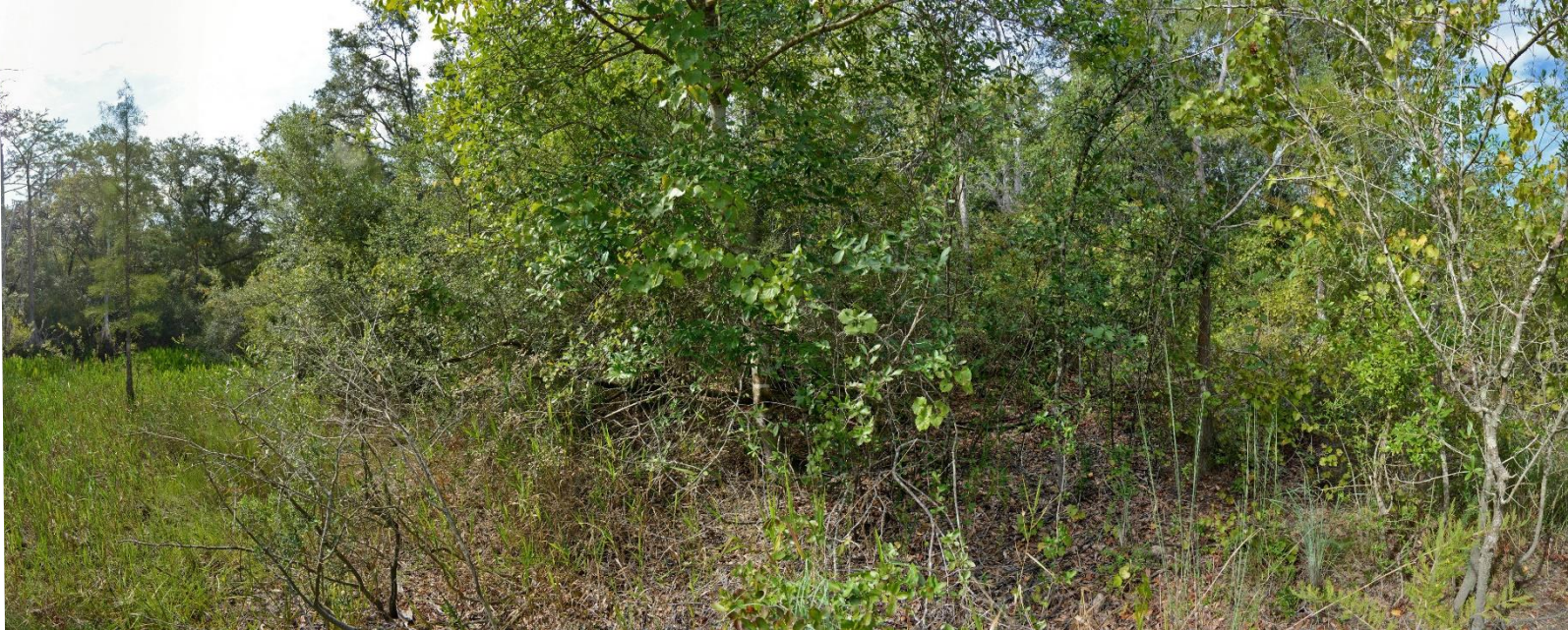
P9 – 2023 (9/26/2023)