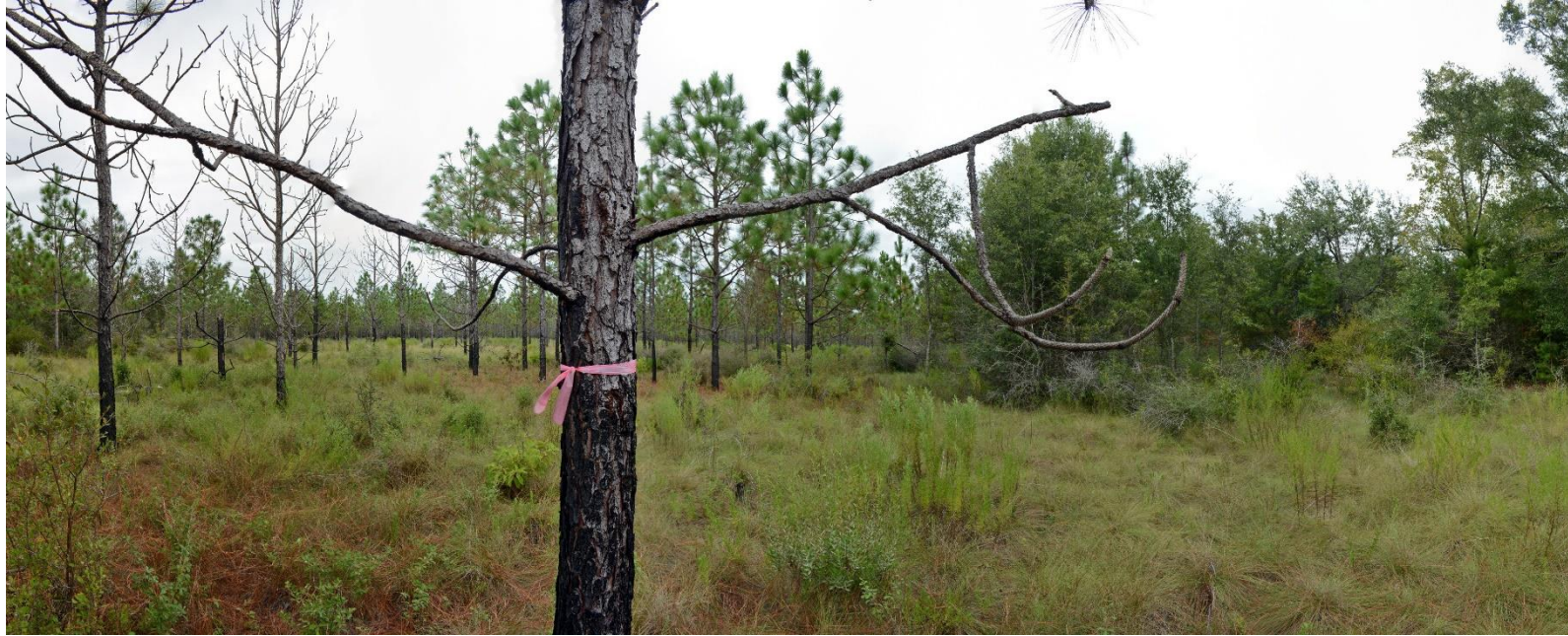
T1 – 2024 (9/4/2024)