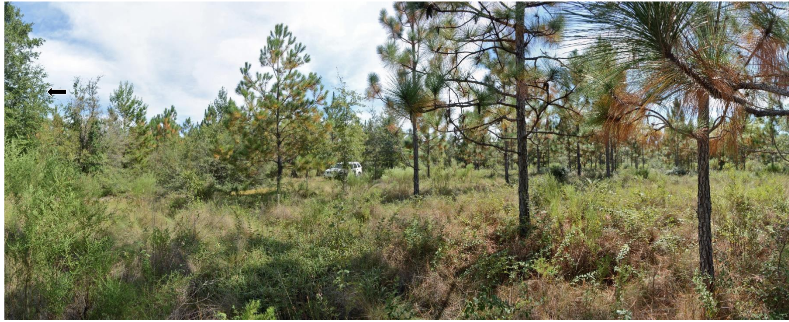
T1 – 2021 (9/9/2021) [Approximate Location – Marker Pipe Not Found]