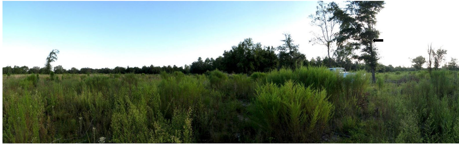
T1 – 2011 (10/13/2011)