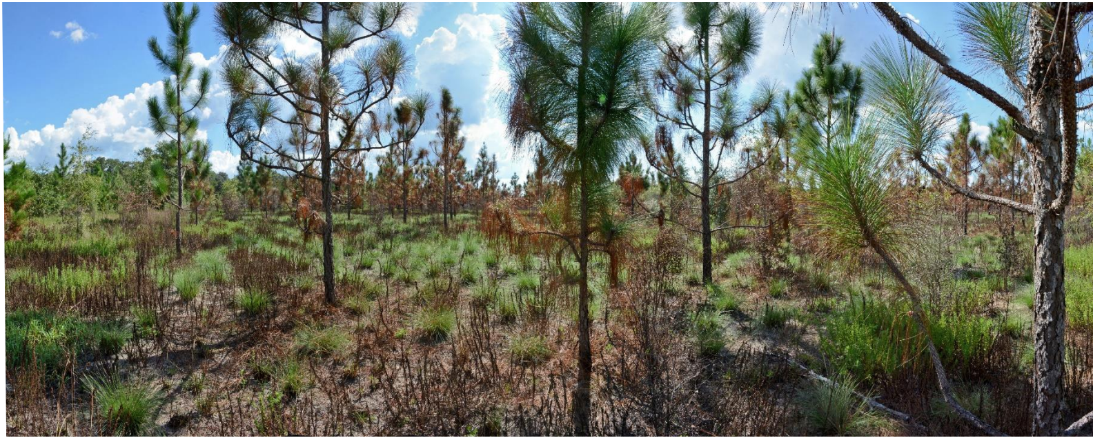
T1 – 2017 (10/19/2017)