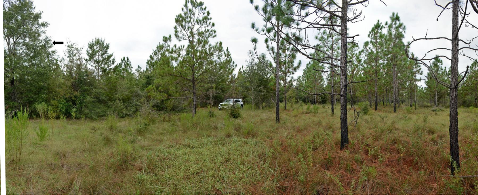
T1 – 2023 (9/26/2023)