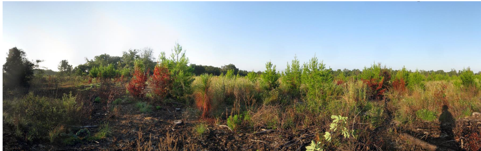
T1 – 2010 (10/20/2010)