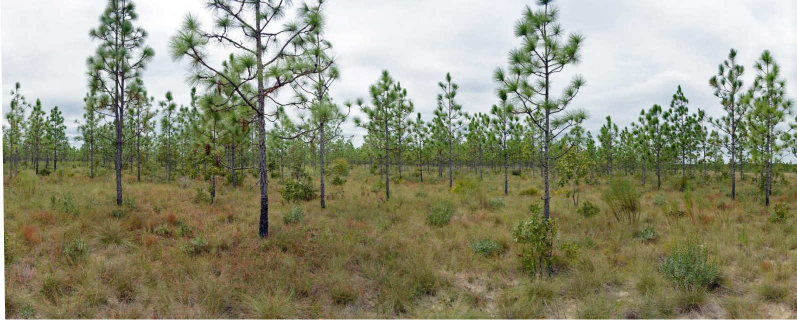
T2 – 2023 (9/26/2023)