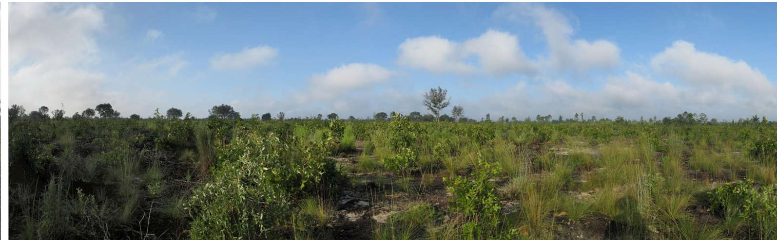
T2 – 2007 (11/01/2007)