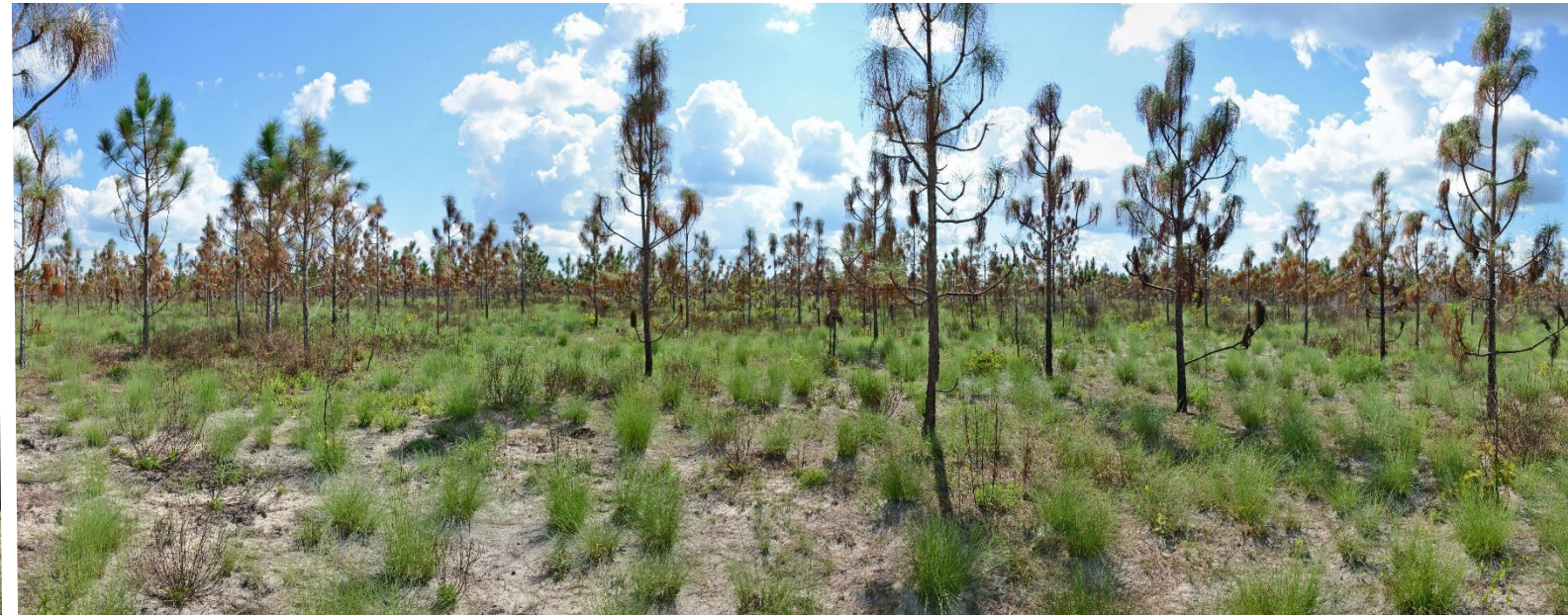
T2 – 2017 (10/19/2017)