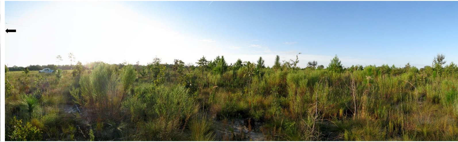
T2 – 2011 (10/13/2011)