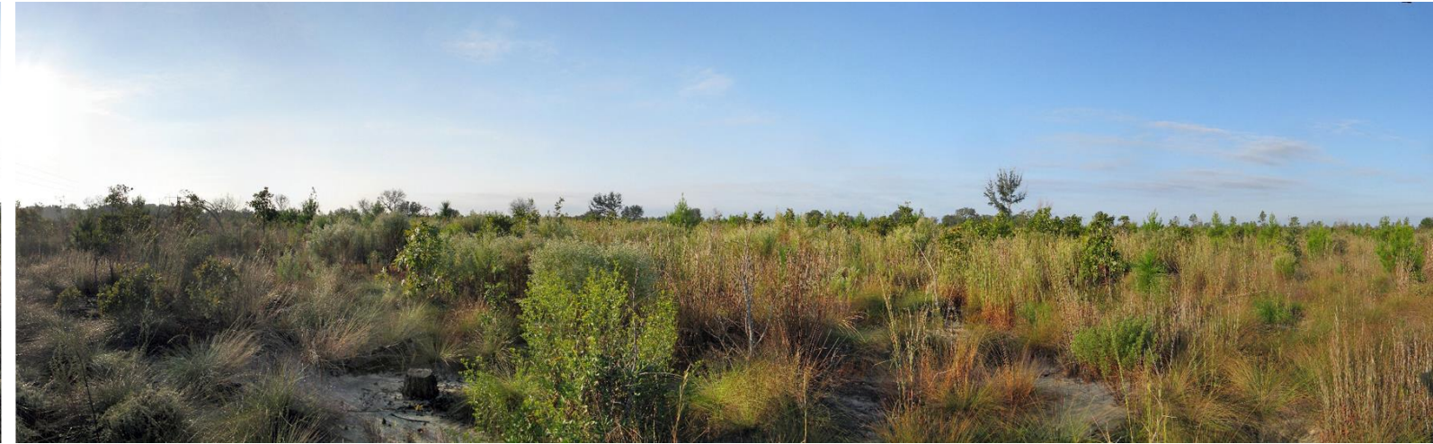
T2 – 2010 (10/20/2010)