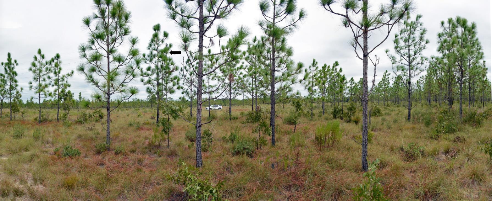
T2 – 2024 (9/4/2024)