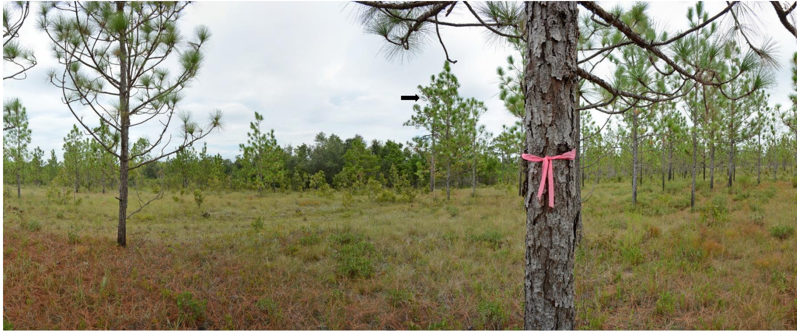
T3 – 2024 (9/4/2024)