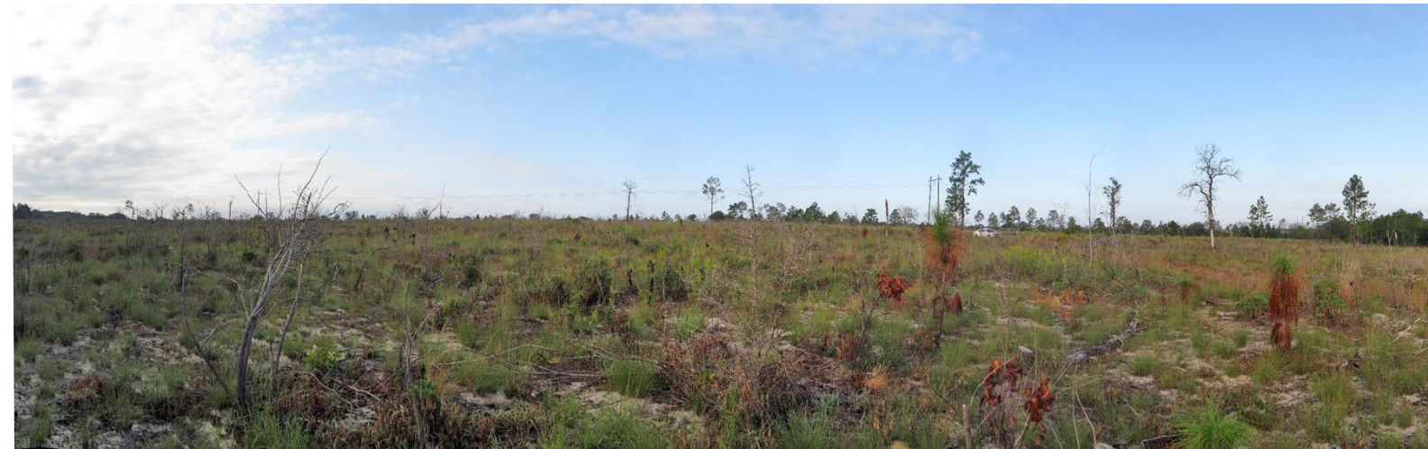
T3 – 2010 (10/20/2010)