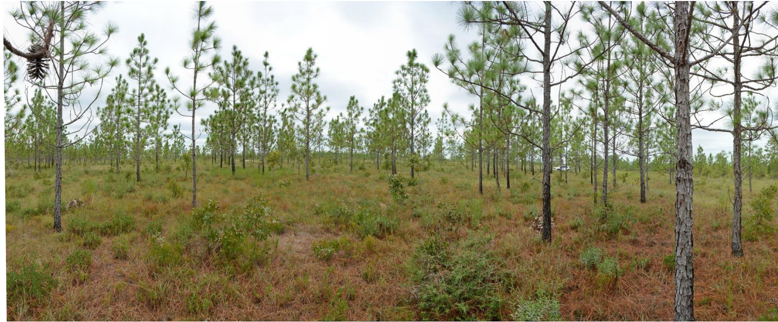
T3 – 2023 (9/26/2023)