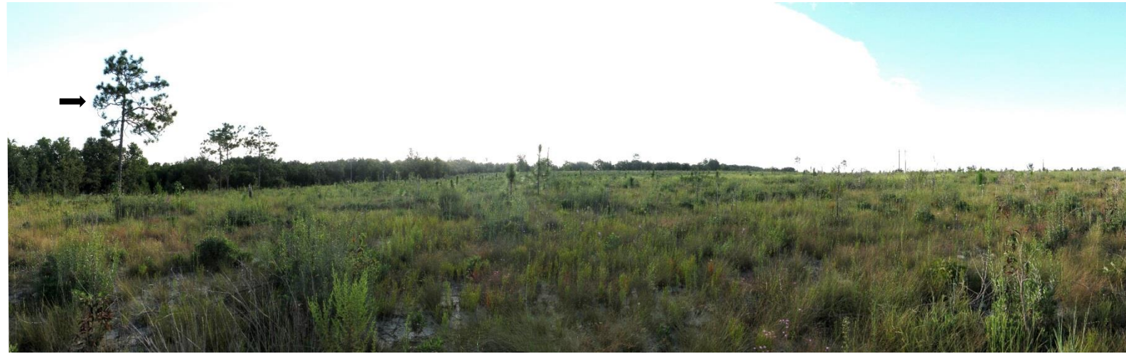
T3 – 2011 (10/13/2011)