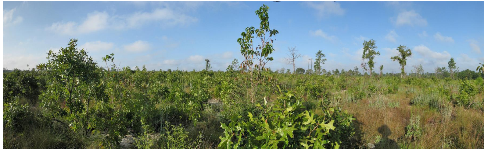
T3 – 2007 (11/01/2007)