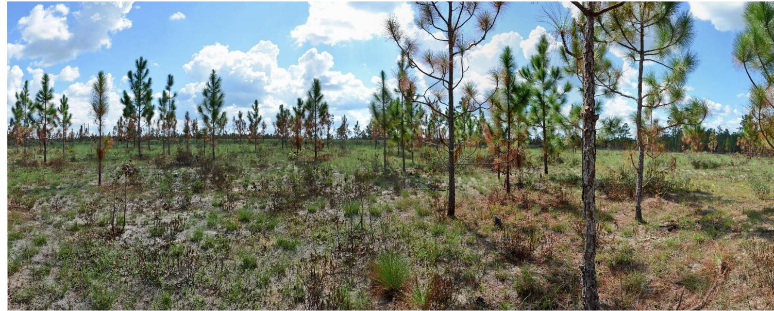
T3 – 2017 (10/19/2017)