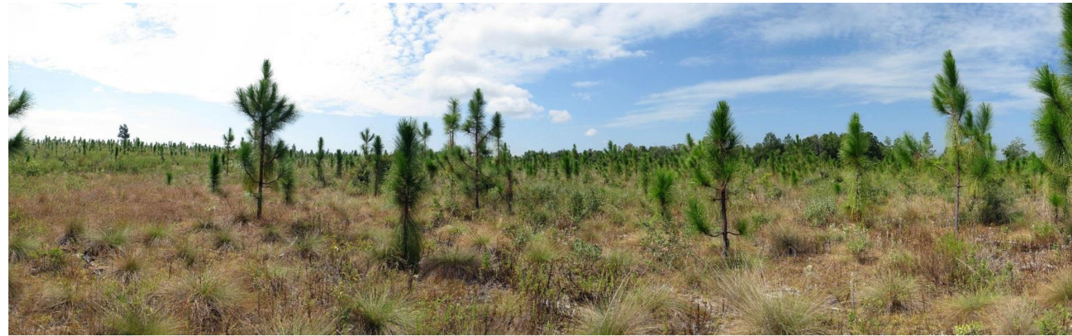
T4 – 2014 (9/26/2014)