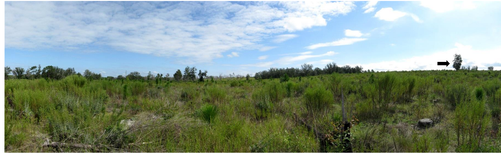
T4 – 2011 (10/13/2011)