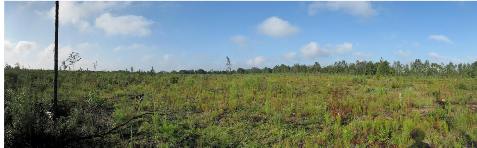
T4 – 2007 (11/01/2007)