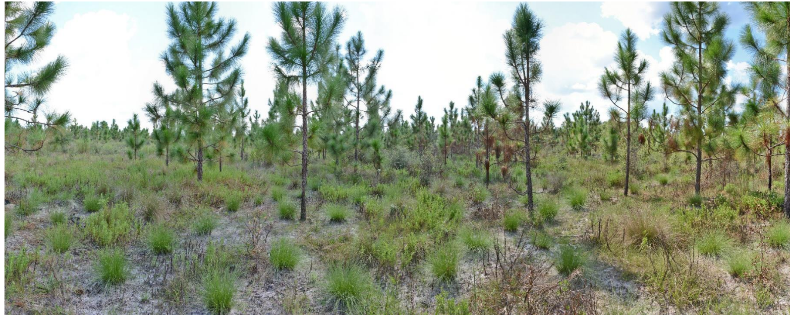
T4 – 2017 (10/19/2017)