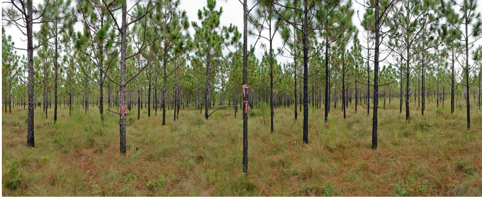
T4 – 2024 (9/4/2024)