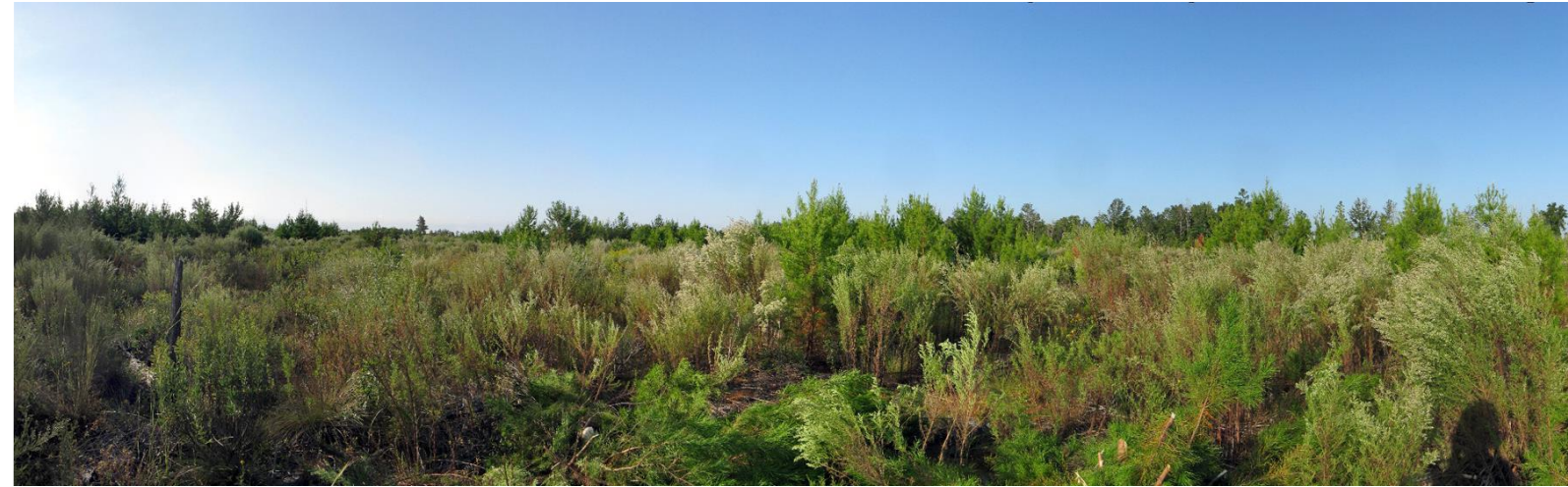
T4 – 2010 (10/20/2010)