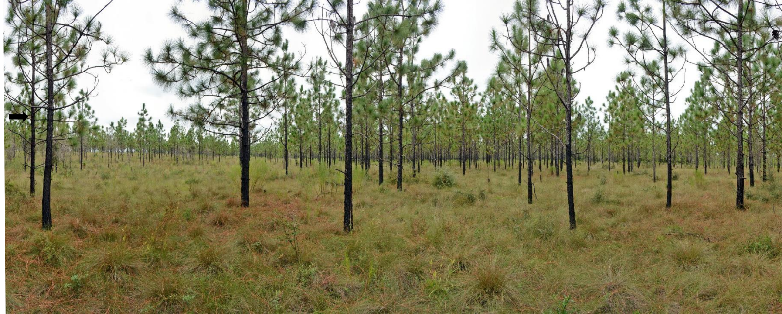
T4 – 2023 (9/26/2023)