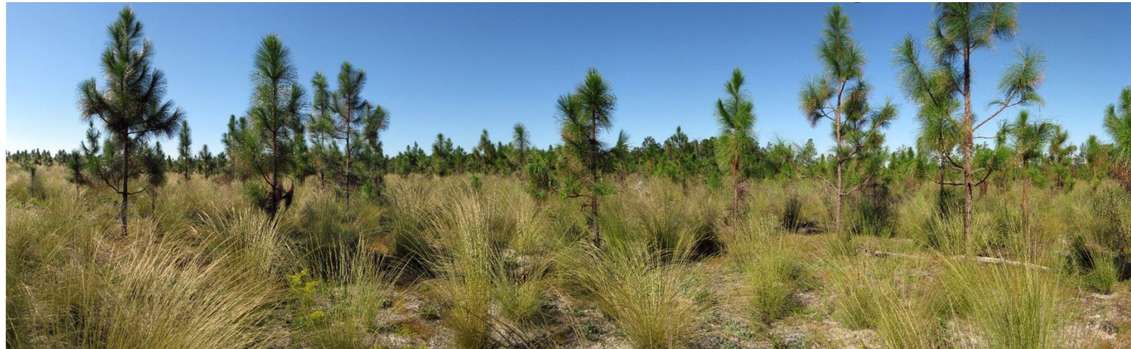
T4 – 2015 (9/23/2015)