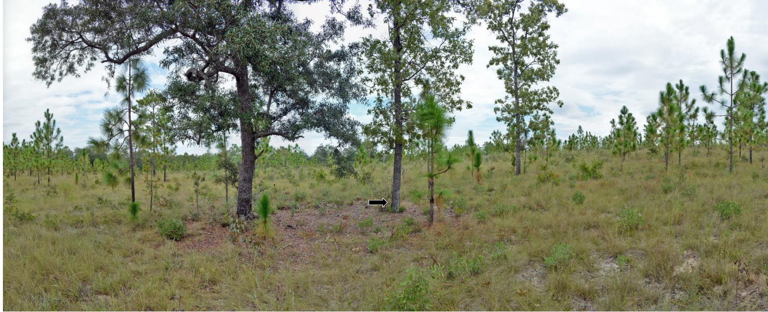
T5 – 2024 (9/4/2024)