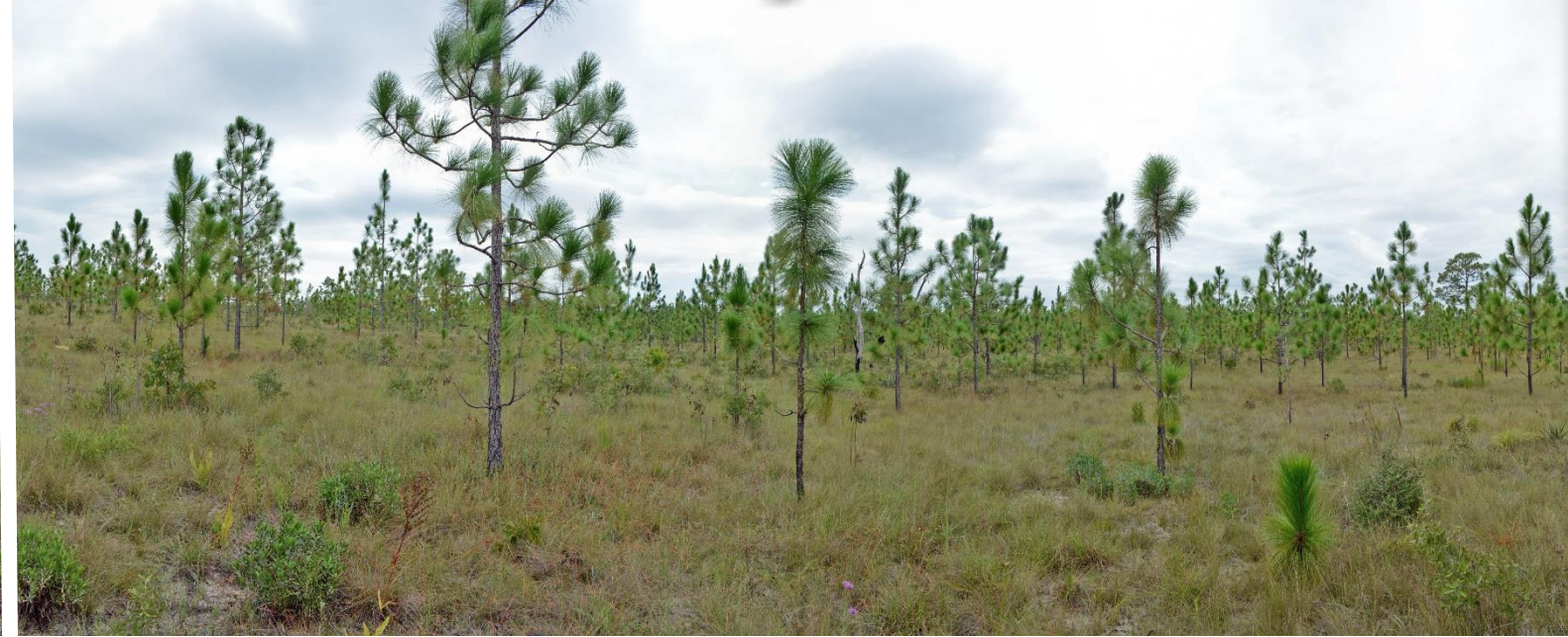
T5 – 2023 (9/26/2023)