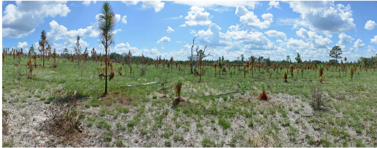
T5 – 2017 (10/19/2017)