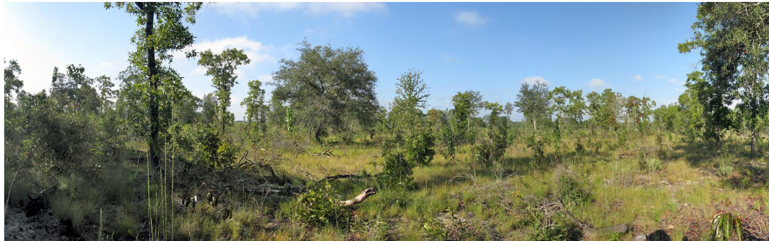
T5 – 2007 (11/01/2007)