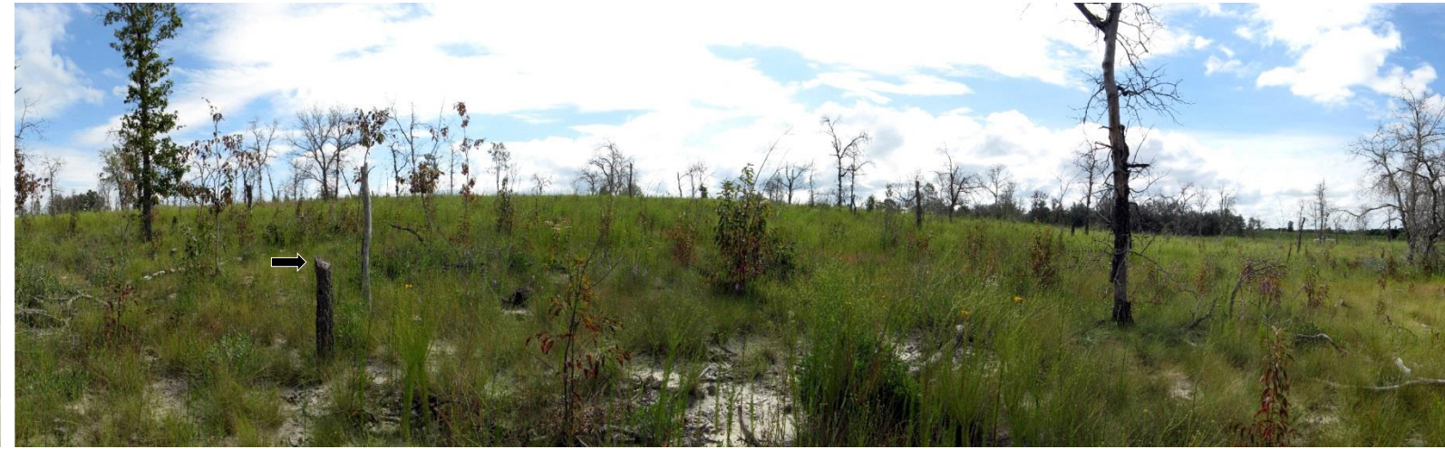
T5 – 2011 (10/13/2011)