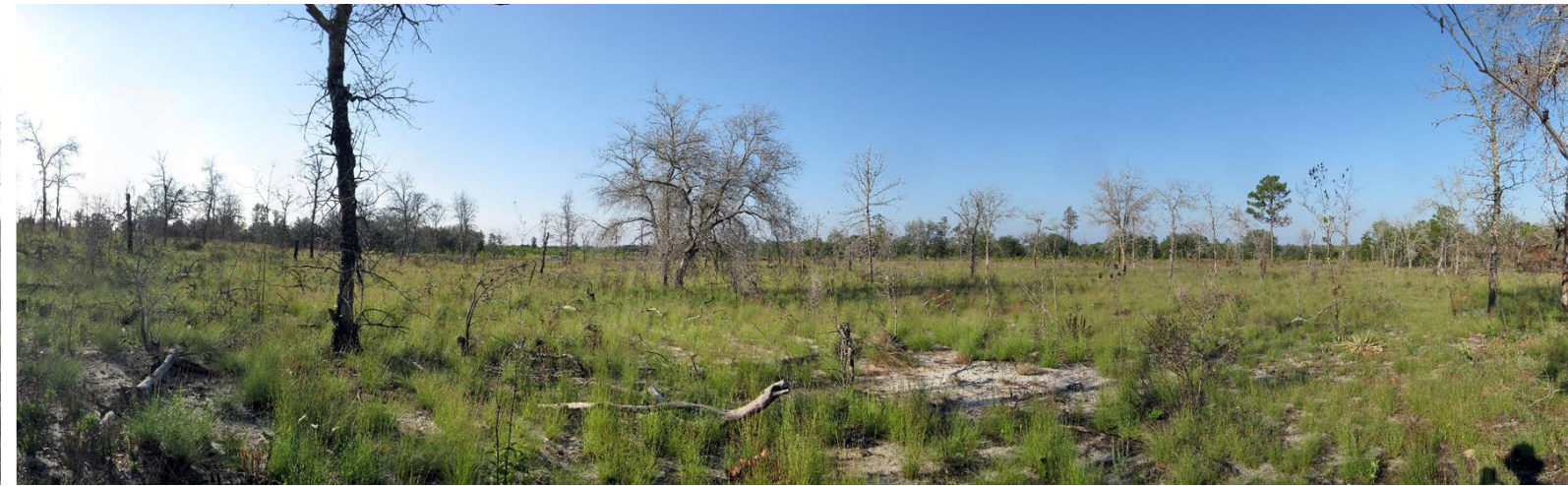
T5 – 2010 (10/20/2010)