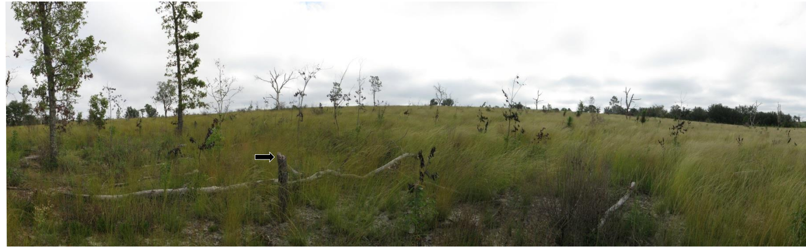
T5 – 2013 (9/5/2013)