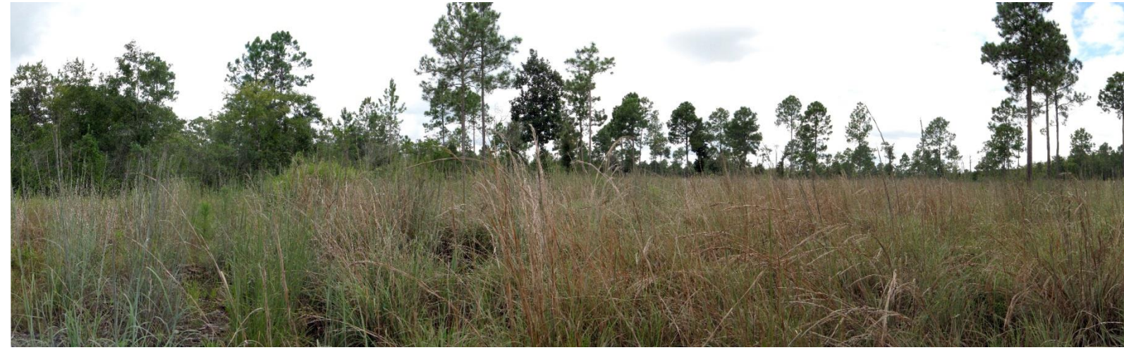
T6 – 2011 (10/13/2011)