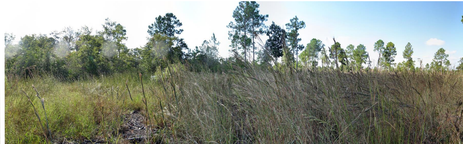
T6 – 2010 (10/20/2010)