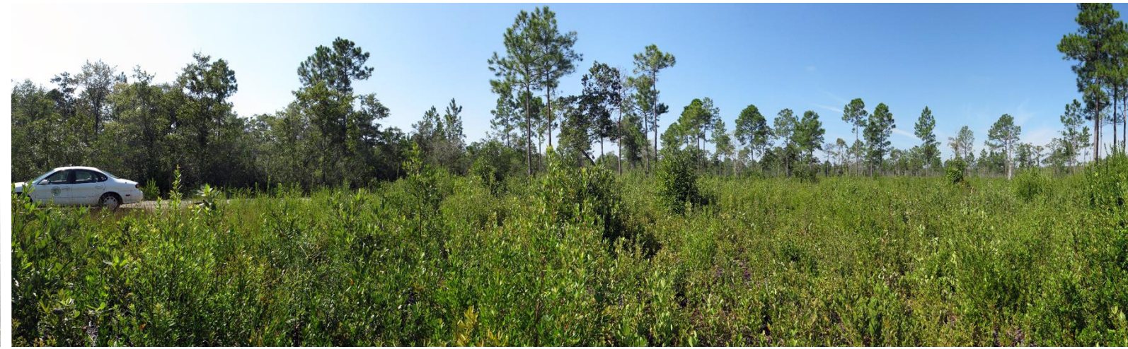
T6 – 2007 (11/02/2007)