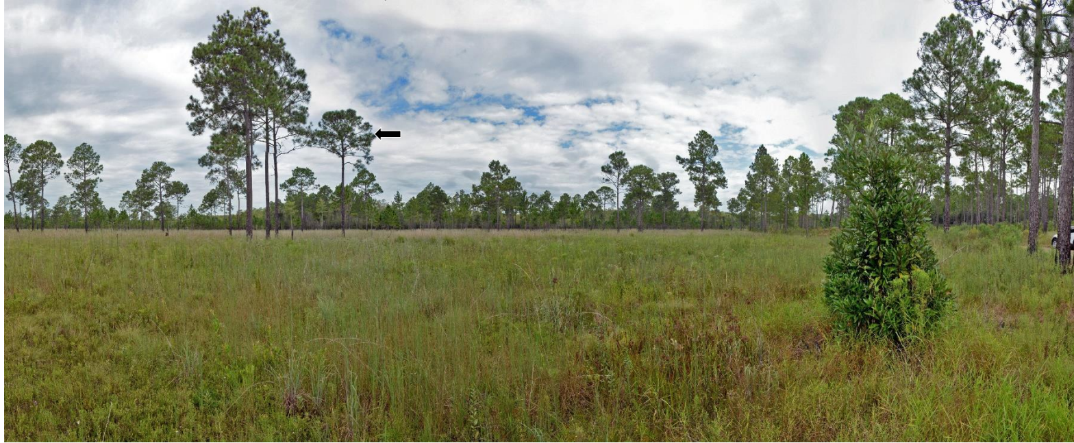
T6 – 2024 (9/4/2024)