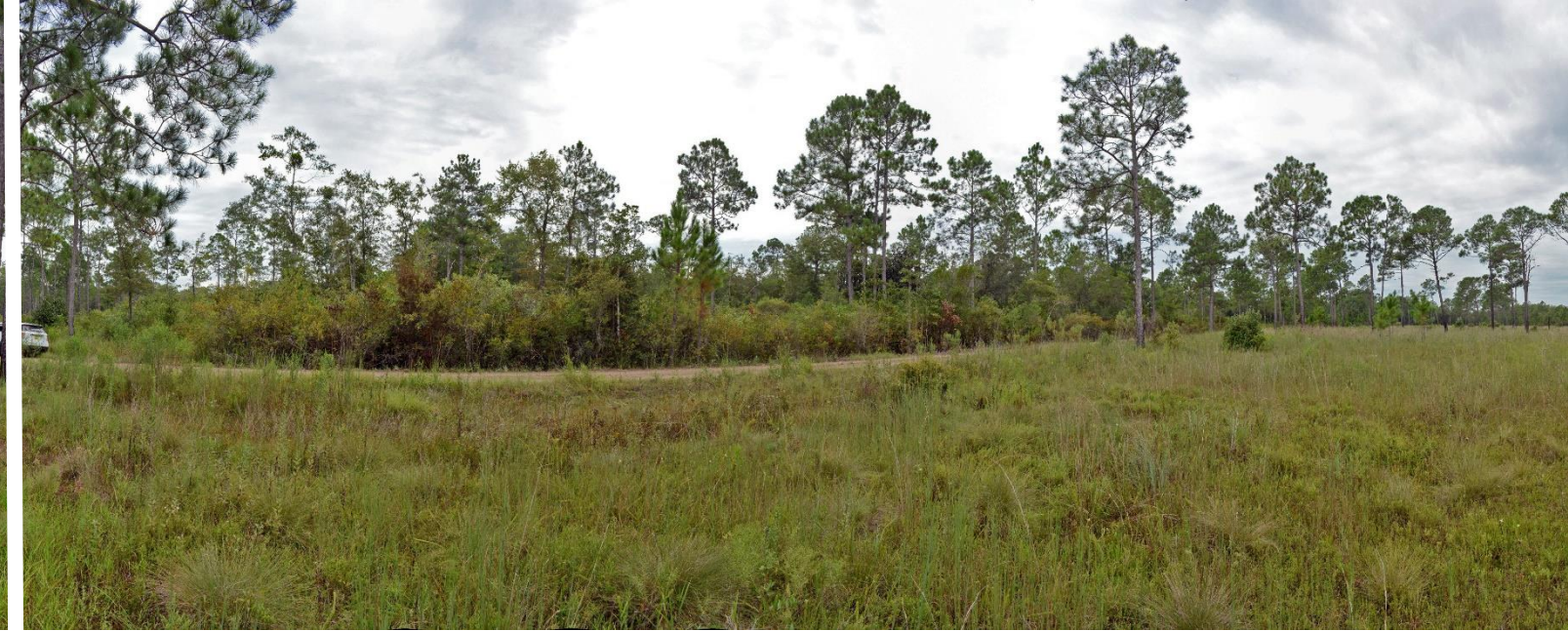
T6 – 2023 (9/26/2023)