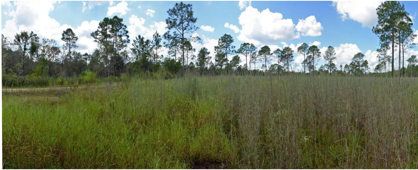
T6 – 2017 (10/19/2017)