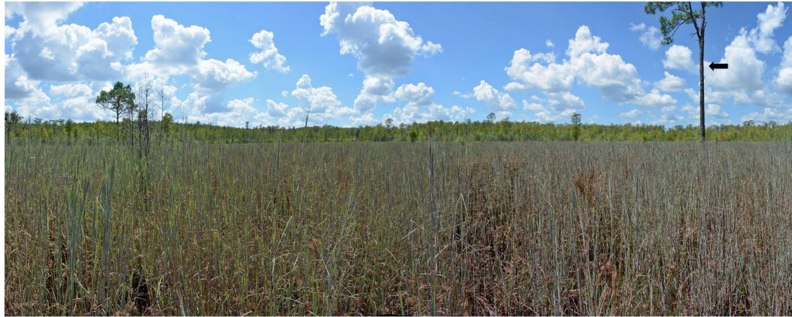
T7 – 2017 (10/19/2017)