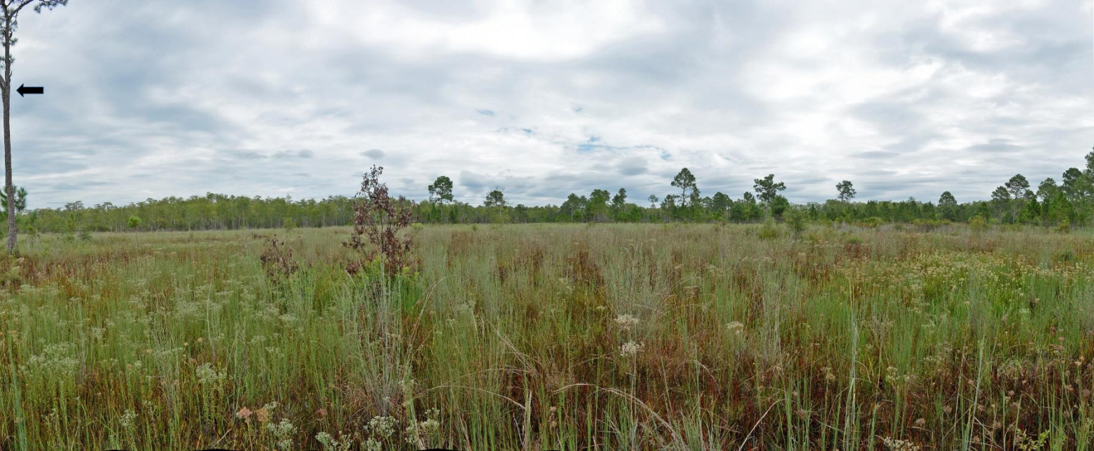
T7 – 2024 (9/4/2024)