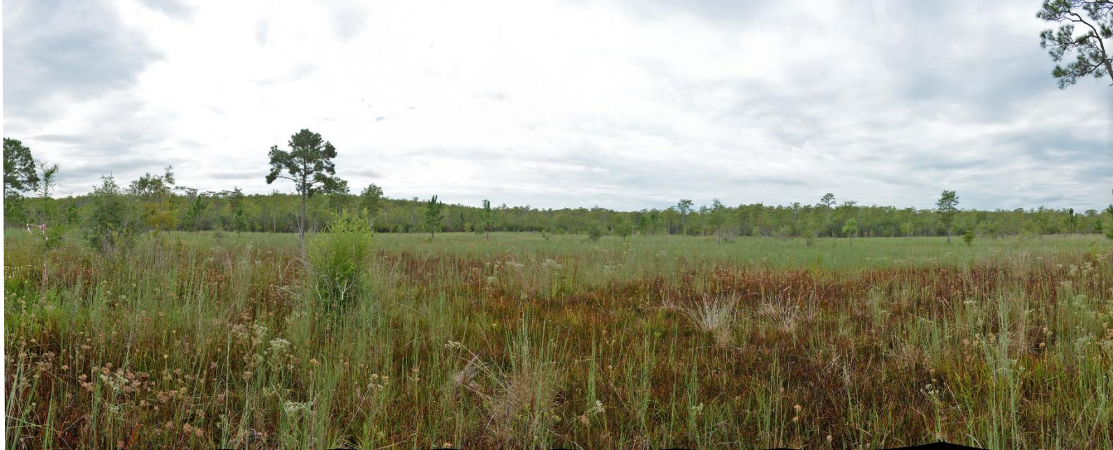
T7 – 2023 (9/26/2023)