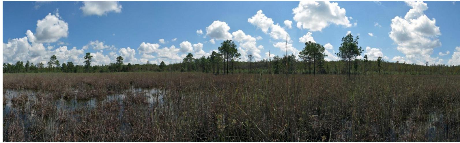
T7 – 2012 (9/14/2012)