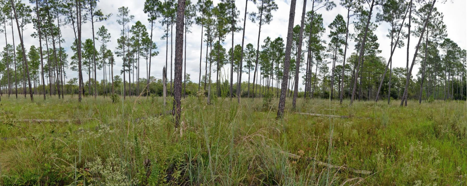
T8 – 2024 (9/4/2024)