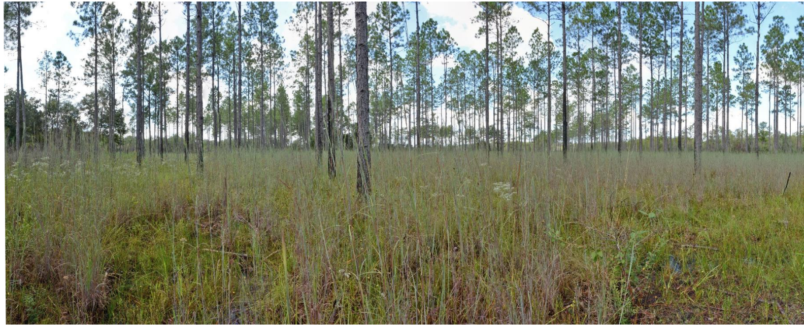
T8 – 2017 (10/19/2017)