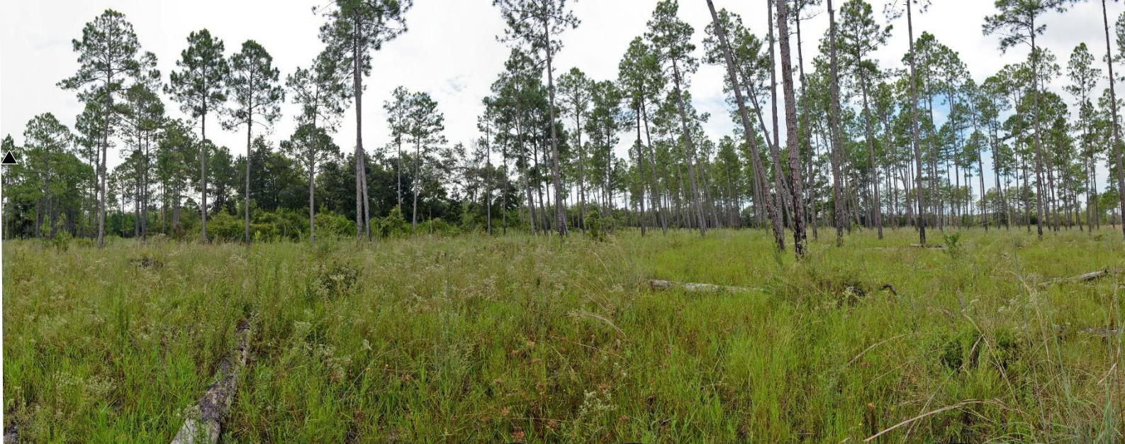
T8 – 2023 (9/26/2023)