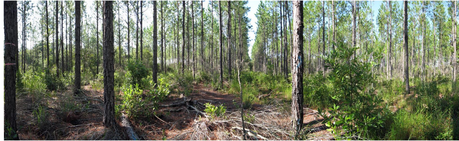
T8 – 2007 (11/01/2007)