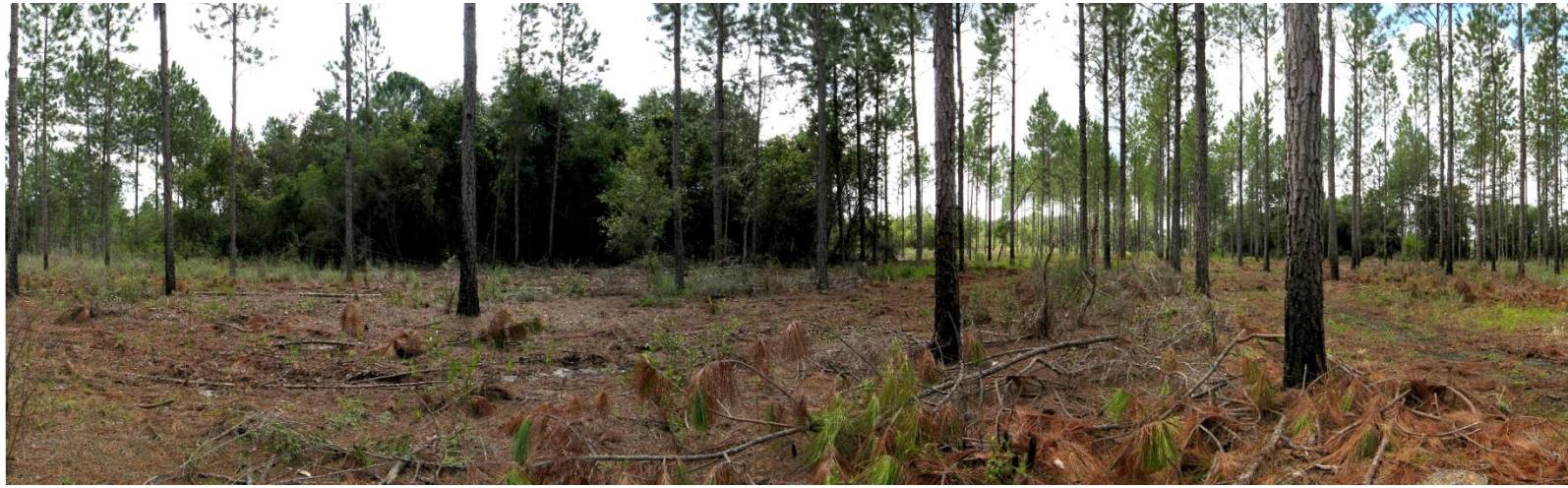
T8 – 2011 (10/13/2011)