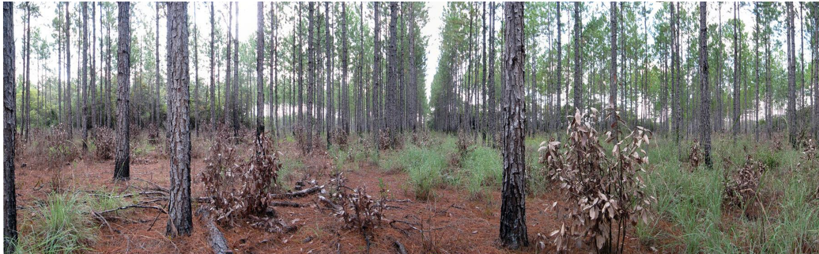
T8 – 2010 (10/20/2010)