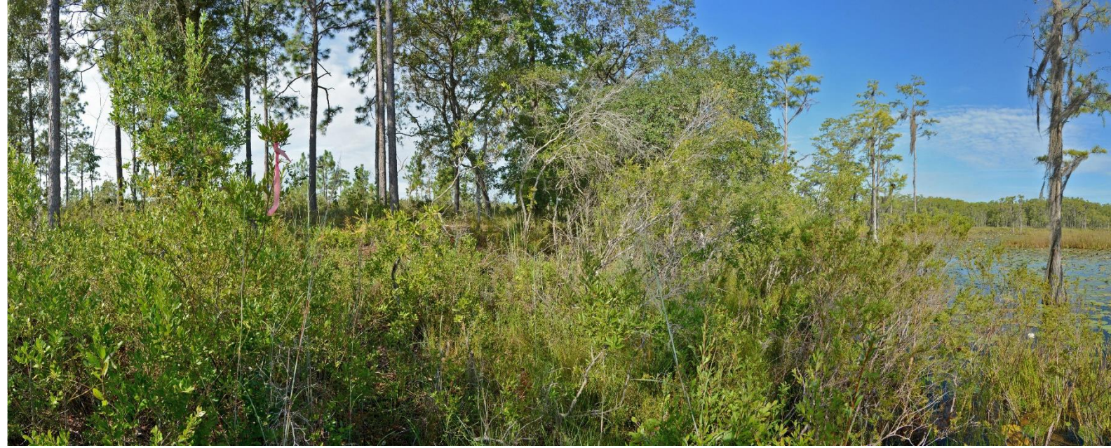
T9 – 2023 (9/26/2023)