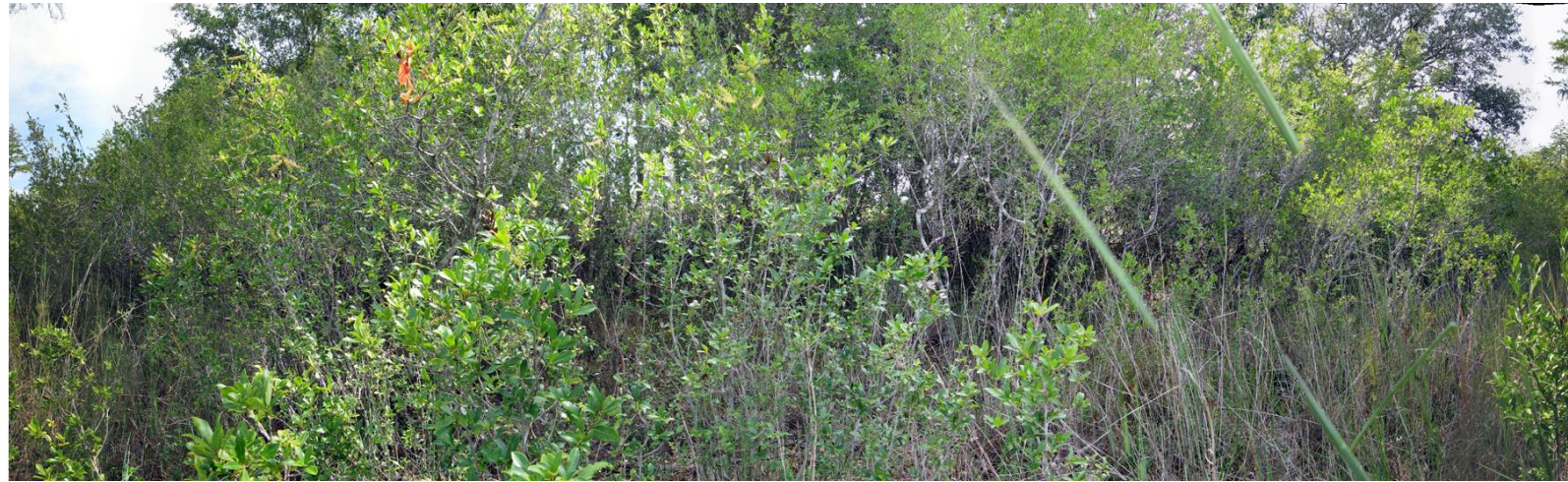
T9 – 2007 (11/01/2007)