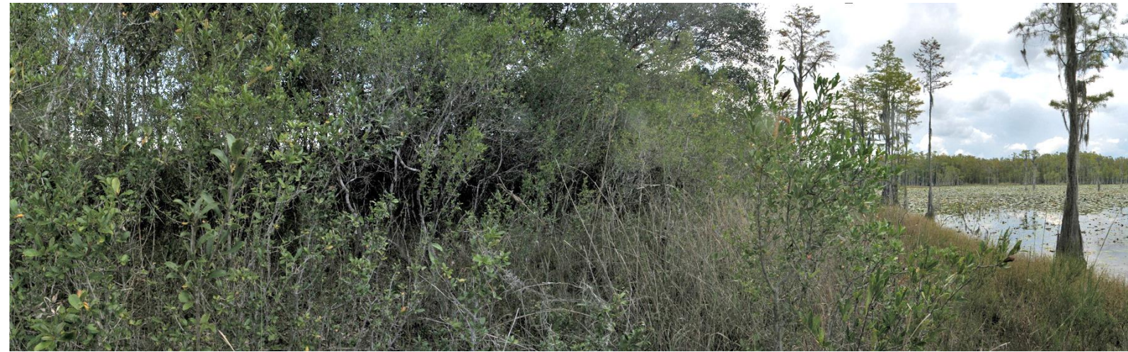
T9 – 2010 (10/20/2010)