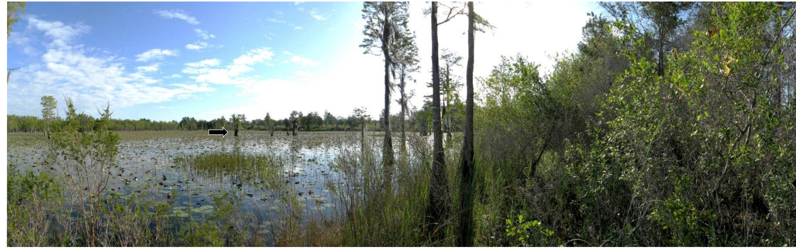
T9 – 2011 (10/13/2011)