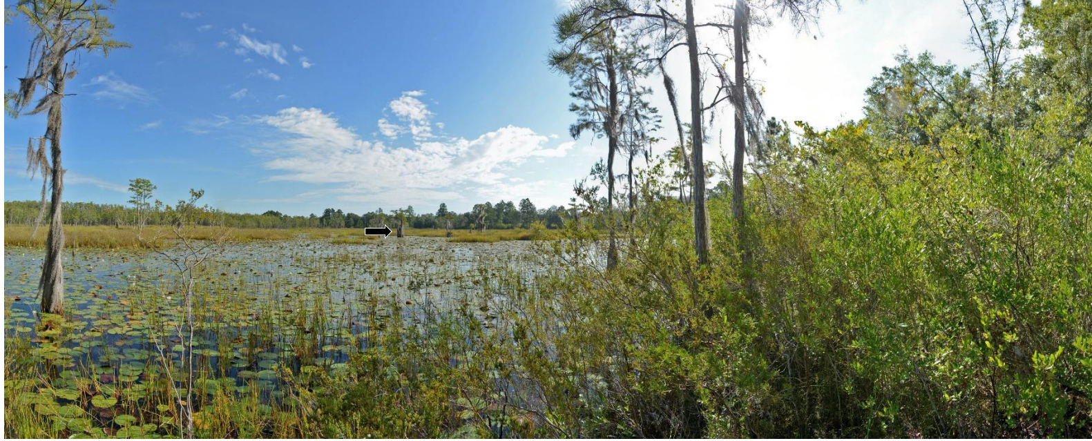
T9 – 2024 (9/4/2024)