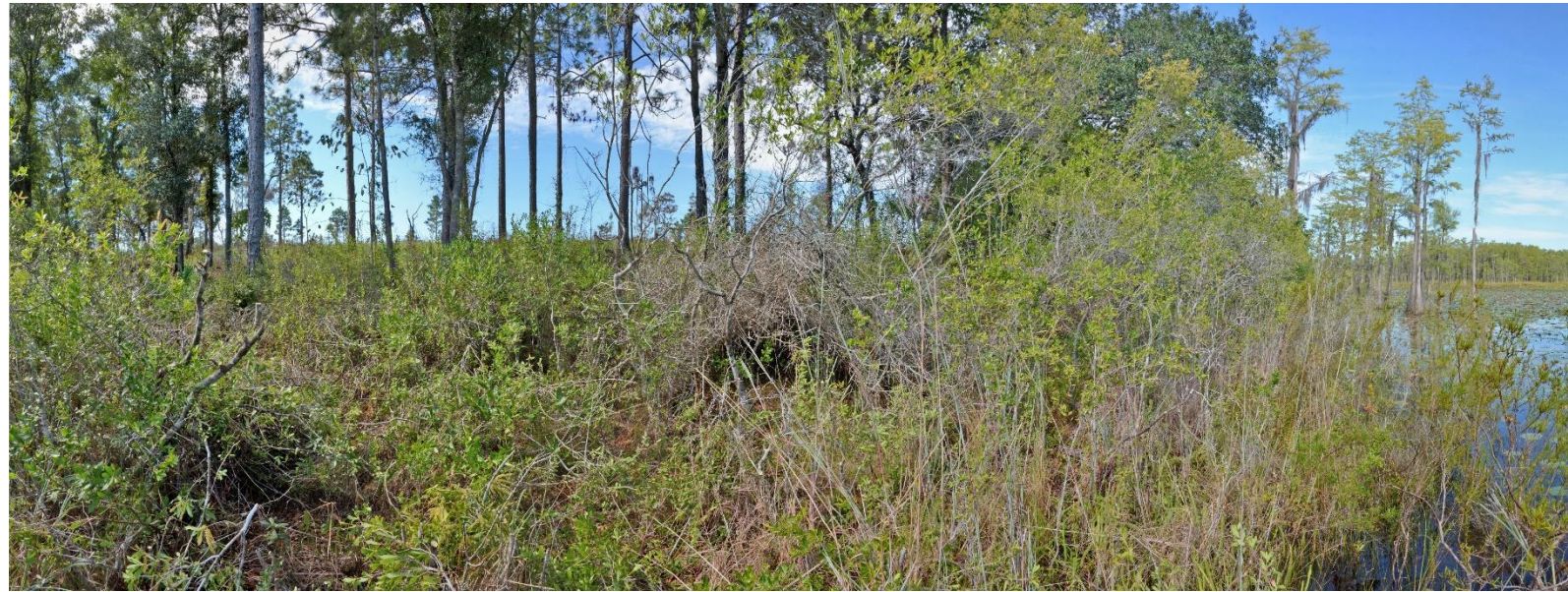
T9 – 2017 (10/19/2017)