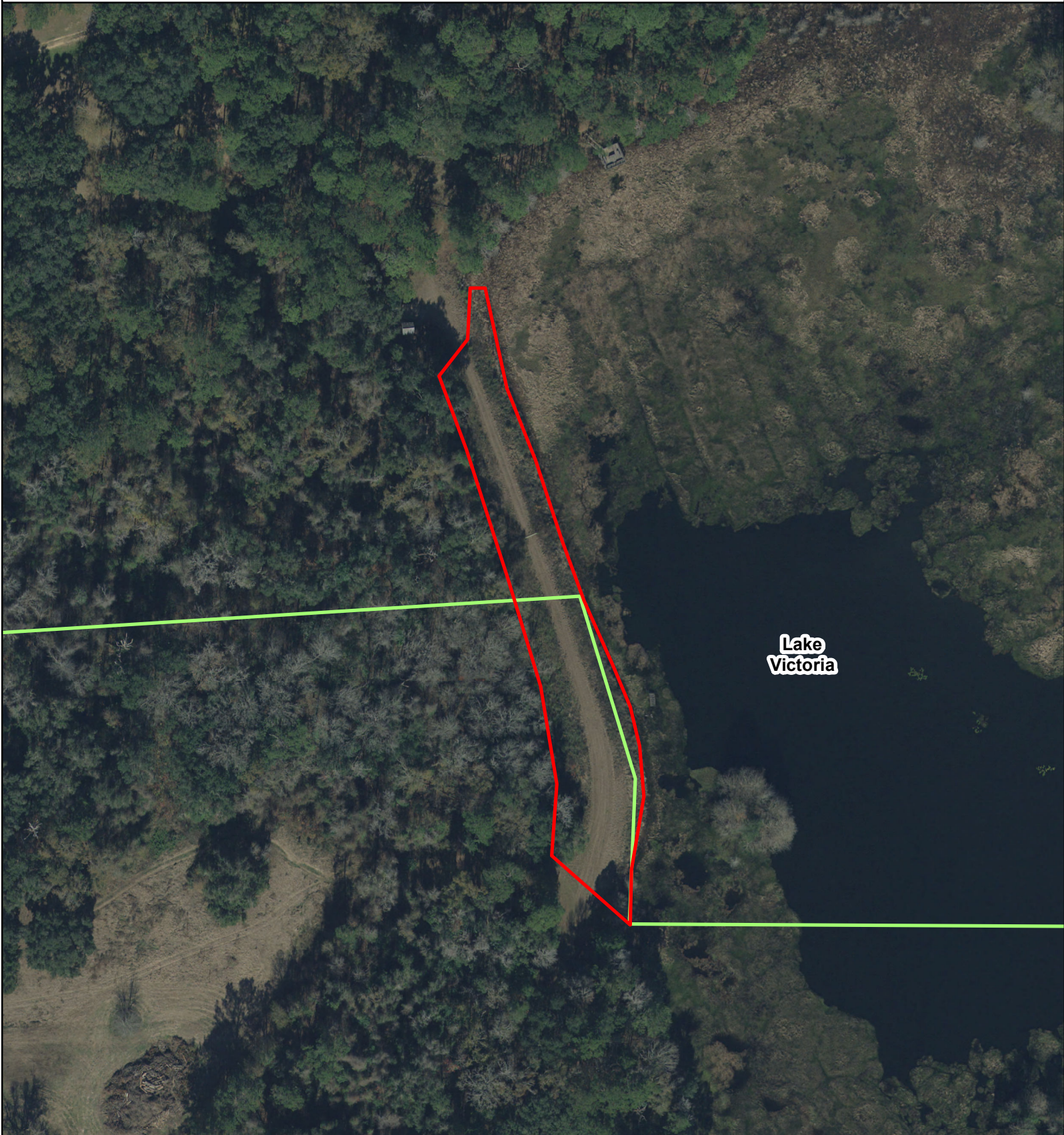
Exhibit Map 7