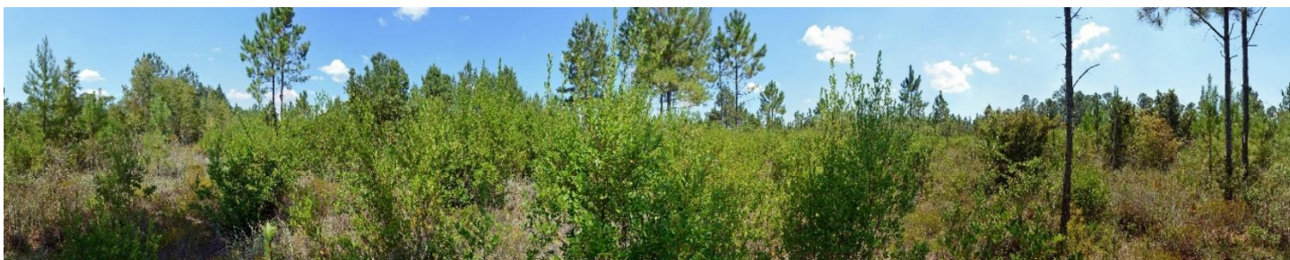
Perdido II Photo Point No. 2 – 9/17/2025