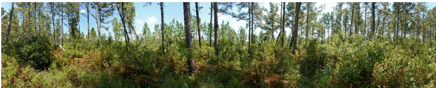
Perdido II Photo Point No. 3 – 9/17/2025