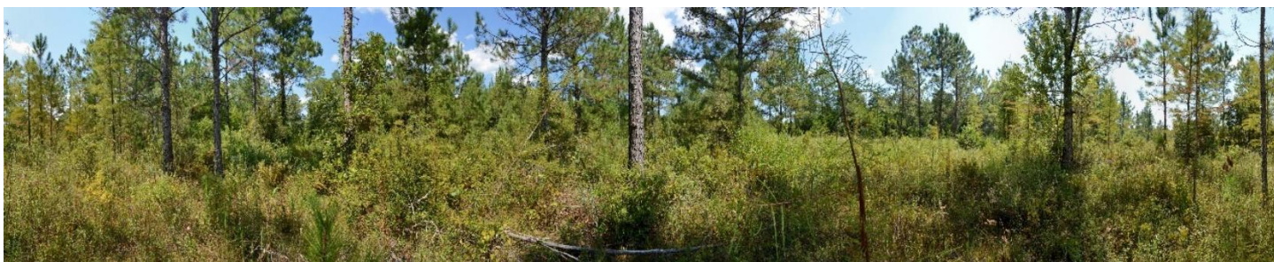
Perdido II Photo Point No. 1 – 9/17/2025