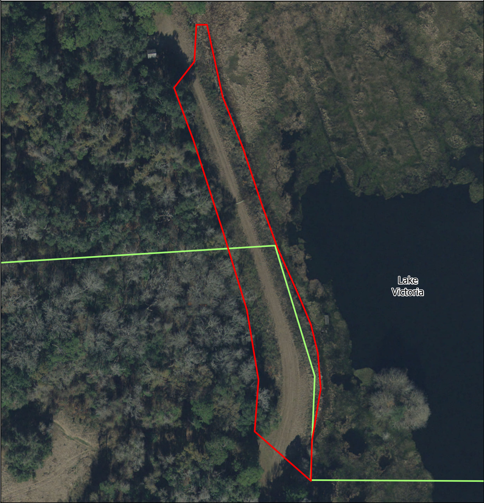
Exhibit Map 1

2026 Sand Pine and Hardwood Eradication Services - Unit 3 E.K. Phipps Park Section 35, Township 2N, Range 1W Leon County, Florida 1 Acre