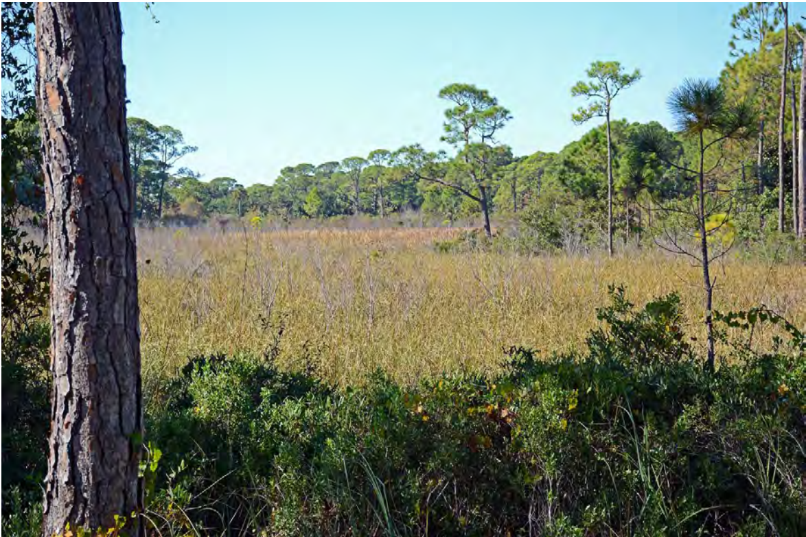
Enhancement Polygon, West Side (11/16/2016)