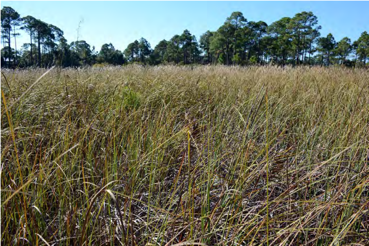
Enhancement Polygon, East Side (11/16/2016)