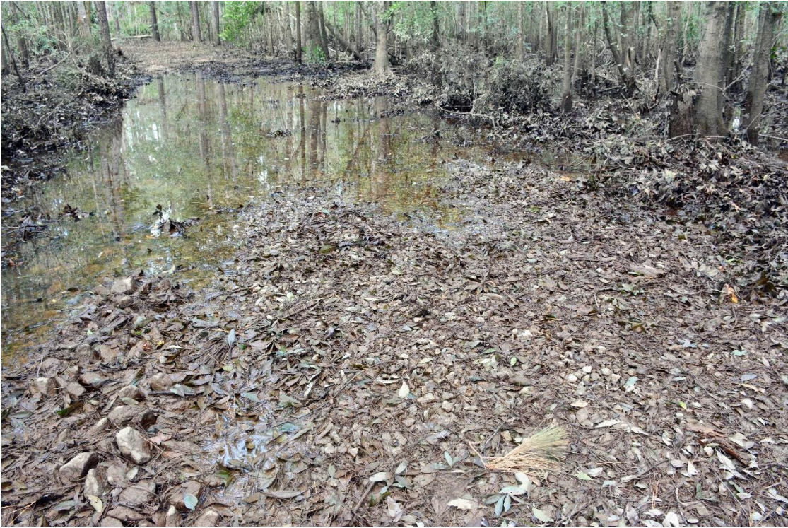
Cotton Creek Road LWC (9/29/2020)