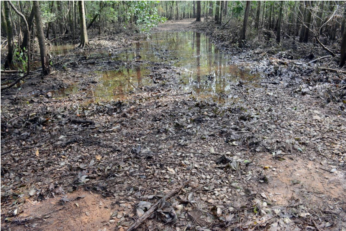
Cotton Creek Road LWC (9/29/2020)