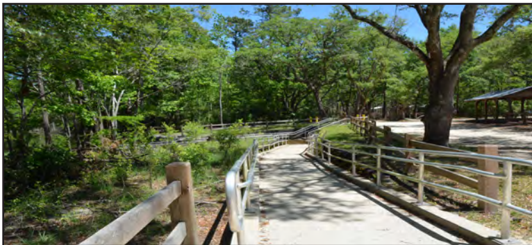
Above: Cotton Landing Boat Ramp Top right: Cotton Landing Campsite Center: Cotton Landing Day Use Area Picnic Pavilion Bottom right: Cotton Landing Campsite Diagram